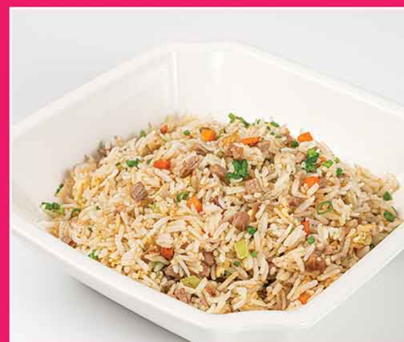
鸭粒炒饭 Wok-Fried Rice with Duck Meat