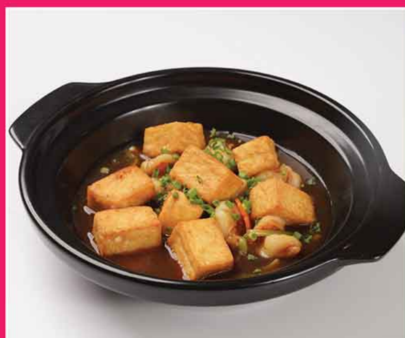
蟹肉海鮮豆腐煲 Braised Homemade Tofu with Seafood MMK 40,000