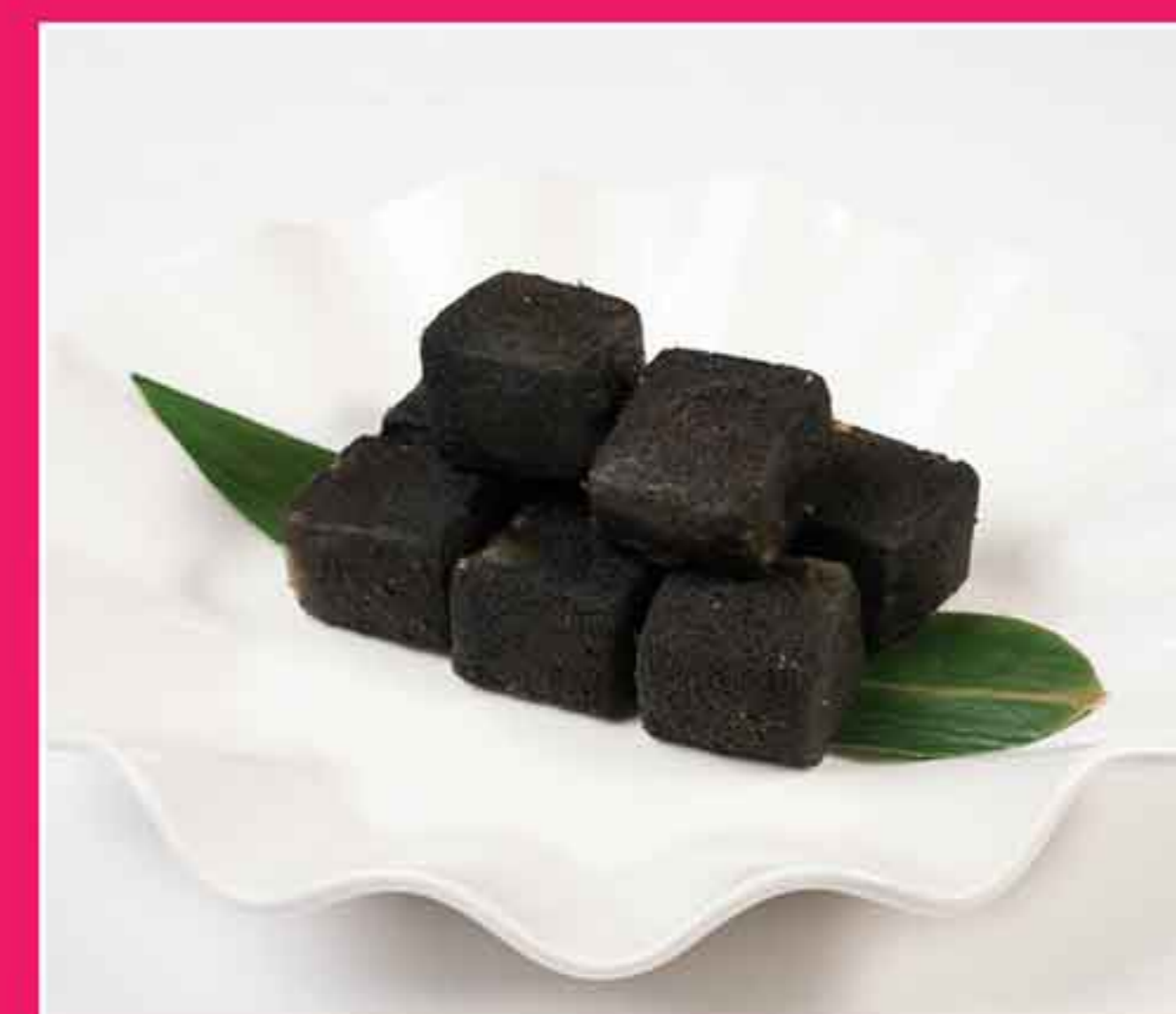
竹炭椒盐豆腐 Deep-Fried Charcoal Bean Curd with Salt & Pepper MMK 20,000