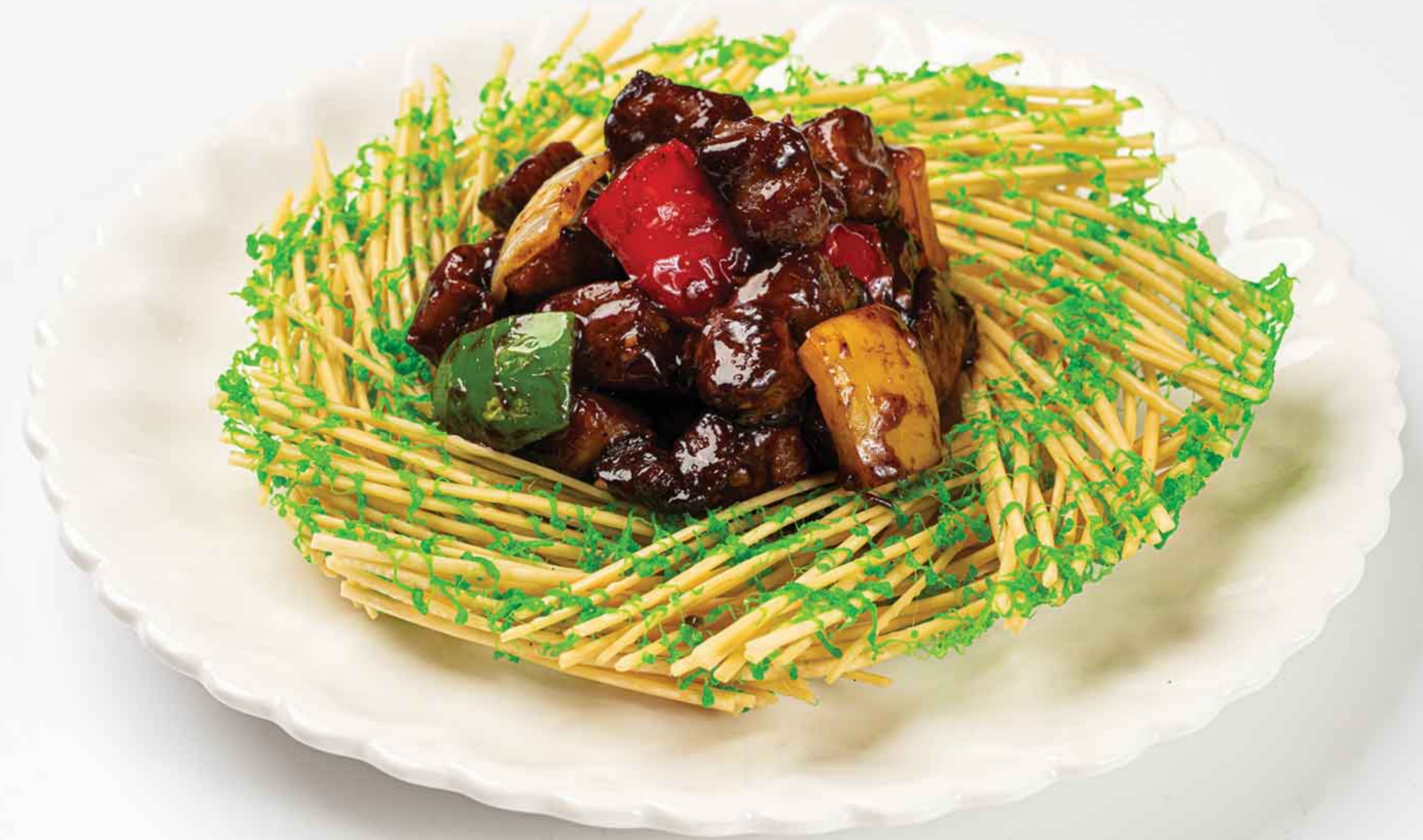
Wok-Fried Japanese A5 Wagyu Beef with Black Pepper Sauce