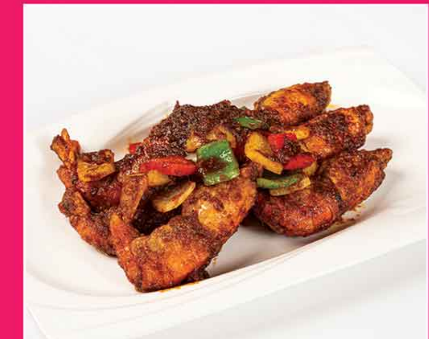
金牌金香 Signature Kam Heong with River Prawn