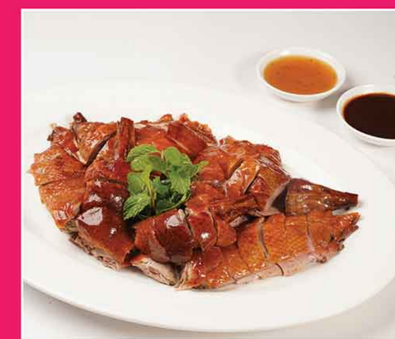
港式烧鸭 Cantonese Fire Roasted Duck