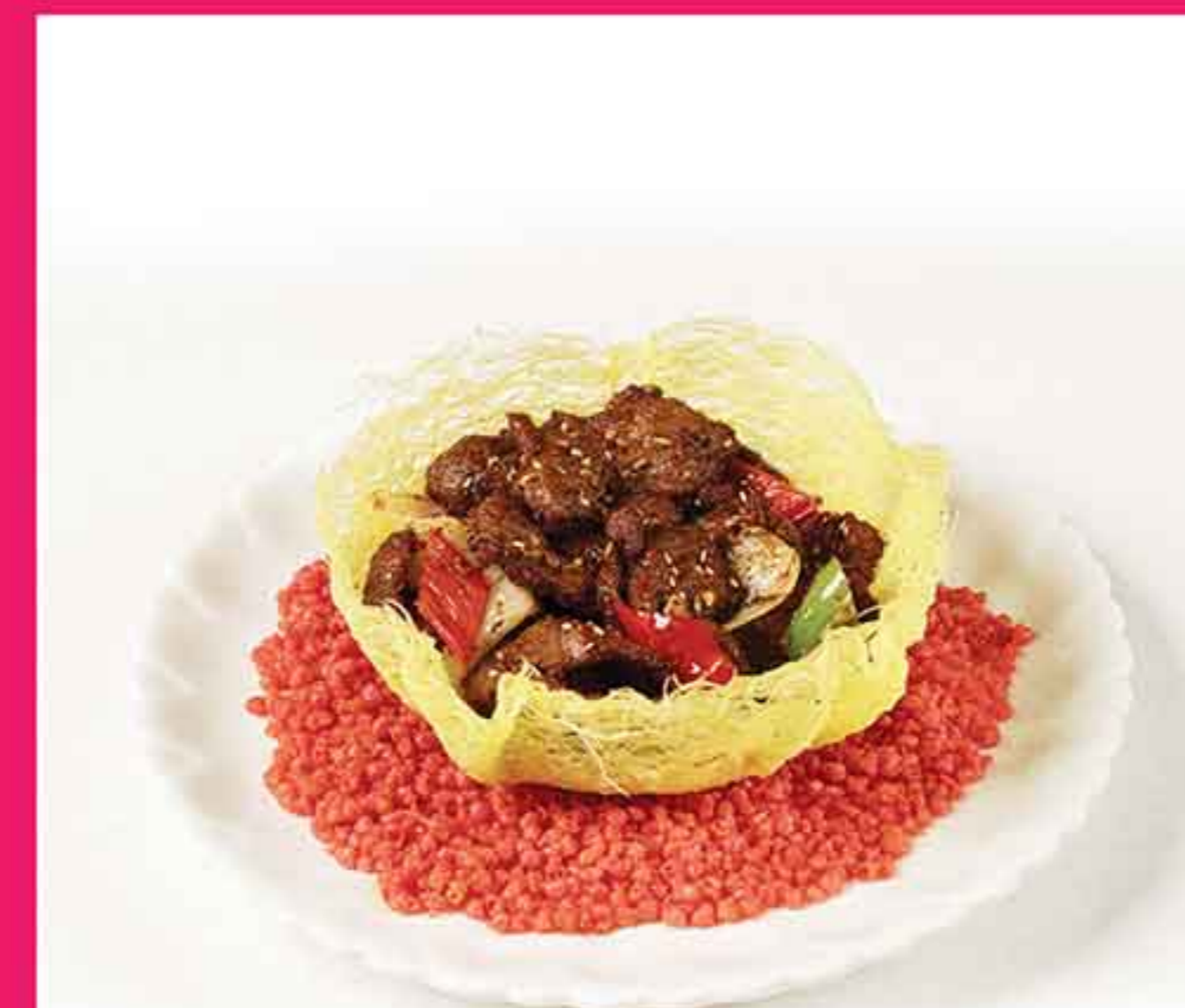
孜然羊肉片 🍴 Wok-Fried Diced Cumin Lamb MMK 108,000