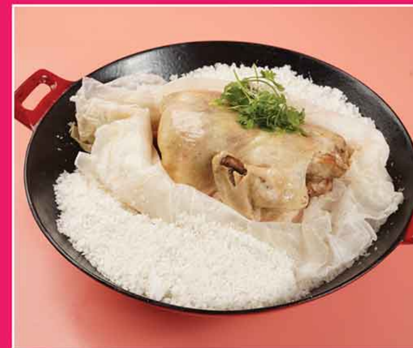
潮州盐烤鸡 🍴 Sea Salt Baked Chicken MMK 108,000