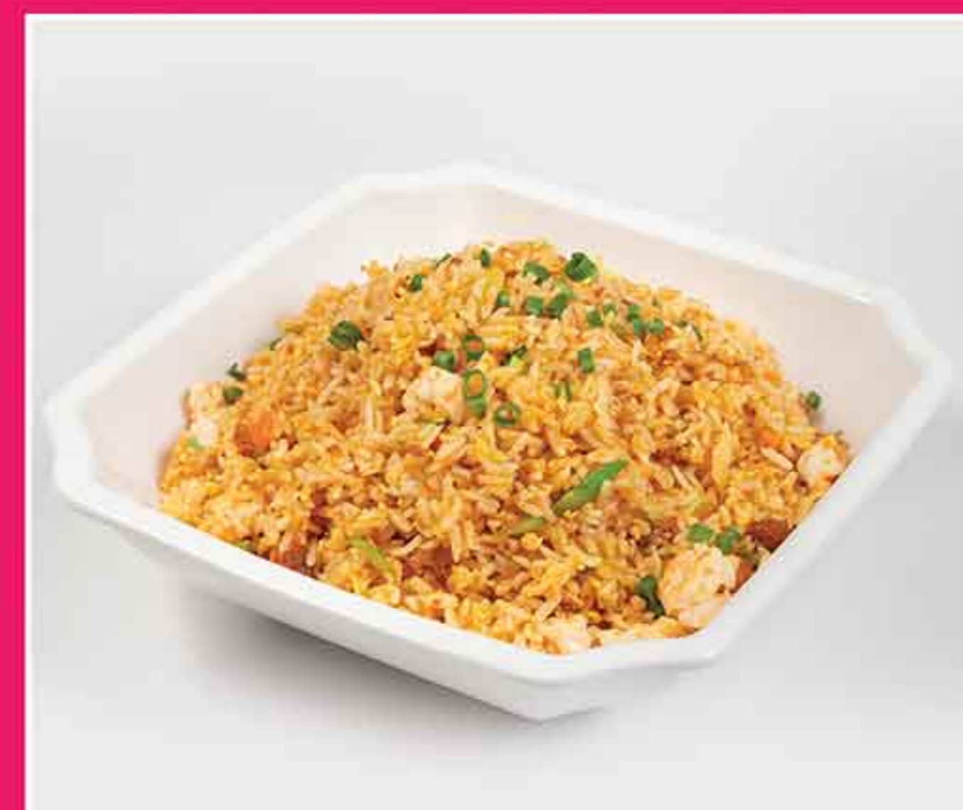
XO 醬帶子炒飯 🍴 XO Sauce Fried Rice with Dried Scallops MMK 25,000 (Single Portion) / 45,000