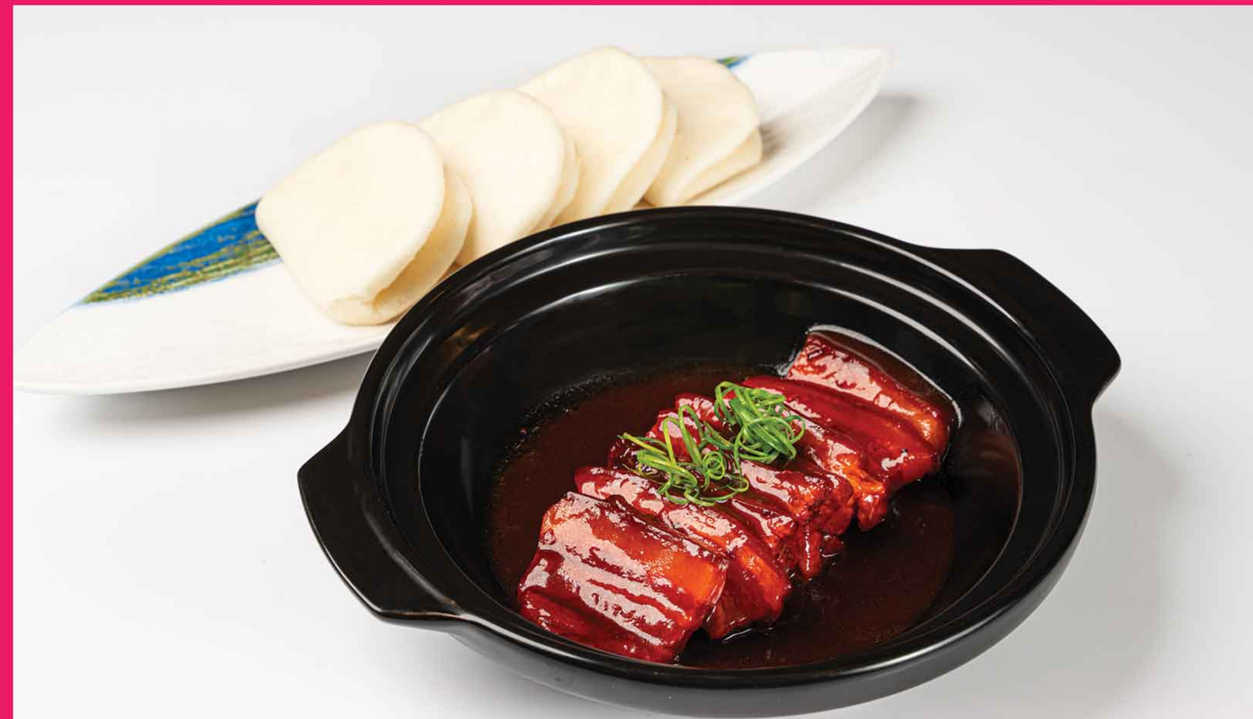
Braised Tong Po Pork Served with Plain Bun