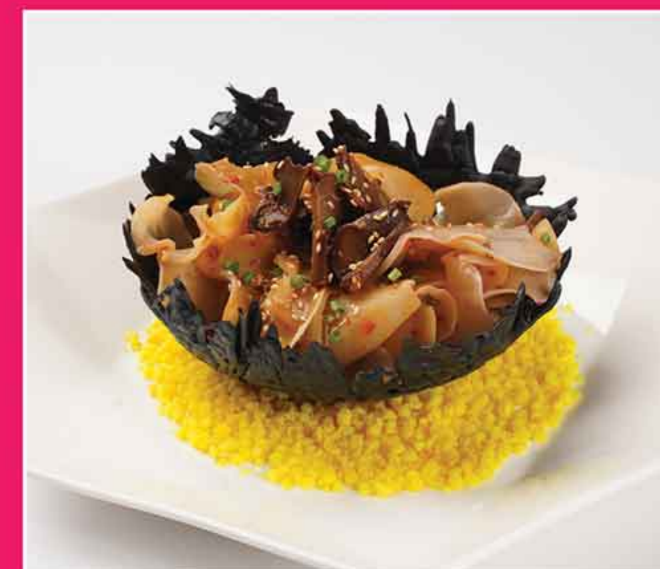
凉拌海螺白玉耳 🍄 Chilled Marinated Snow Fungus with Top Shells MMK 45,000