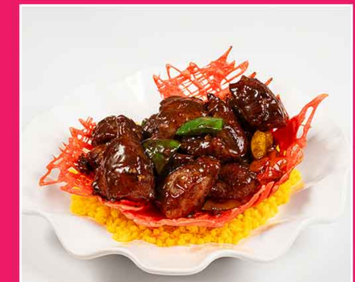
黑椒牛仔粒 🍴 Wok-Fried Australian Beef Tenderloin with Black Pepper Sauce MMK 60,000 (Single Portion) / 80,000