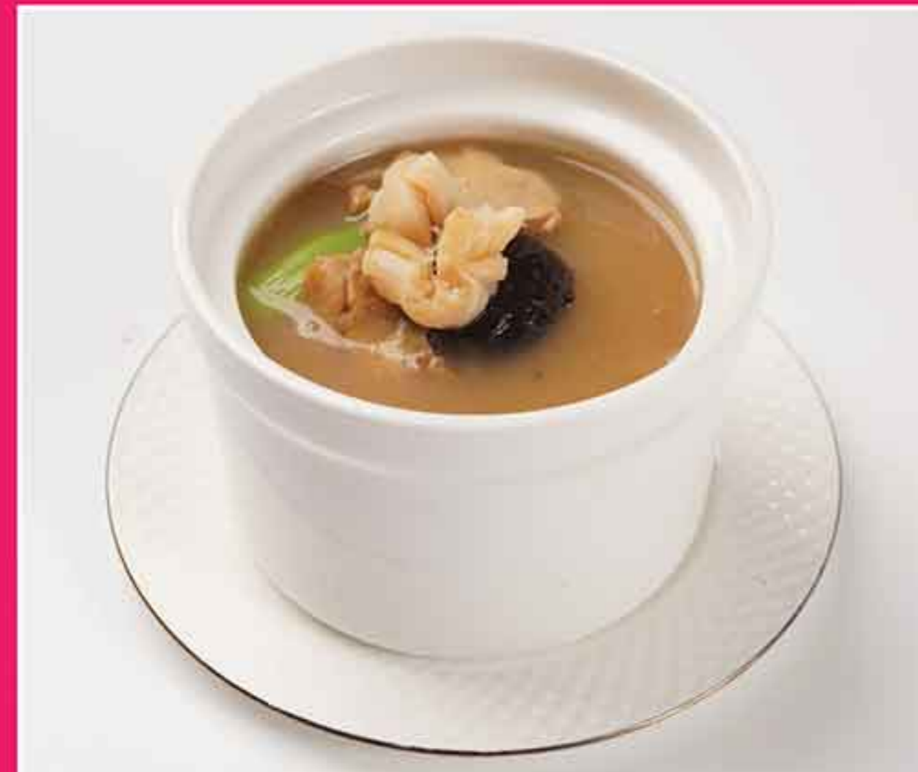
鲨鱼骨花胶汤 Premium Dried Fish Maw, Fish Bones Conch Soup MMK 60,000