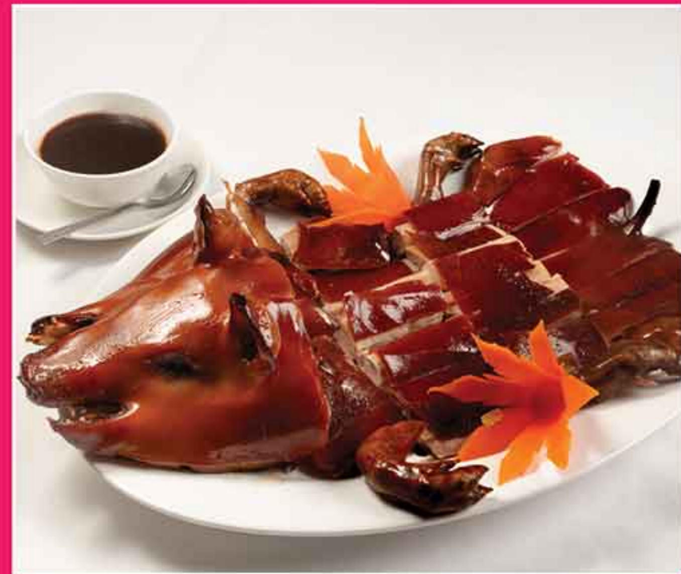
港式烤乳猪 | 整只 🍴 Oven-Baked Crispy Suckling Pig Whole Seasonal Price (Per 100g) (Pre-Order/ Per Portion)