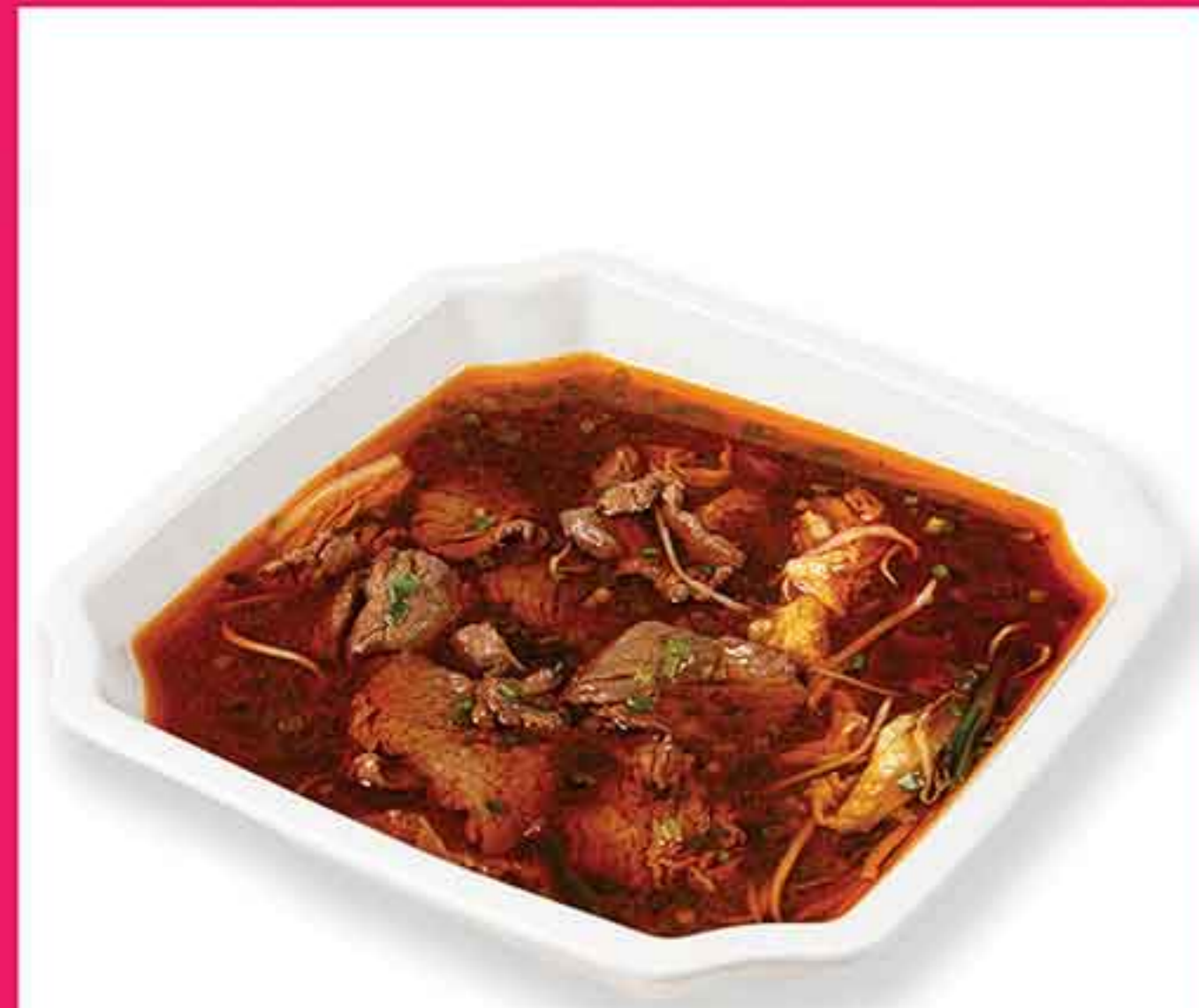
四川水煮牛肉 🌶️🌶️ Sichuan Style Boiled Beef Slices MMK 48,000