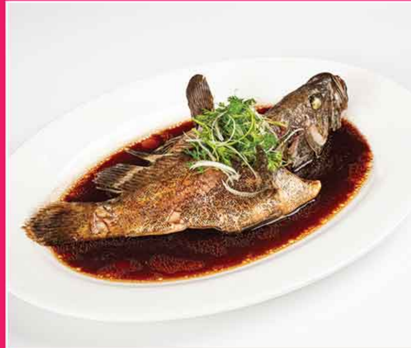
清蒸 Steamed Grouper Fish with Superior Soy Sauce