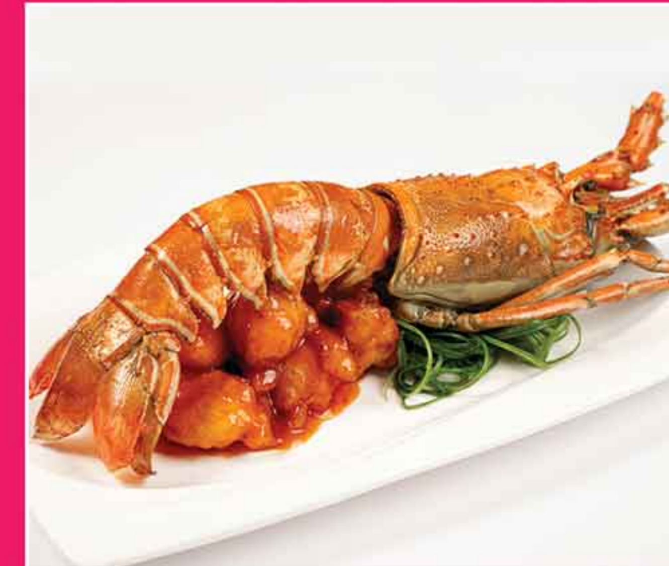
辣子炒 Wok-Fried Green Lobster with Spicy Sauce