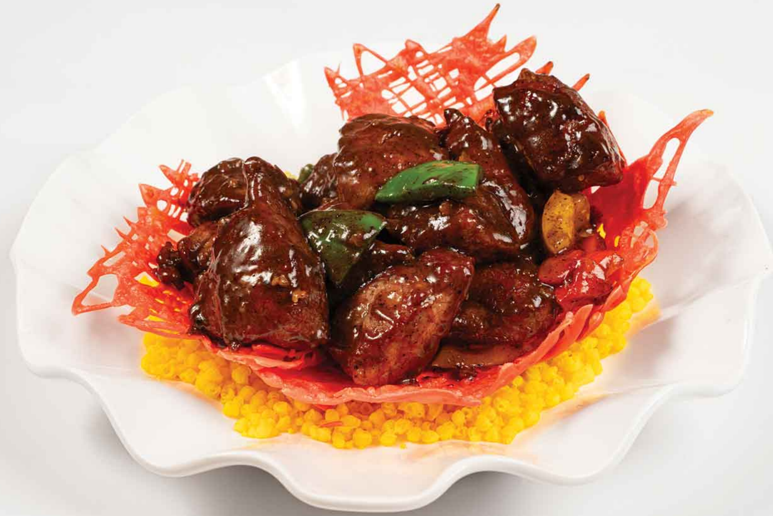
Wok-Fried Australian Beef Tenderloin with Black Pepper Sauce