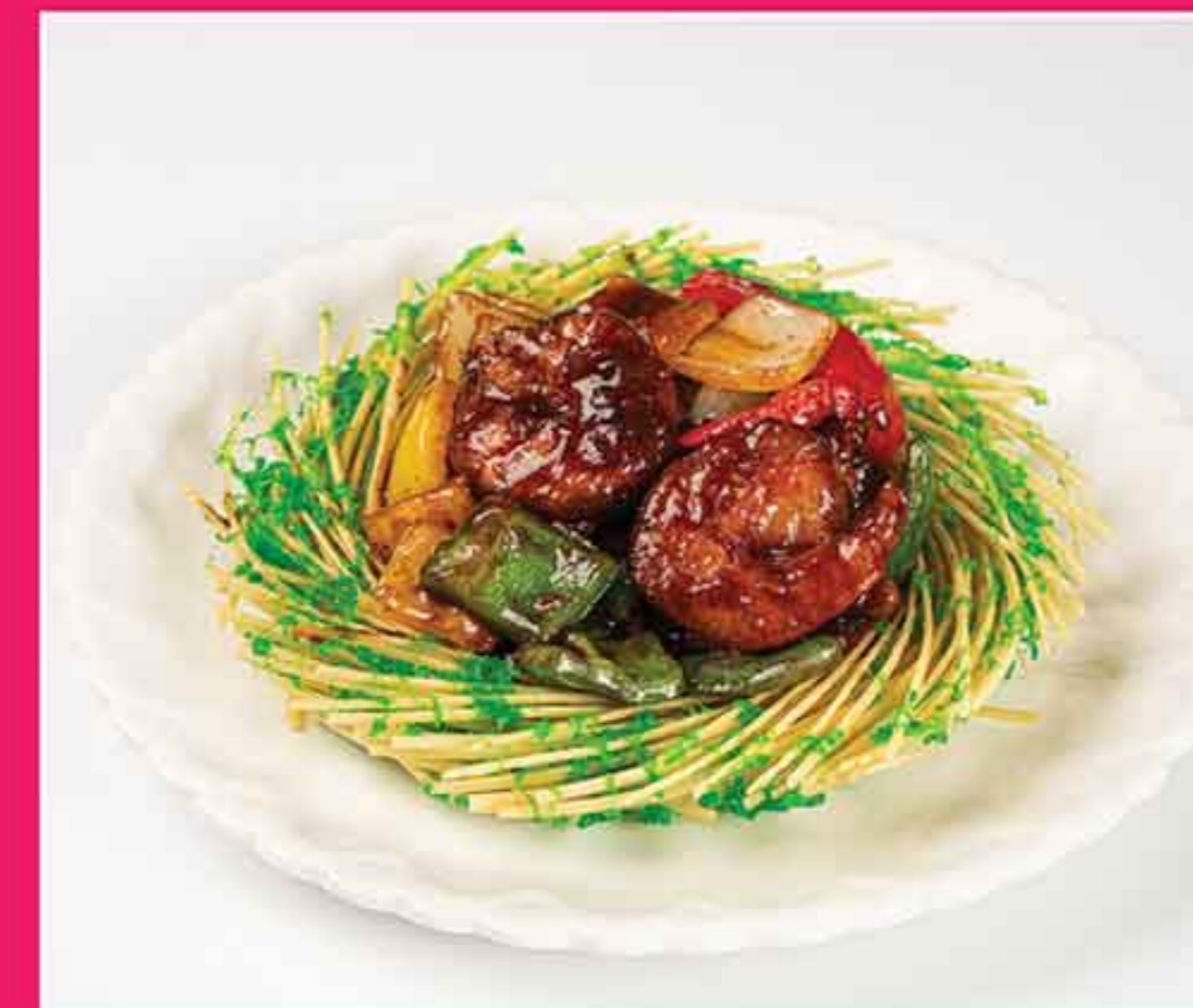
牛油黑椒 Wok-Fried Tiger Prawn with Black Pepper Butter Sauce