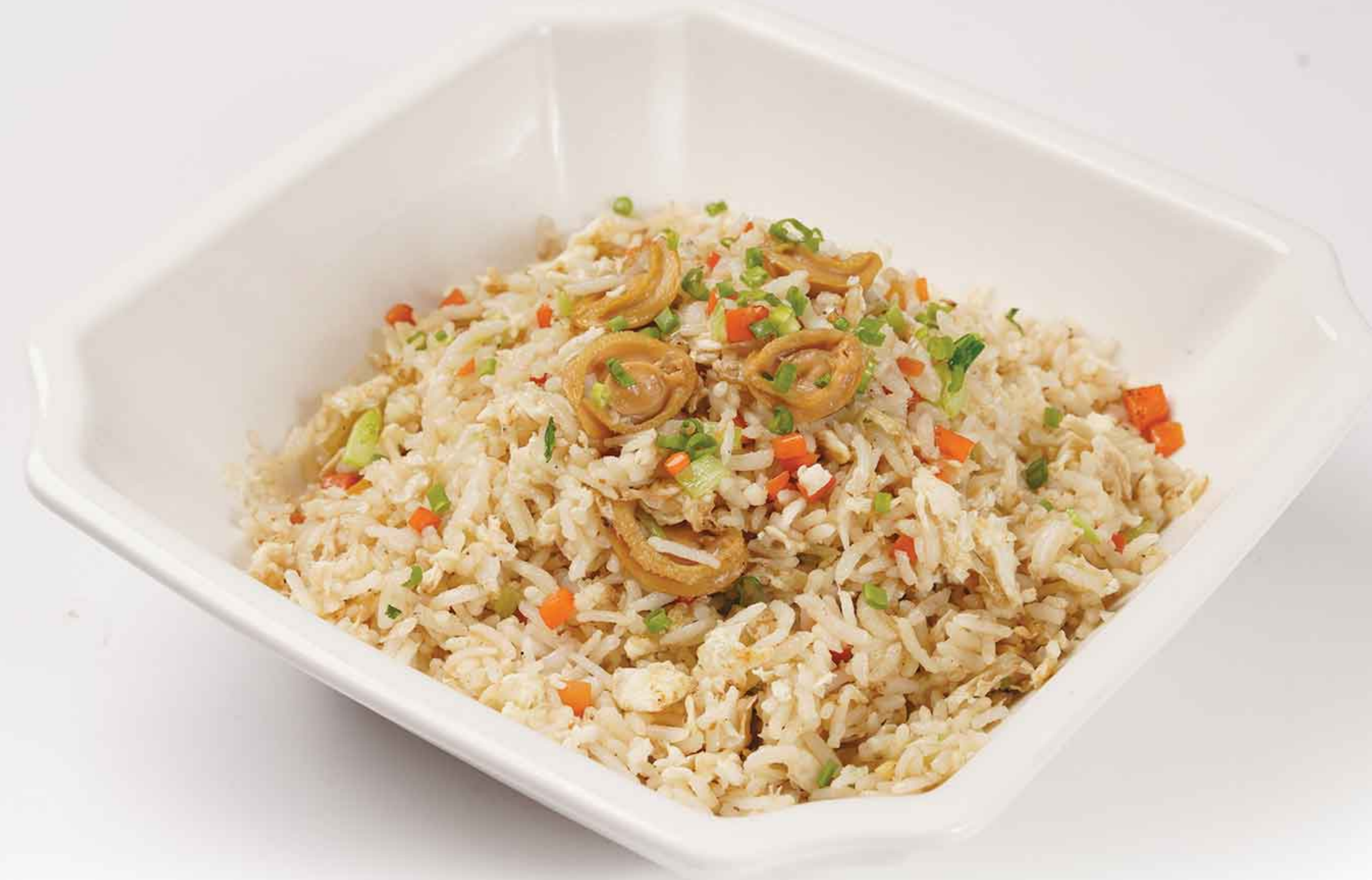
Crab Meat Rice with Baby Abalone