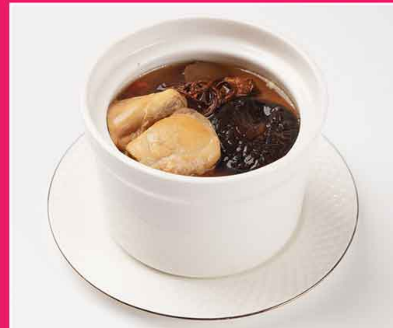
时日盅仔列汤 🍴 Chef's Special MMK 30,000