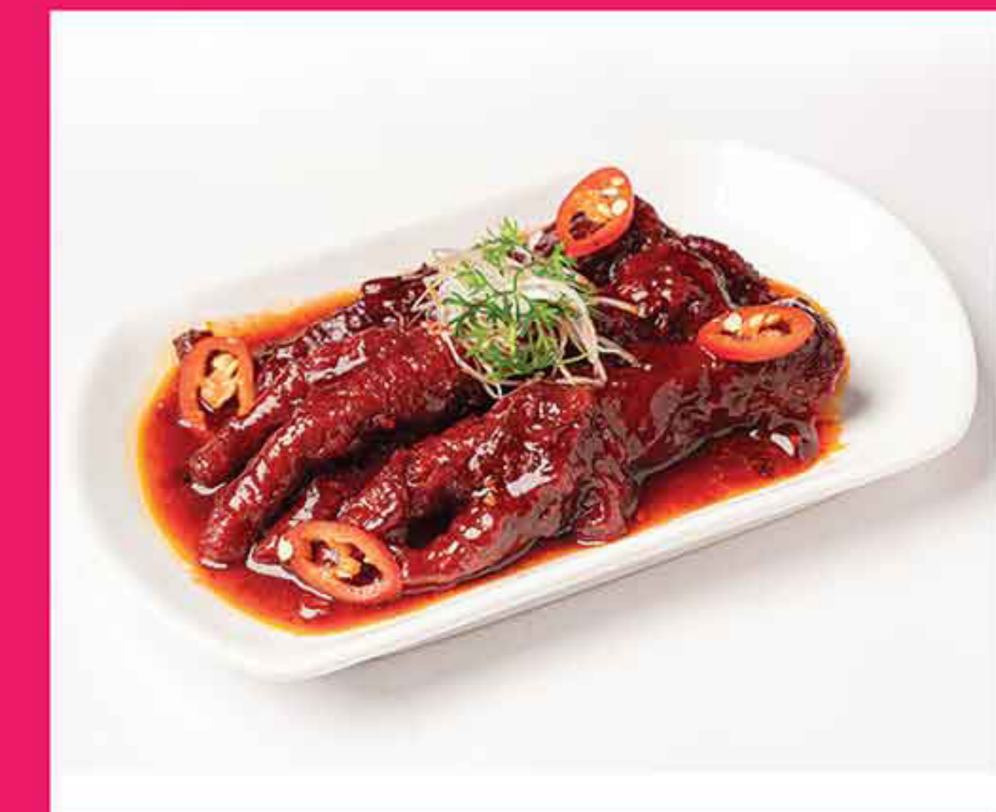
古式燜雞爪 Steamed Chicken Feet with Barbecue Sauce MMK 10,500