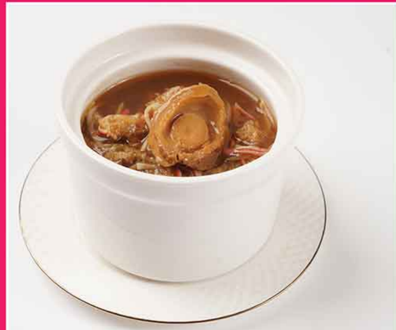
原只鲍鱼海寶羹 Braised Sea Treasure Broth with Whole Abalone MMK 60,000