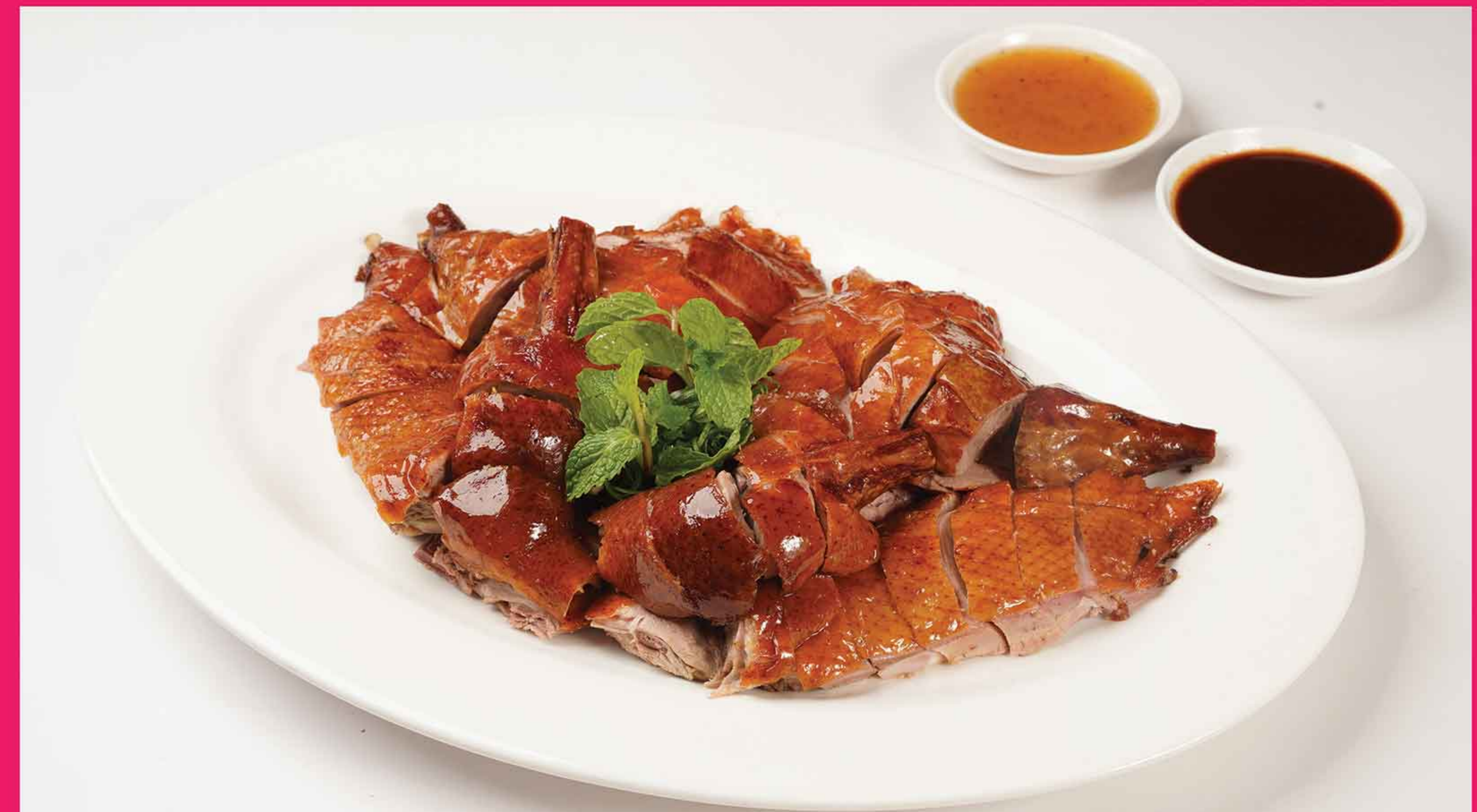
Cantonese Style Fired Roasted Duck