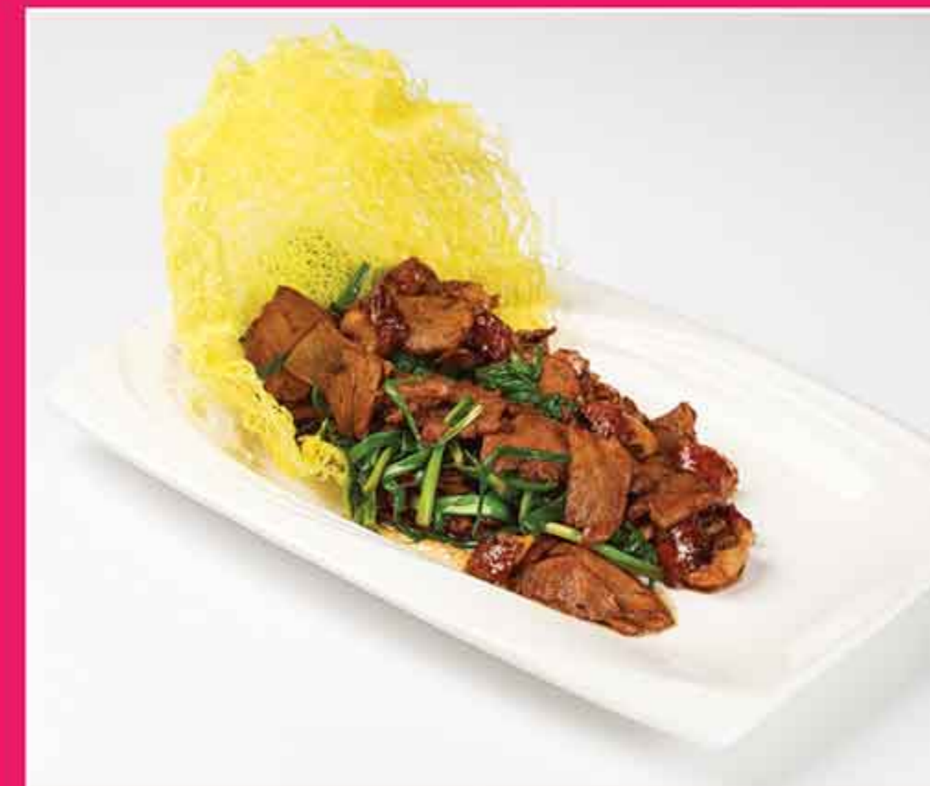
姜葱香炒 Wok Stir-Fried Ginger and Spring Onions