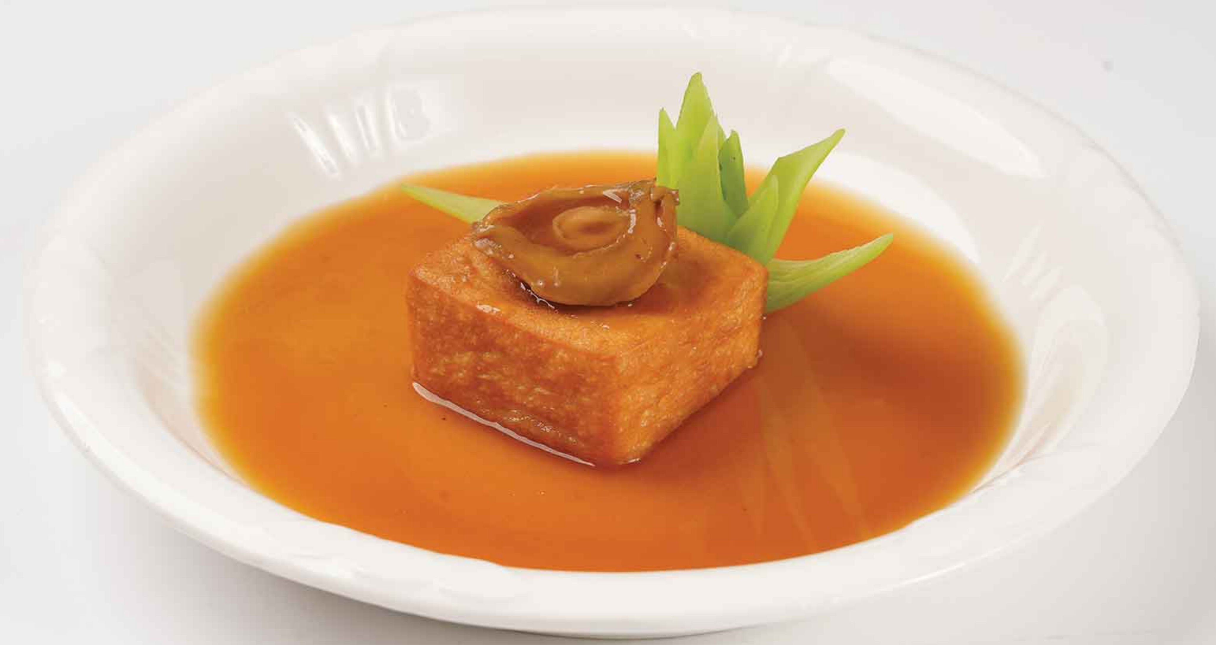
Braised Ten-Head Whole Abalone with Homemade Bean Curd