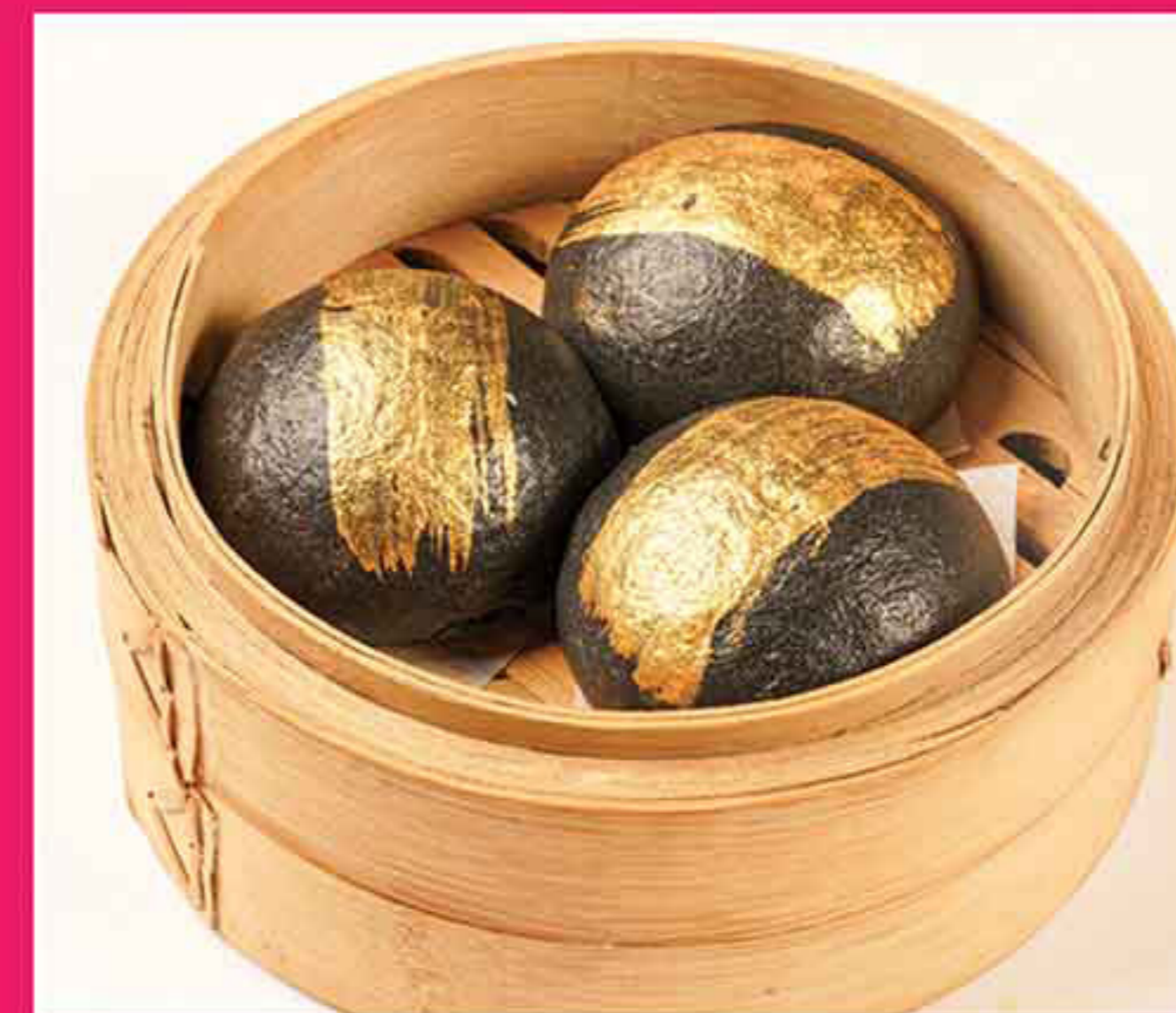
香園竹炭香滑流沙包 Fragrant Garden Salted Egg Yolk Custard Charcoal Buns MMK 12,600