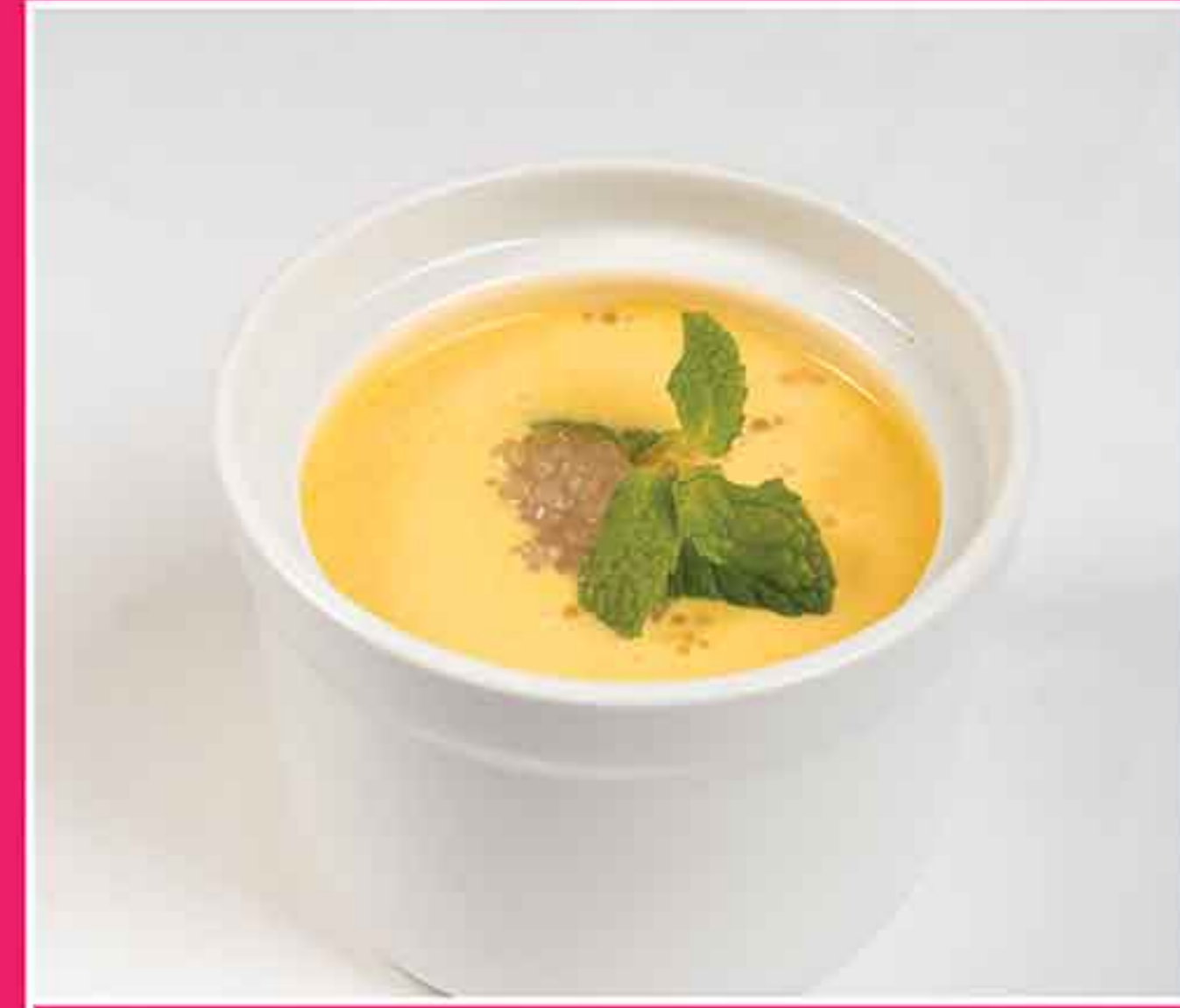
杨枝水果龟苓膏 Chilled Mango Puree with Mixed Fruit and Herbs Jelly MMK 15,000