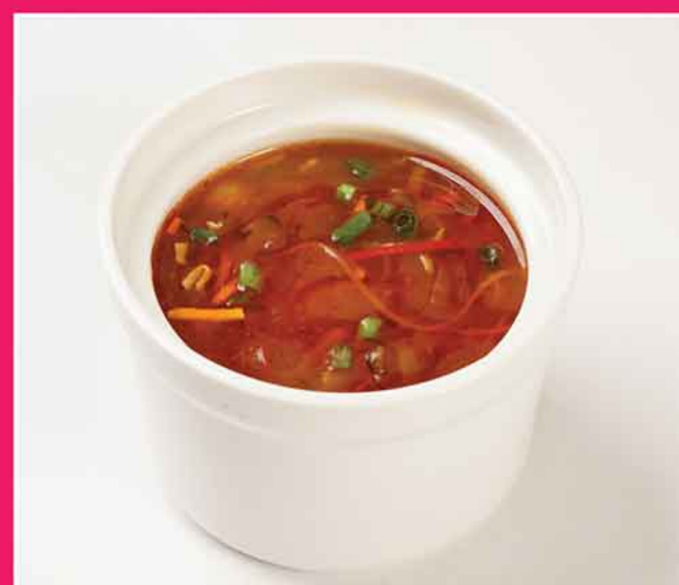
宫庭酸辣羹 🍲 Imperial Seafood Hot and Sour Soup MMK 15,000