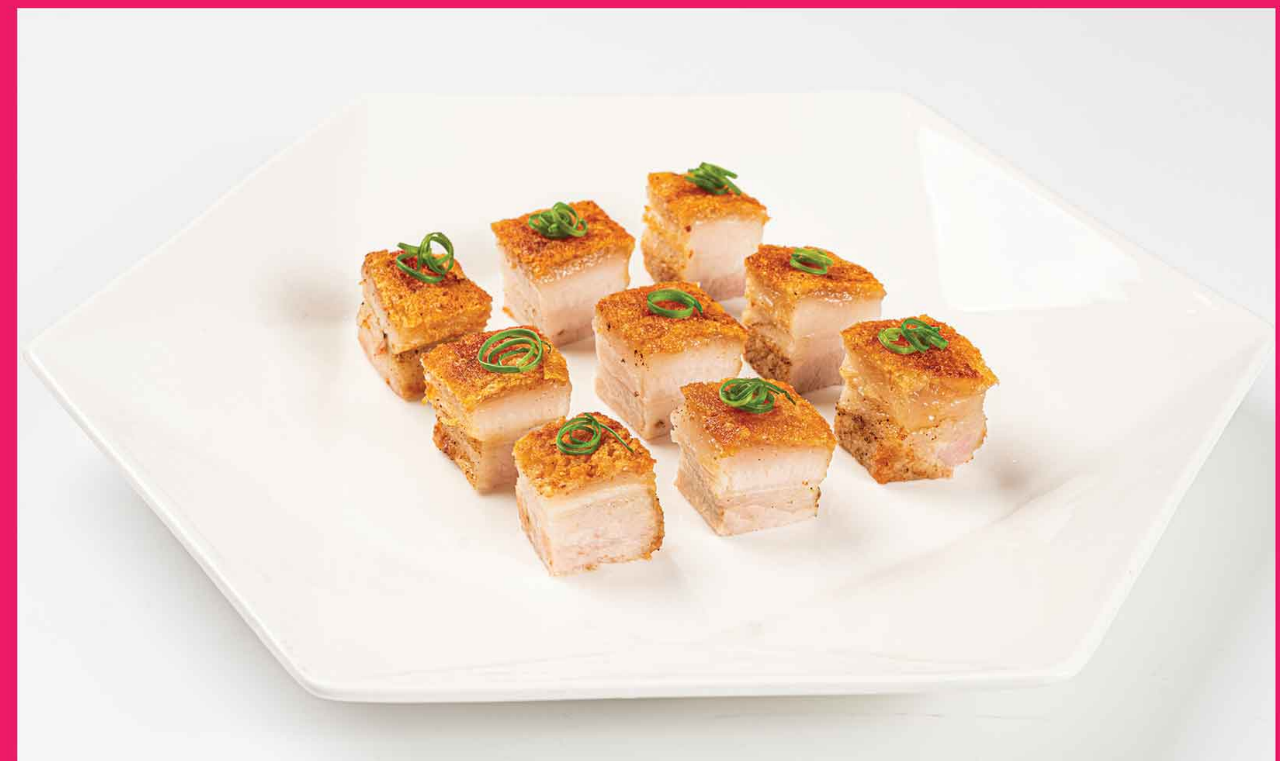
Traditional Rock Salt Roasted Pork Belly