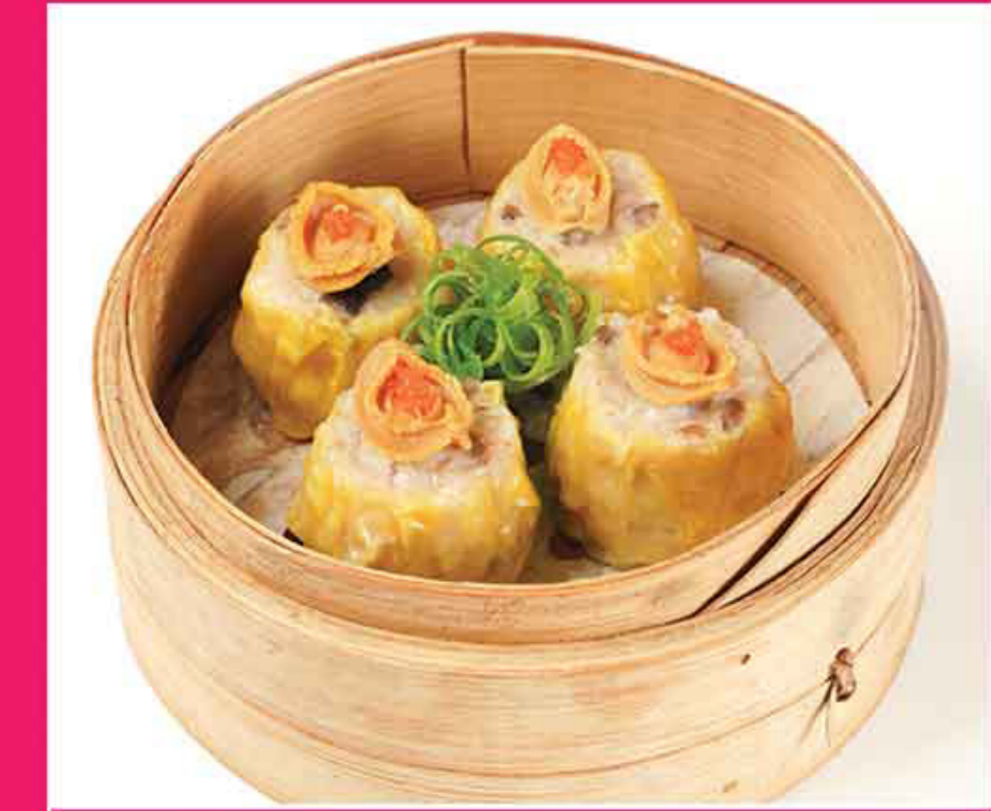
紅燒鮑魚燒賣皇 Steamed Abalone and Pork Siew Mai with Fish Roe MMK 17,500