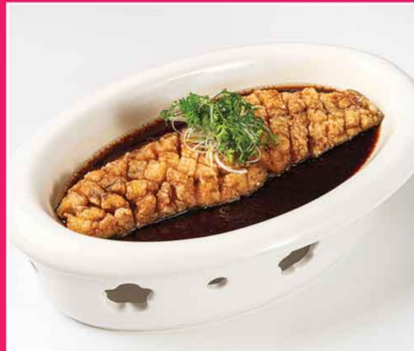
油浸 Deep-Fried Seabass with Superior Soy Sauce