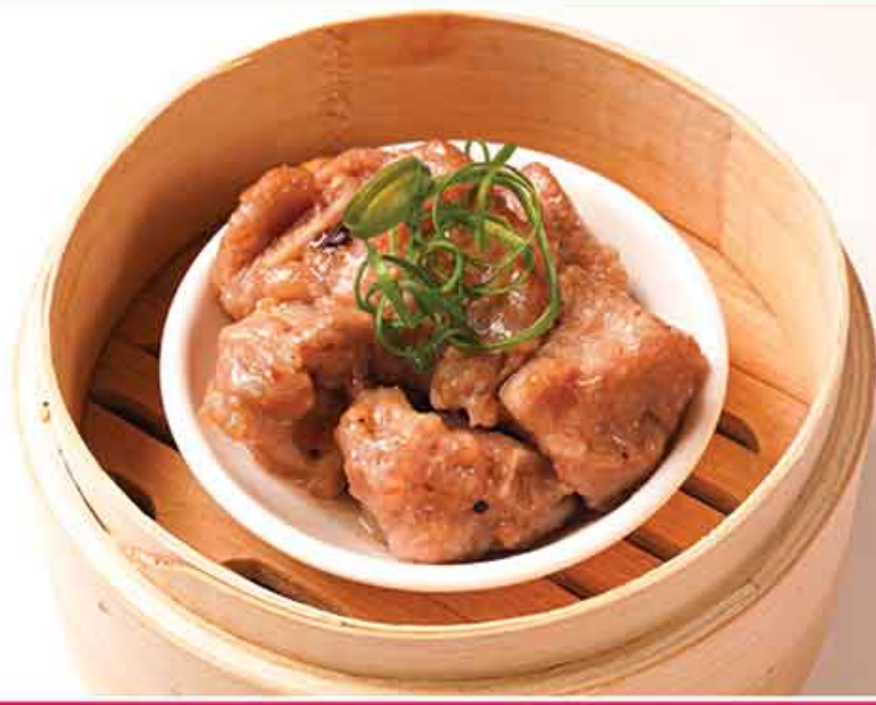
豉汁蒸排骨 Steamed Pork Spare Ribs with Black Bean Paste MMK 10,500