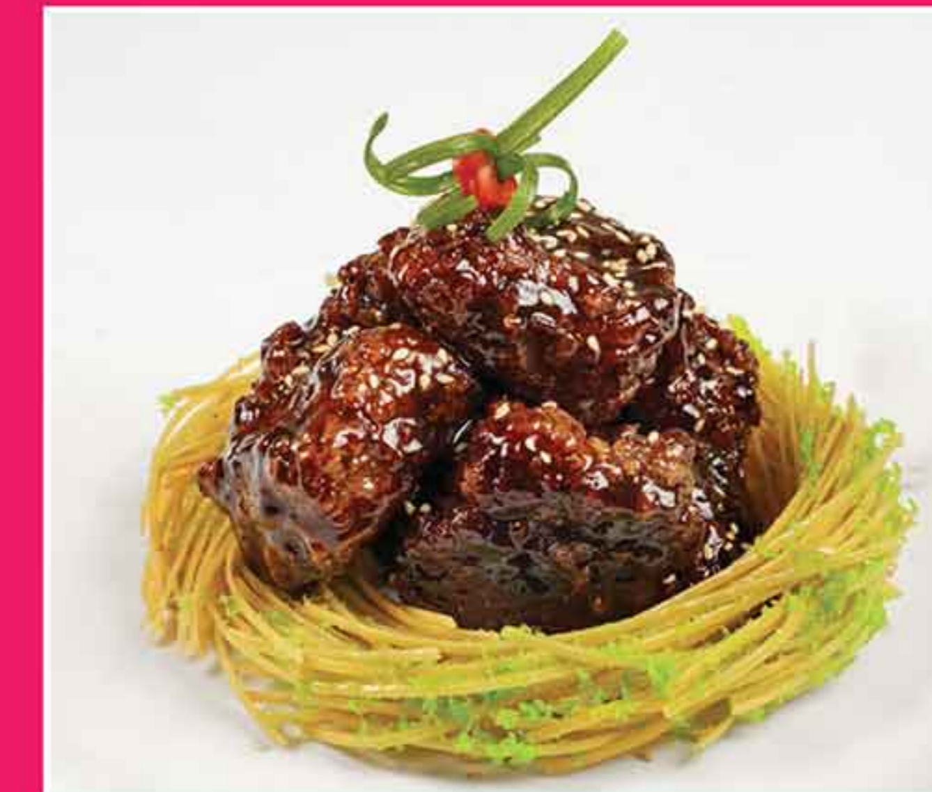
咖啡排骨 🍴 Coffee-Braised Fried Ribs MMK 35,000