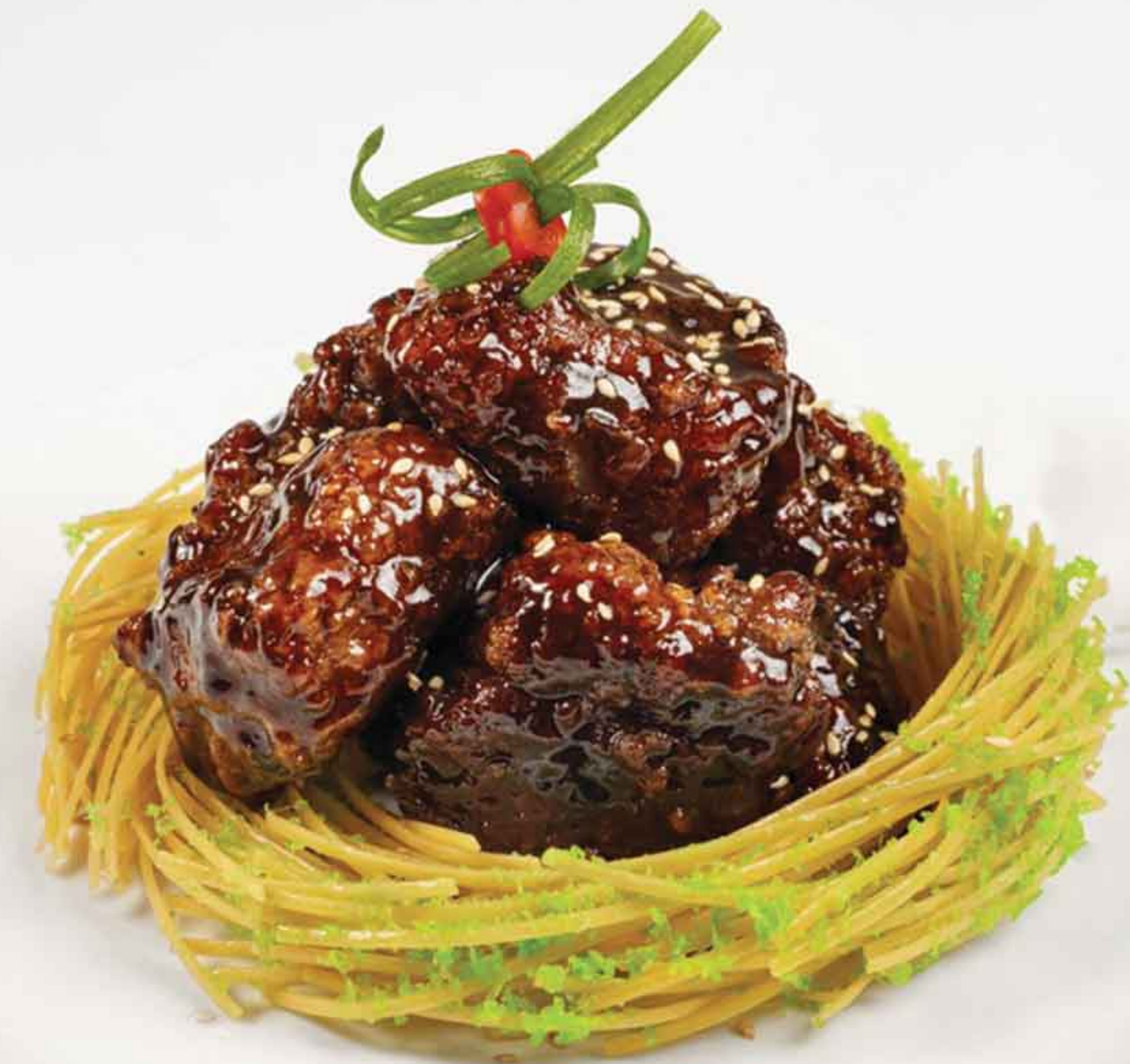
Coffee-Braised Fried Ribs