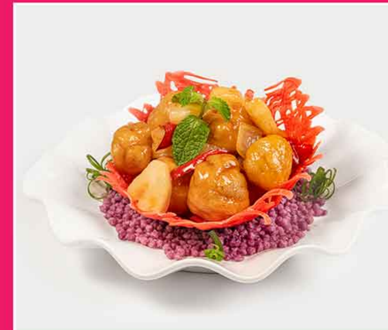
果醋咕嚕肉 Pomegranates Sweet and Sour Pork MMK 25,000 (Single Portion) / 50,000