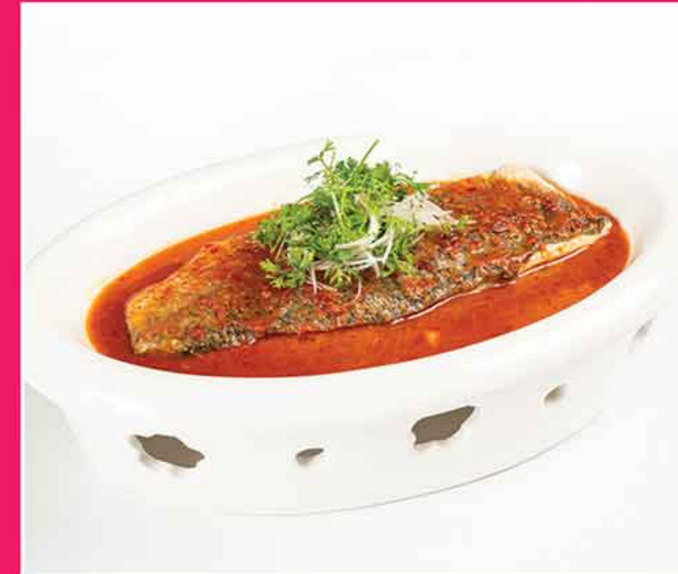
酱蒸 Steamed Seabass with Jiang Zheng Style