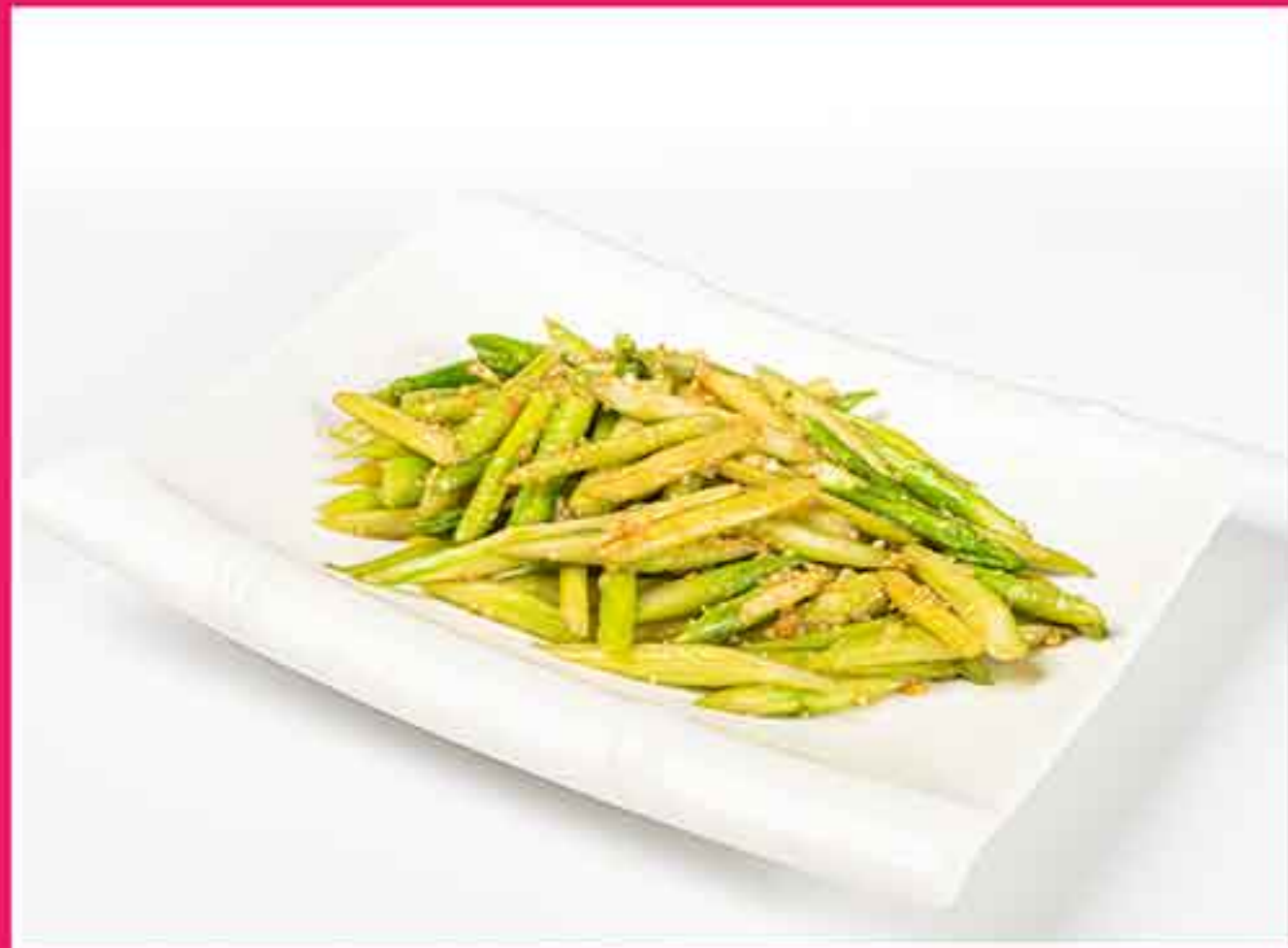
清炒 Wok-Fried Asparagus