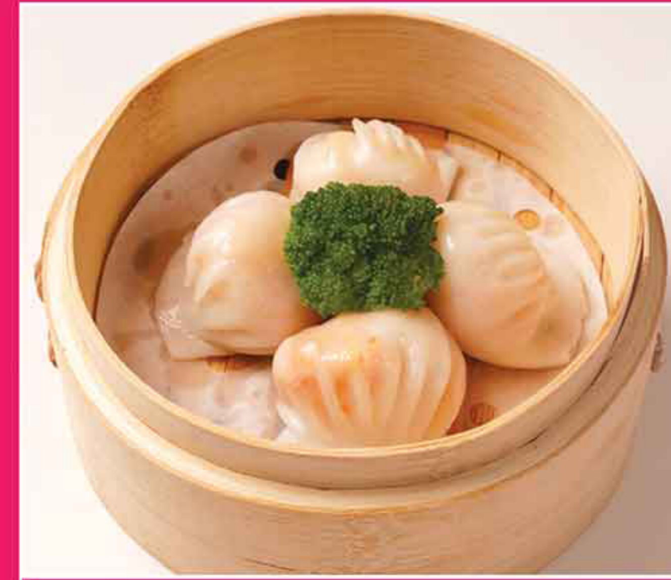
瑤柱鮮蝦餃 Steamed Prawn Dumplings with Sun-Dried Scallops MMK 17,500