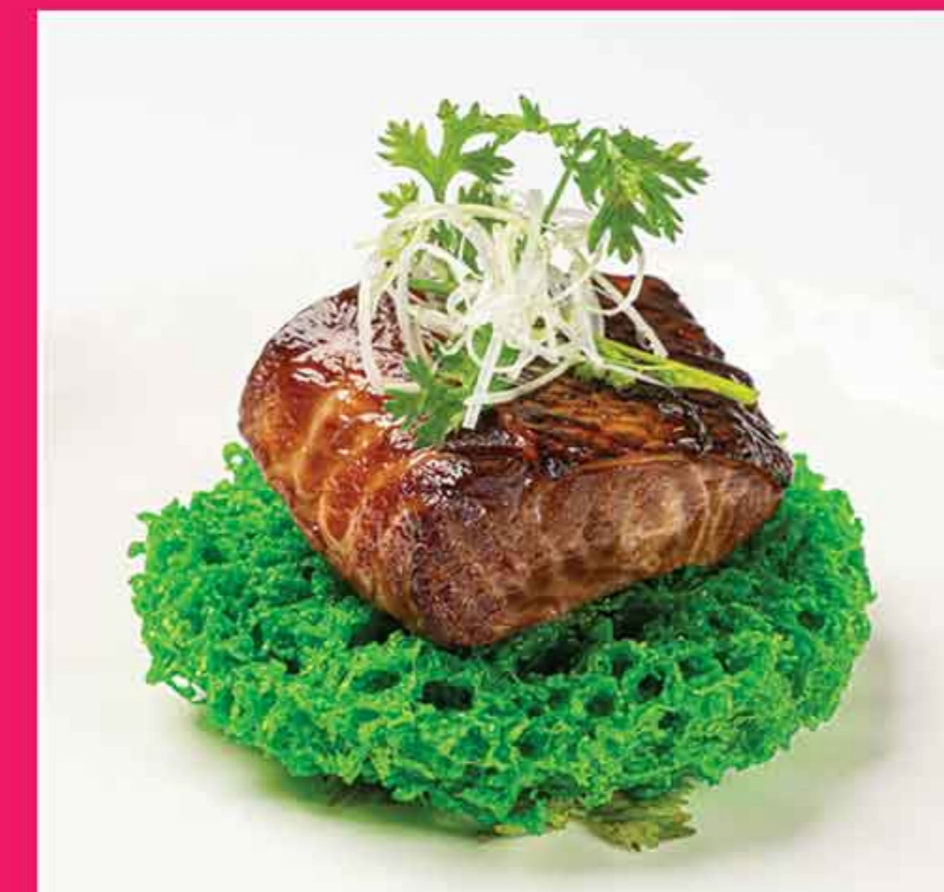
橙盅焗鳕鱼 Oven-Baked Cod Fish with Honey Plum Sauce MMK 70,000 (Per Portion)