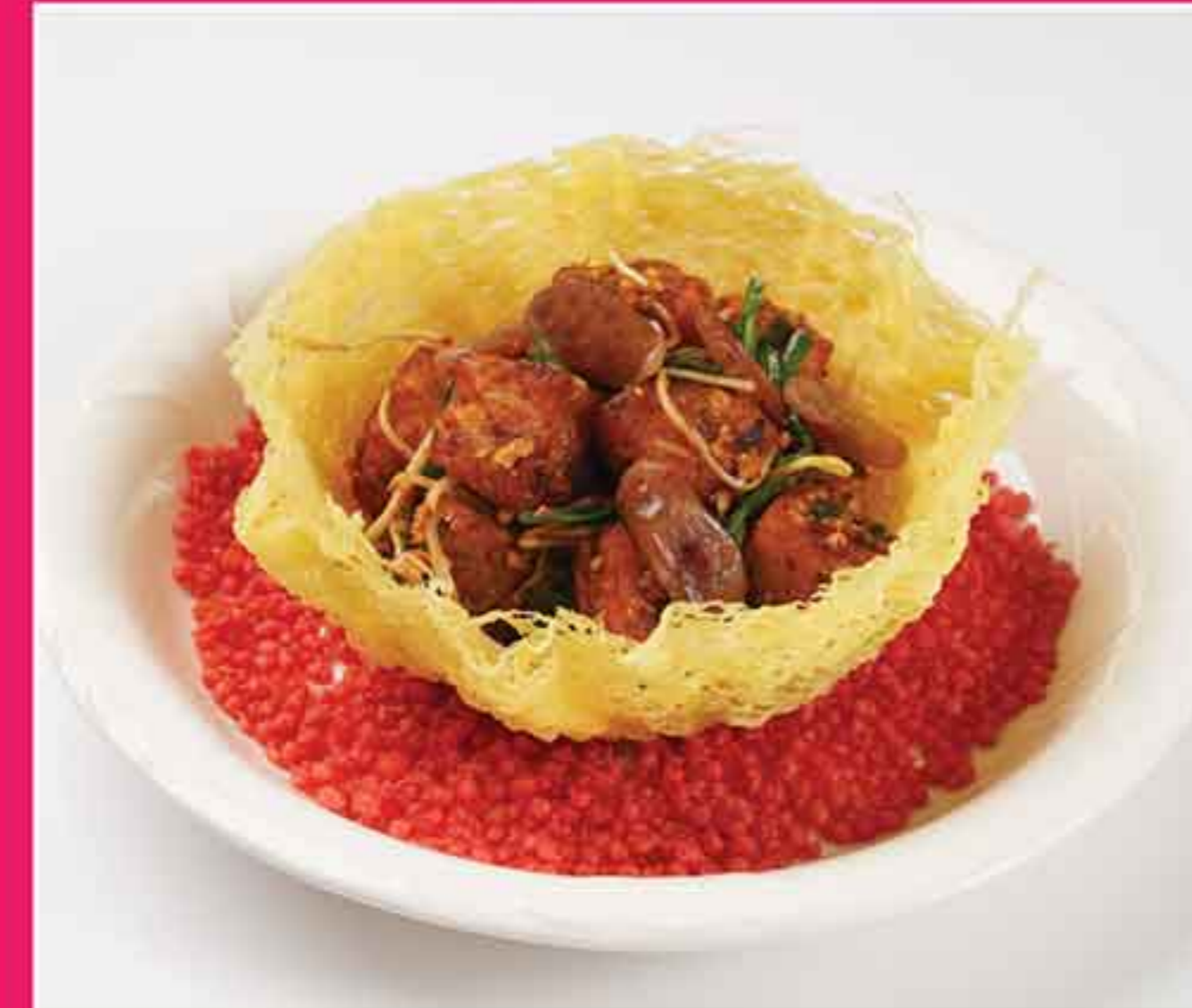
潮醬炒萝卜糕 Wok-Fried Turnip Cake with Supreme Spice Sauce MMK 12,600