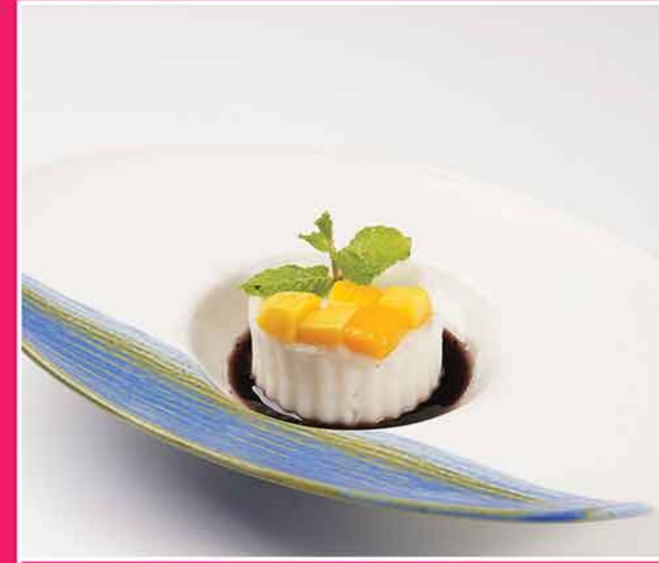
蓝莓山药慕斯 Chilled Chinese Yam with Blueberry Sauce MMK 15,000