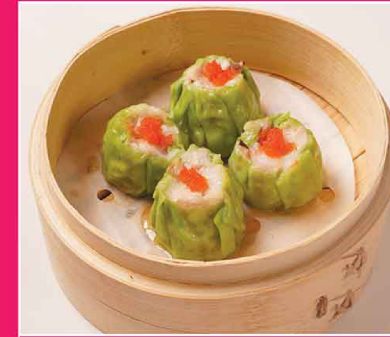
帶子燒賣皇 Steamed Prawn and Chicken Dumplings with Scallops MMK 15,400