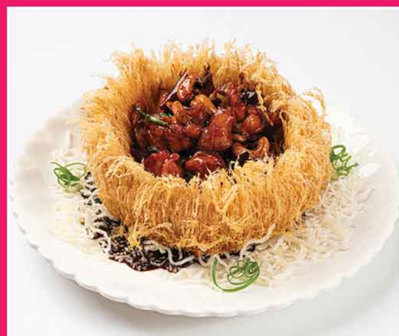
佛钵宫保鸡丁 🍴🌶️ Kung Pao Chicken with Cashew Nuts and Dried Chili MMK 20,000