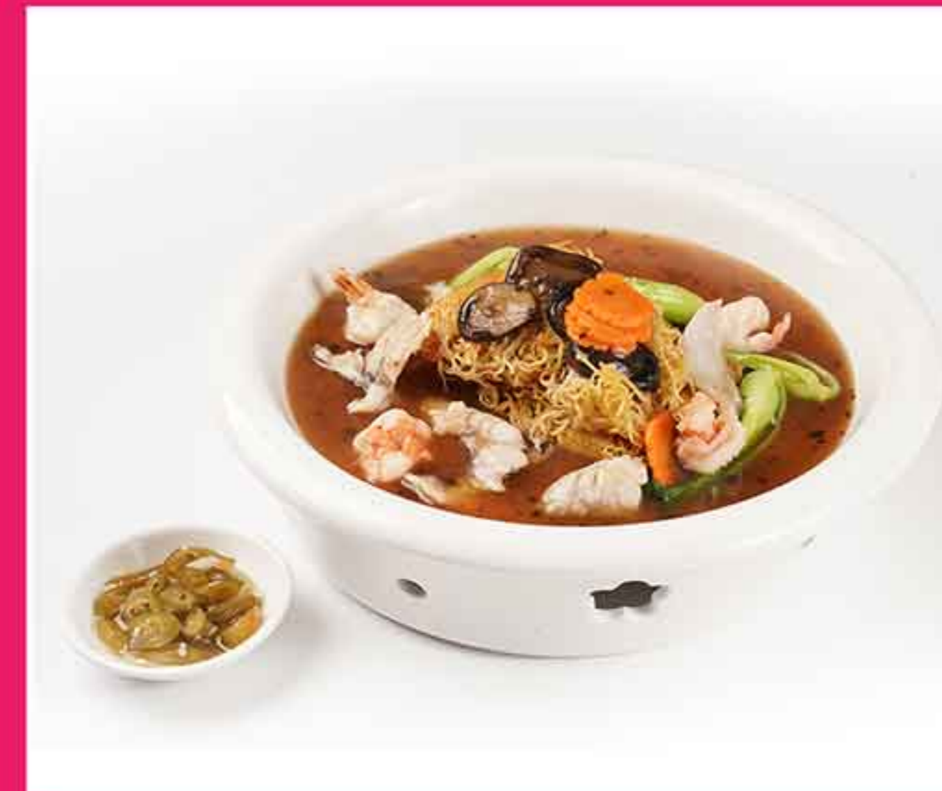
豉汁海鮮煎生面 🌶️ Crispy Egg Noodle with Assorted Seafood and Vegetables MMK 15,000 (Single Portion) / 25,000