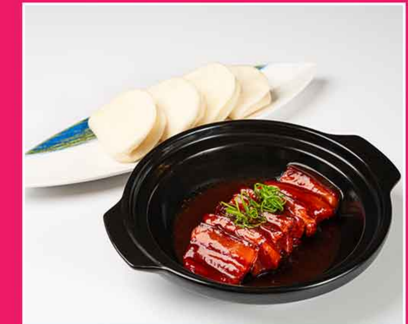
红烧东波肉 🍴 Braised Tong Po Pork Served with Plain Bun MMK 35,000