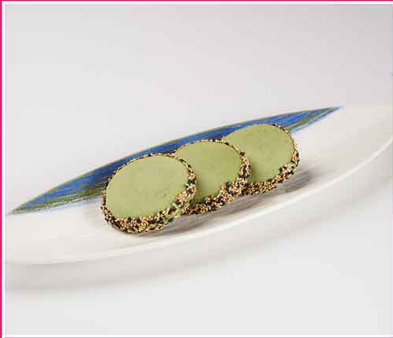
绿茶佛饼 Green Tea Sesame Yam Cake MMK 10,000