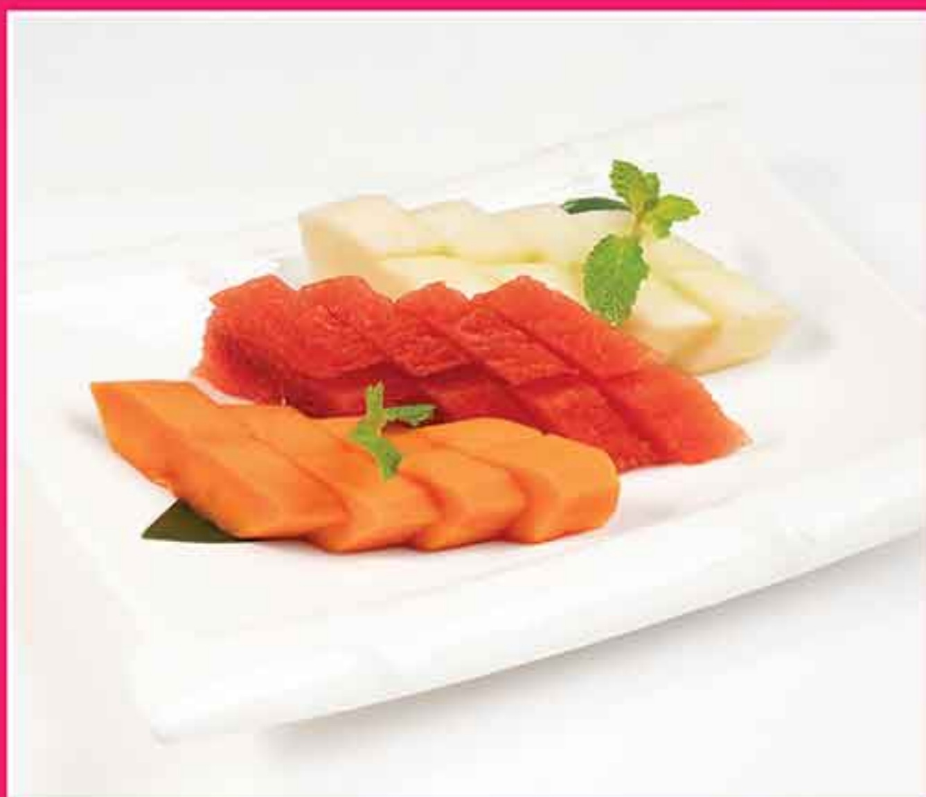
时鲜水果盘 The Seasonal Fruits Platter MMK 10,000