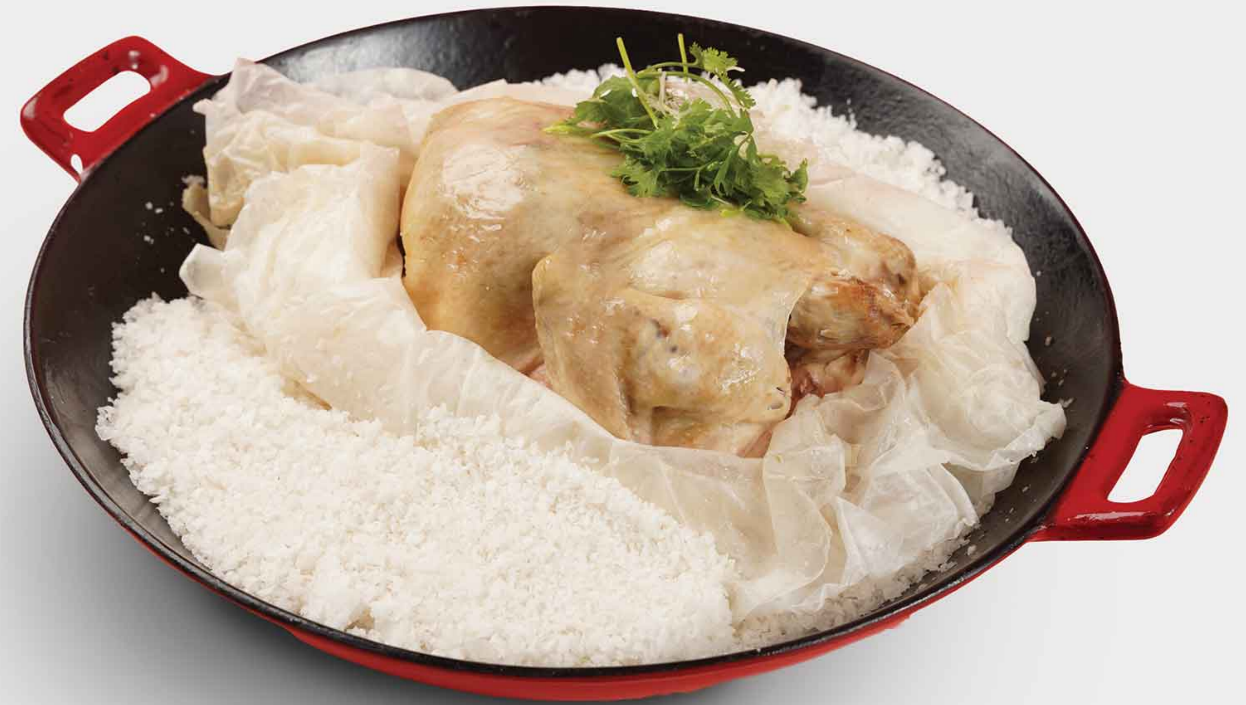
Sea Salt Baked Chicken