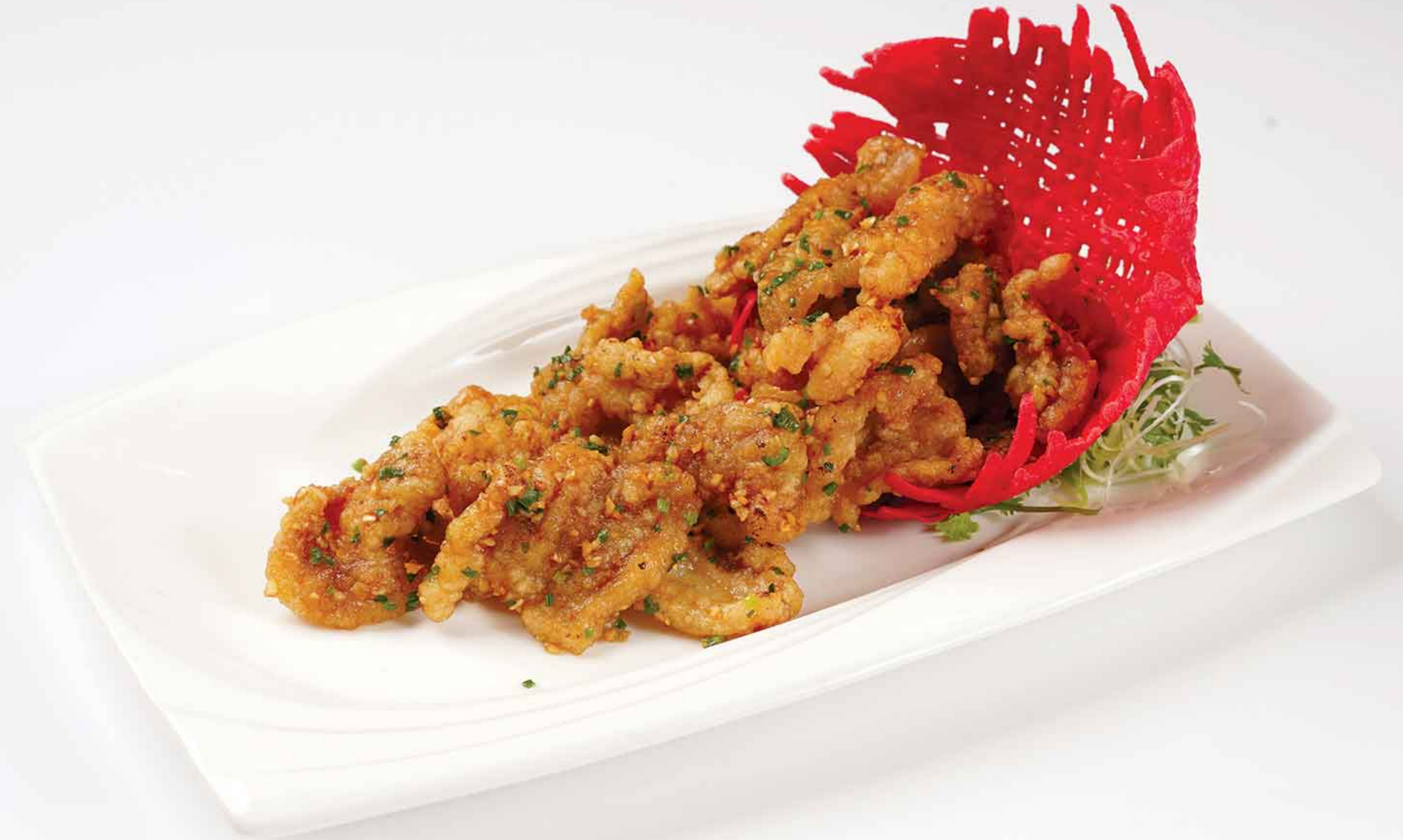
Wok-Fried Pork Belly Slices with Whole Garlic