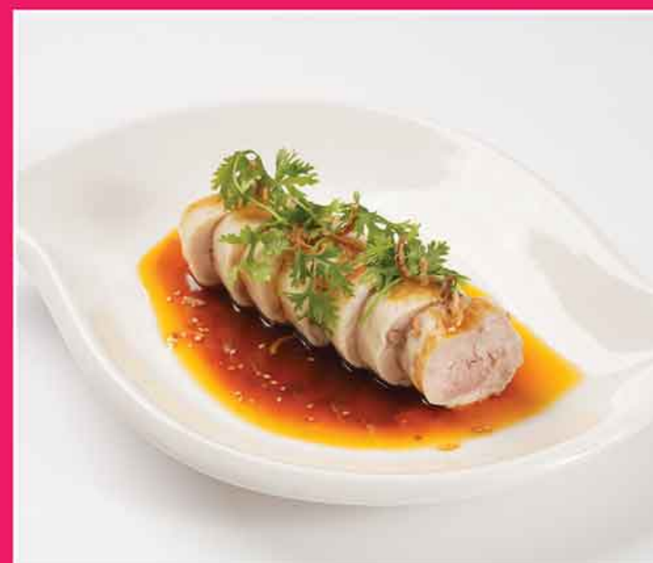
口水麻辣干葱鸡 🍗 Chilled Szechuan Chicken with Fried Onion MMK 25,000