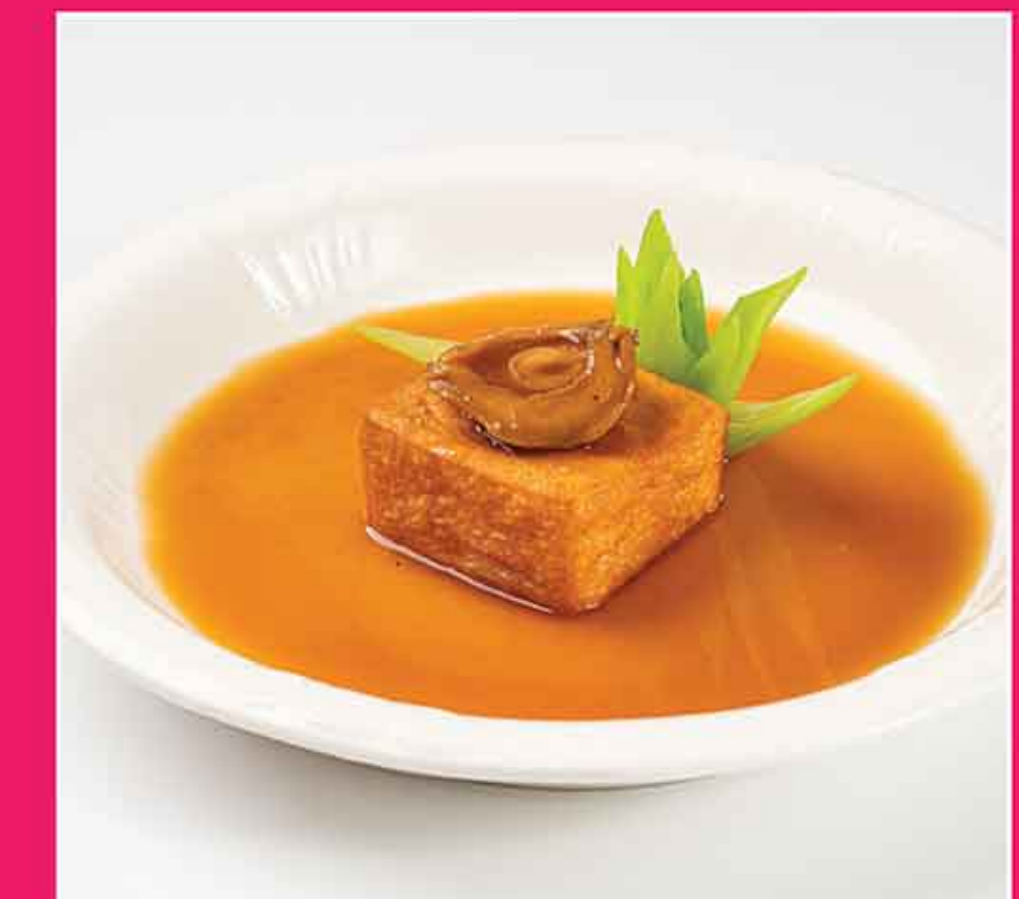
十頭鮑魚伴有機豆腐 🍴 Braised Ten-Head Whole Abalone with Homemade Bean Curd MMK 45,000 (Per Portion)