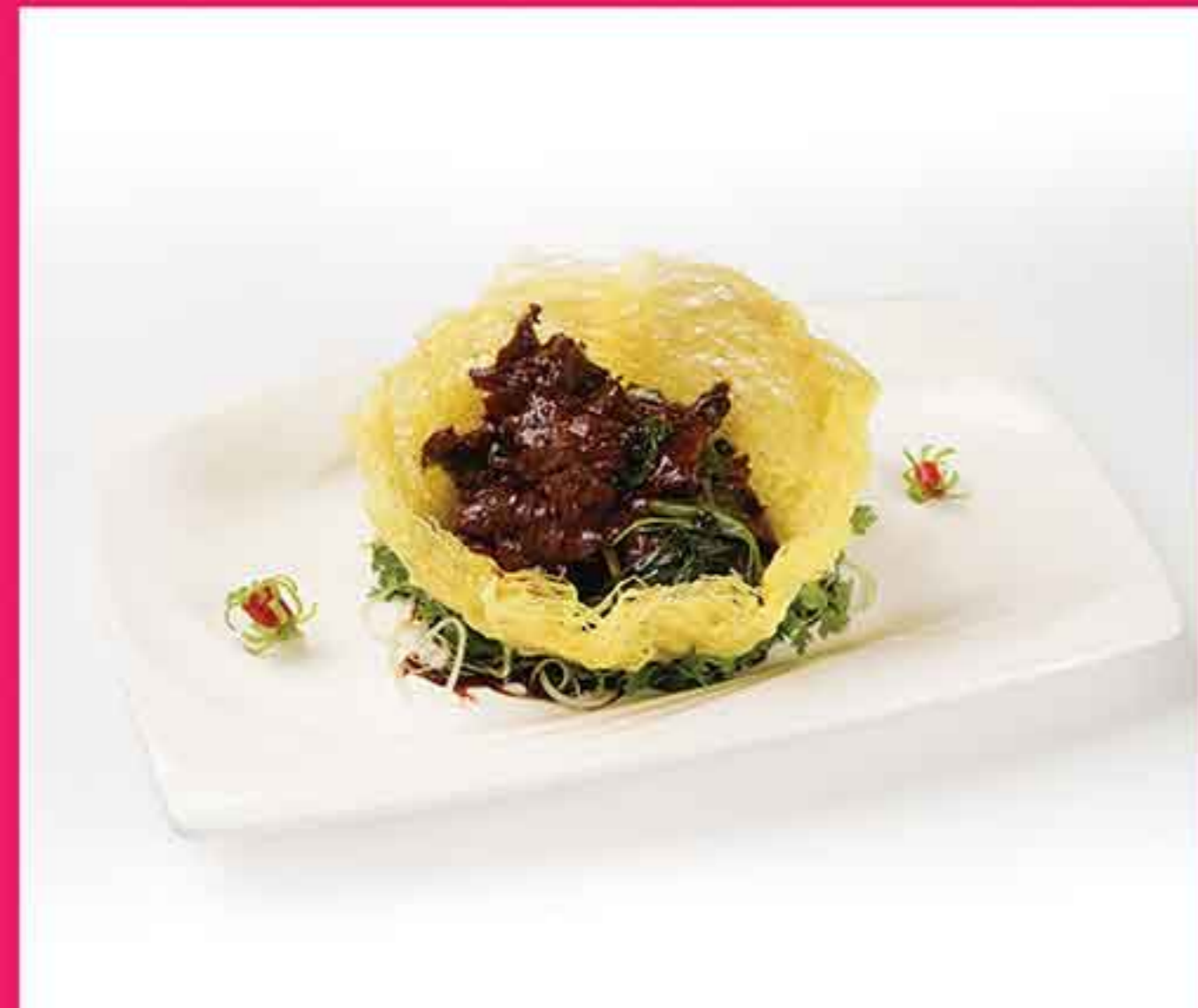
姜葱爆炒牛肉片 Wok-Fried Beef Slices with Ginger & Spring Onions MMK 30,000