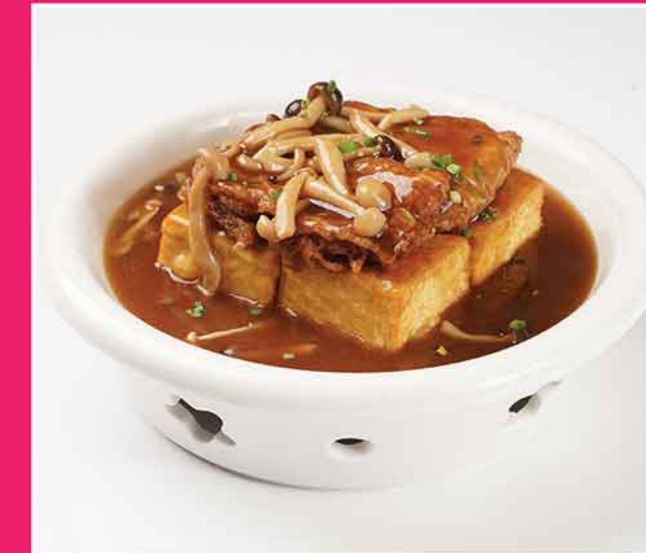
双菇豆根豆腐 🍴 Duo Mushroom Bean Curd Dough with Homemade Tofu MMK 15,000