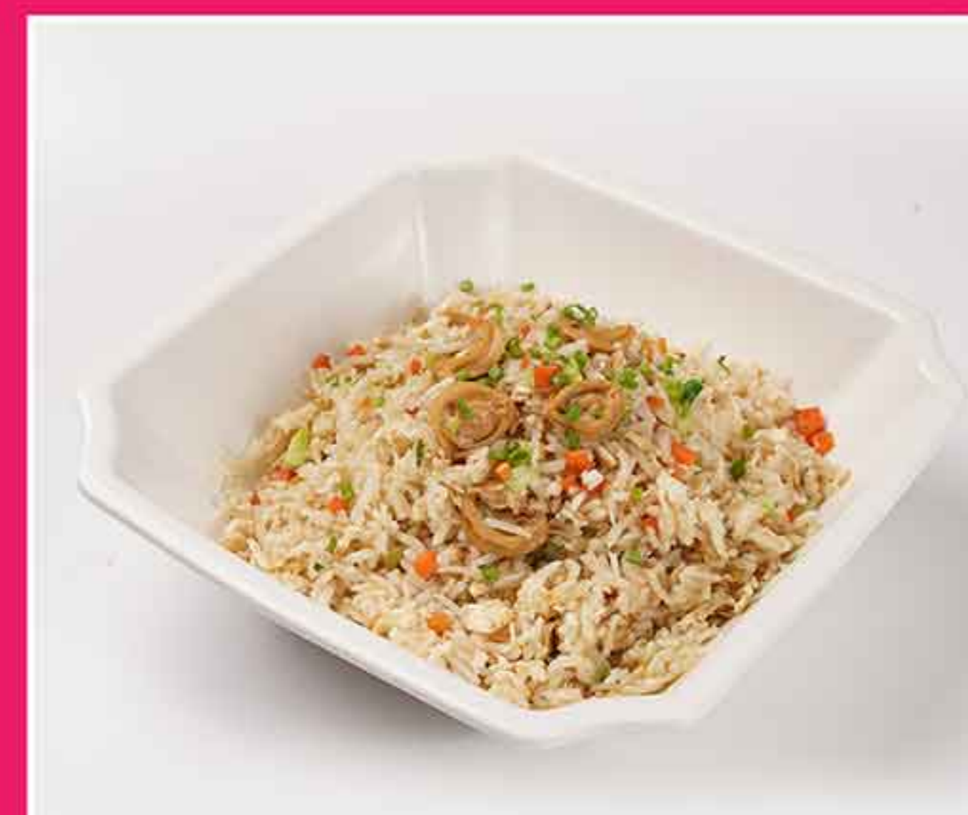
鮑魚仔蟹肉炒飯 🍴🌶️ Crab Meat Rice with Baby Abalone MMK 45,000