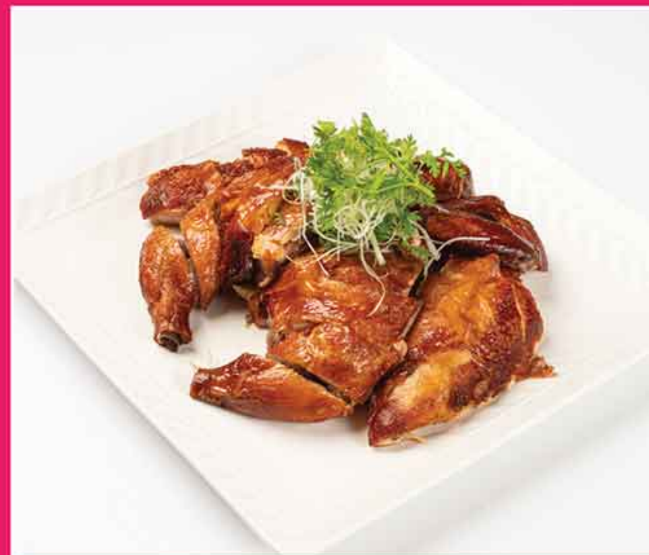
金牌蒜蓉吊烧鸡 Fire Roasted Chicken MMK 40,000 / 80,000 Half / Whole