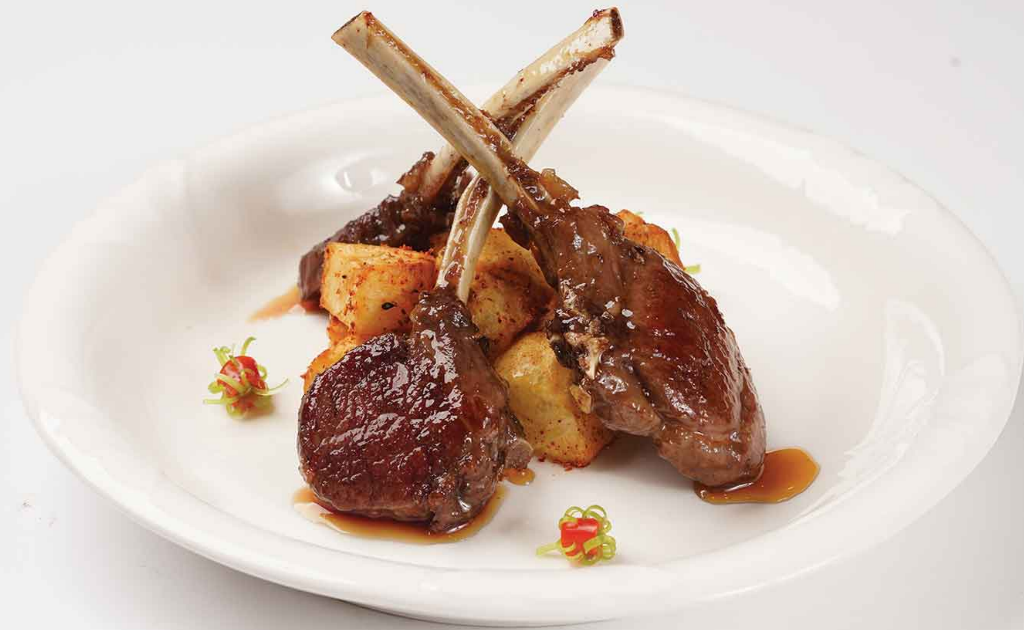
Pan-Grilled Marinated Lamb Chops with Lemon Grass