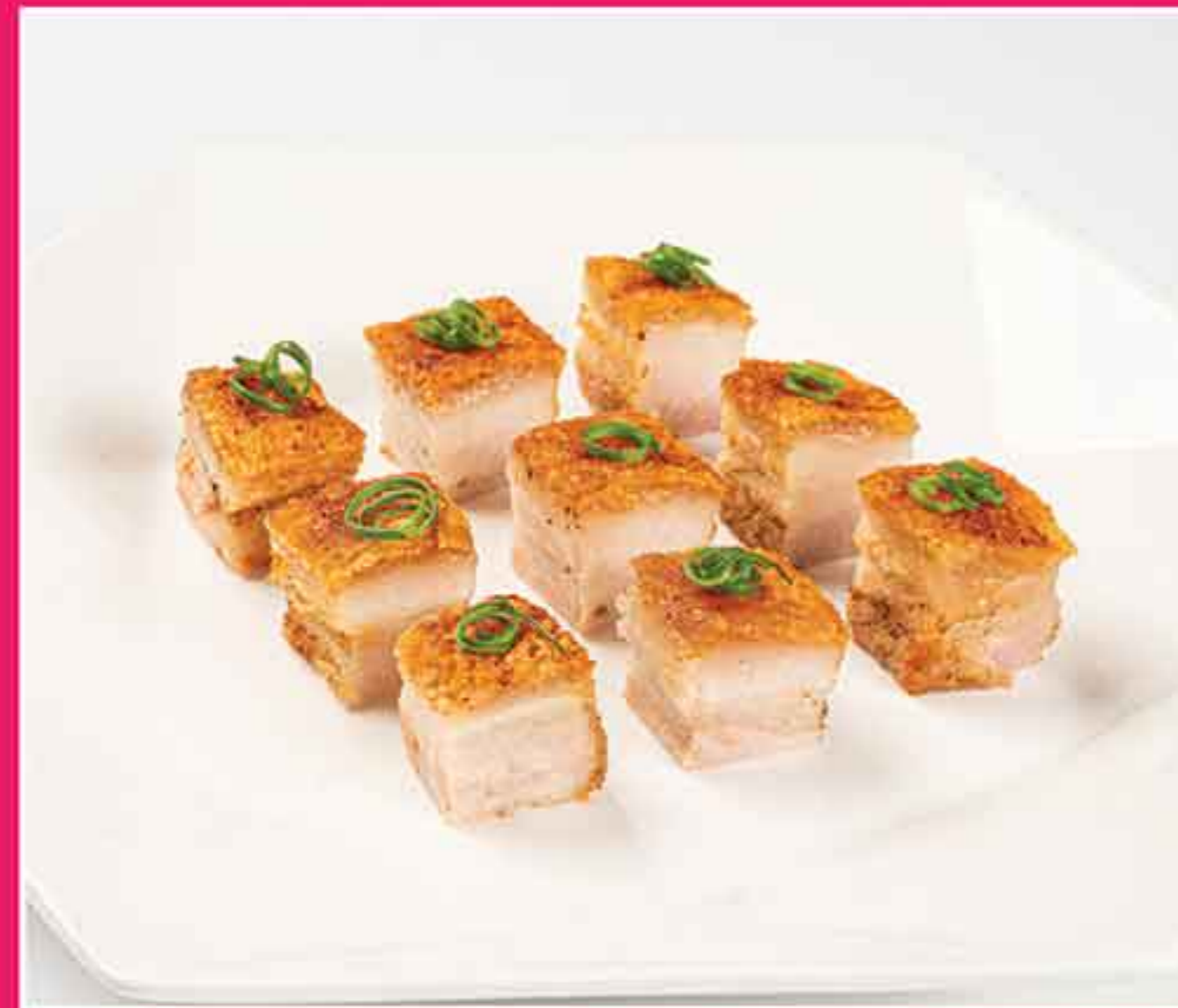
脆皮烧肉 🍴 Traditional Rock Salt Roasted Pork Belly MMK 35,000