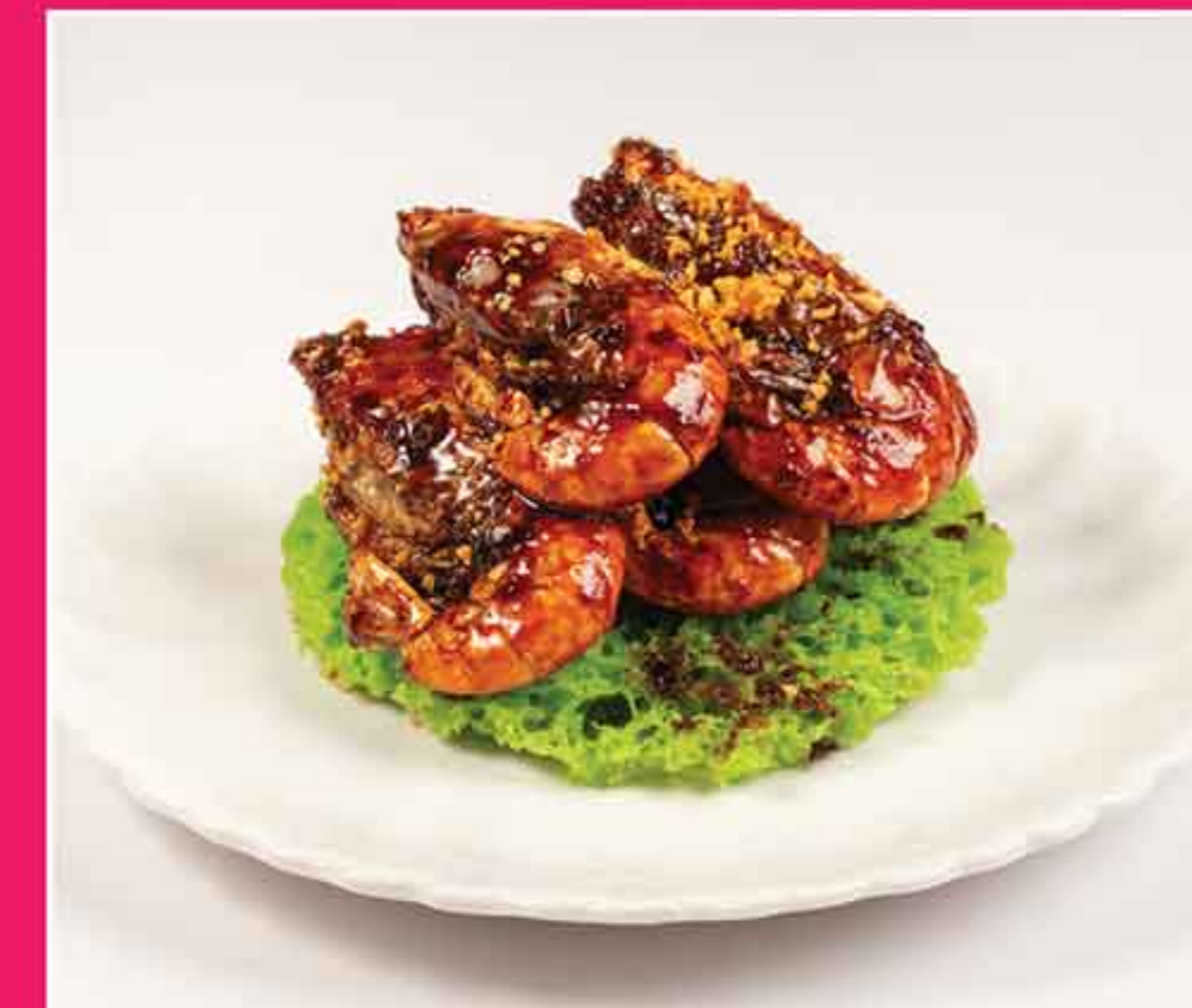
蒜香生抽皇 Fried River Prawns with Garlic and King Soya