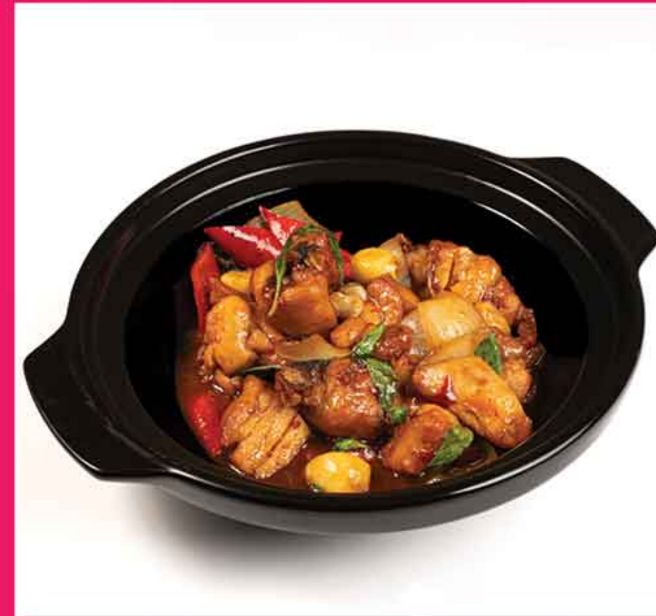
宝岛金兰三杯鸡 🍴 Taiwanese Style Chicken with Basil MMK 15,000