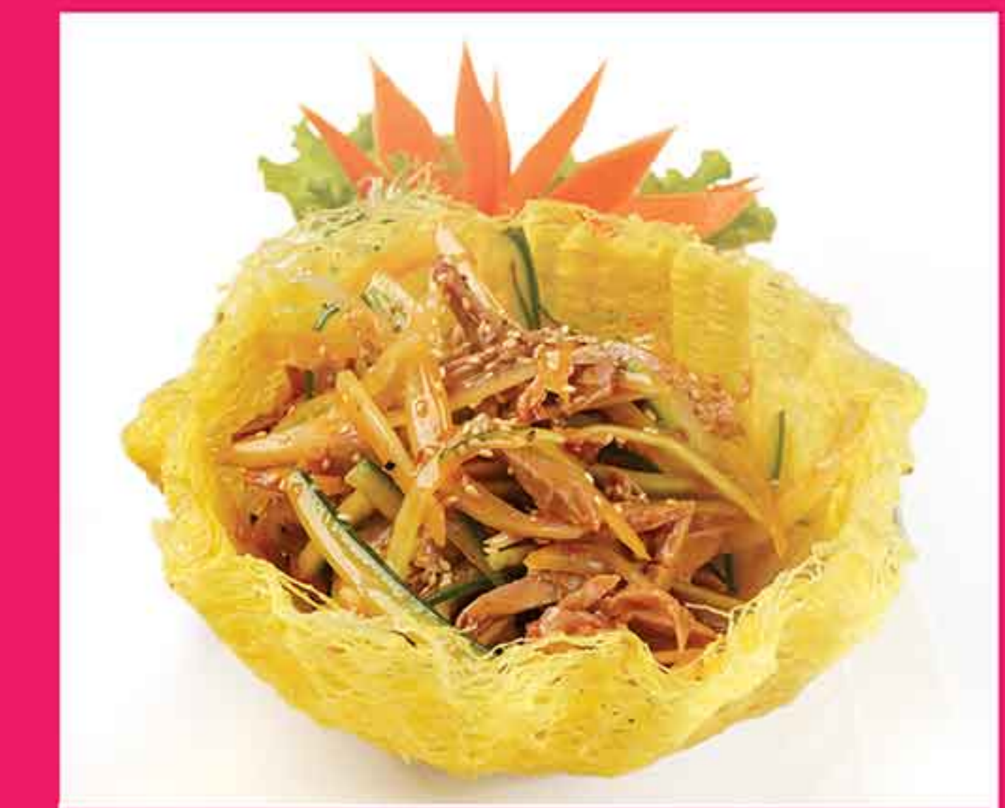
担担鸭丝凉菜 🌶️ Chilled Duck Slice with Spicy Peanut Sauce