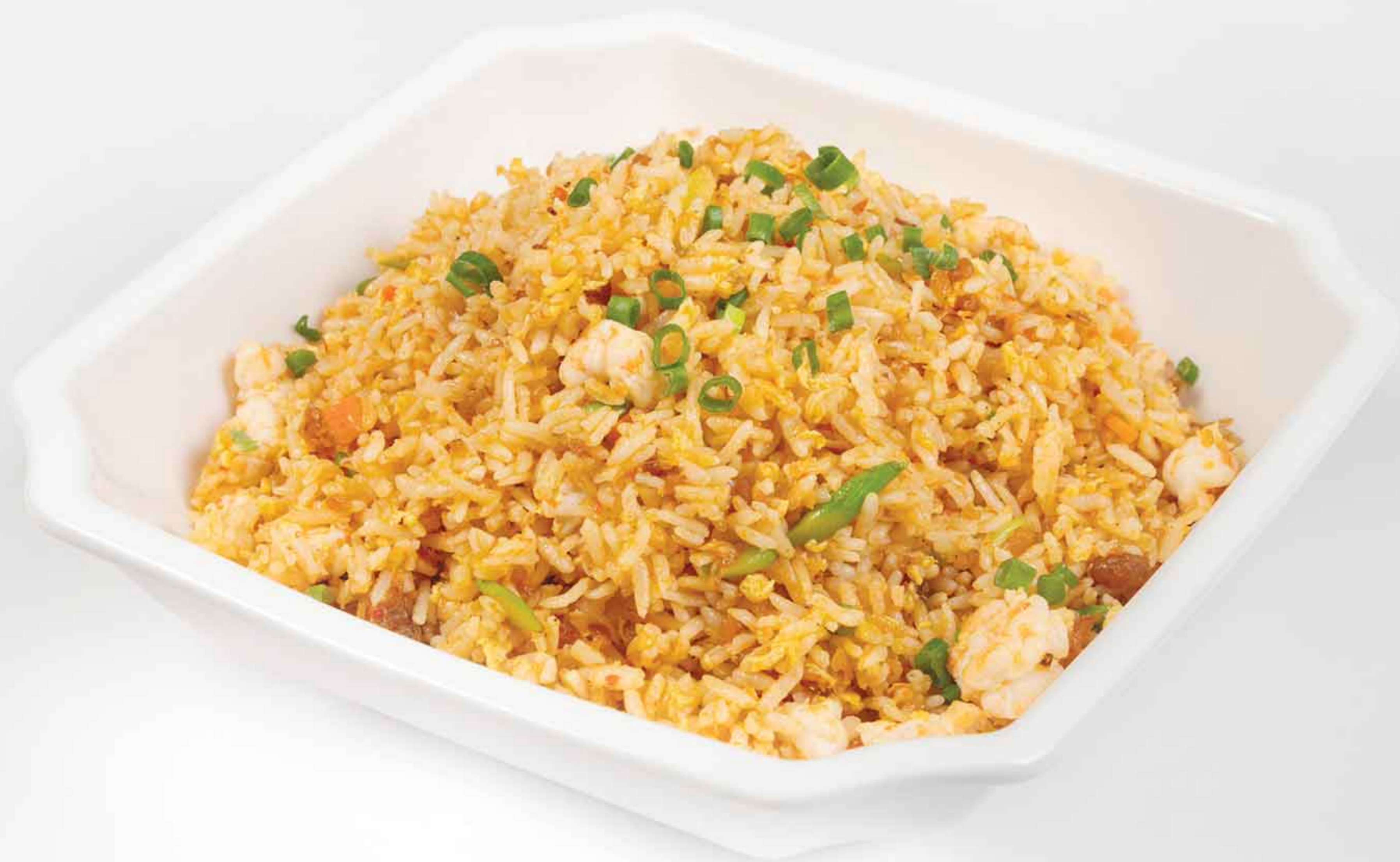
XO Sauce Fried Rice with Dried Scallops