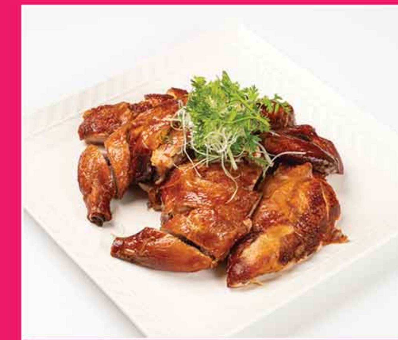
蒜蓉吊烧鸡 Roasted Crispy Chicken

烧味拼依据个人喜好从以下选择三种 Combinations For Your Preference, Please Choose Three Types From Below