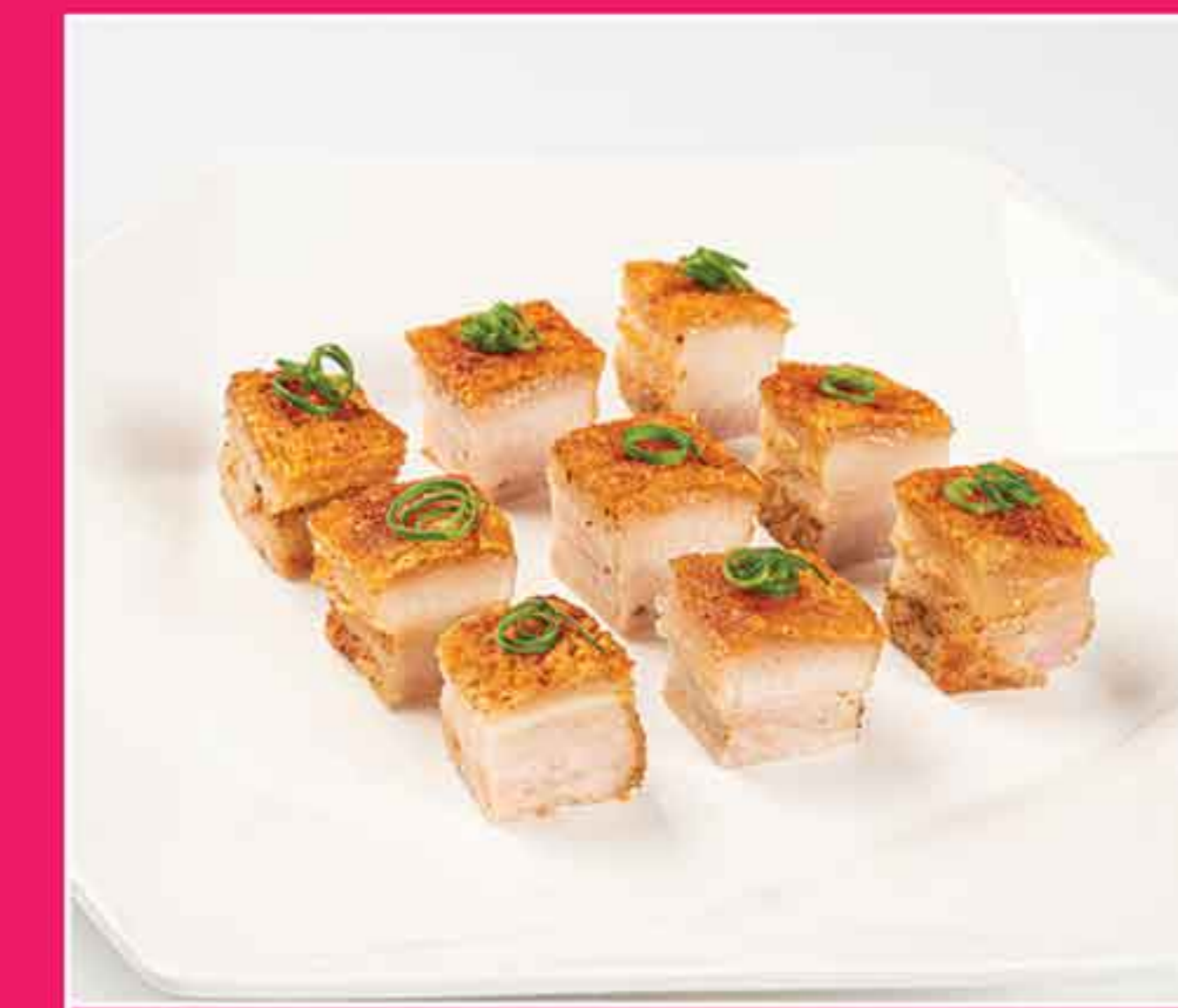
脆皮烧肉 Traditional Rock Salt Roasted Pork Belly