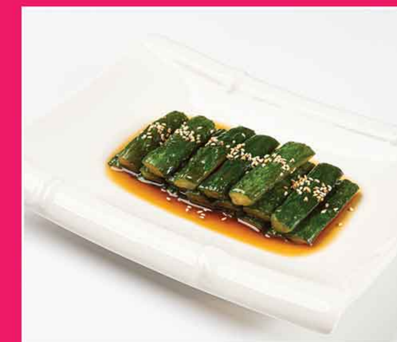
凉拌黄瓜 Cold Japanese Cucumber with Garlic MMK 15,000