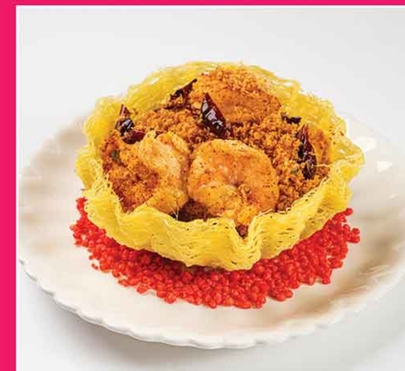
避風塘炒蝦球 🌶️ Cantonese Style Sautéed Tiger Prawns with Golden Garlic and Sun-Dried Chili MMK 45,000