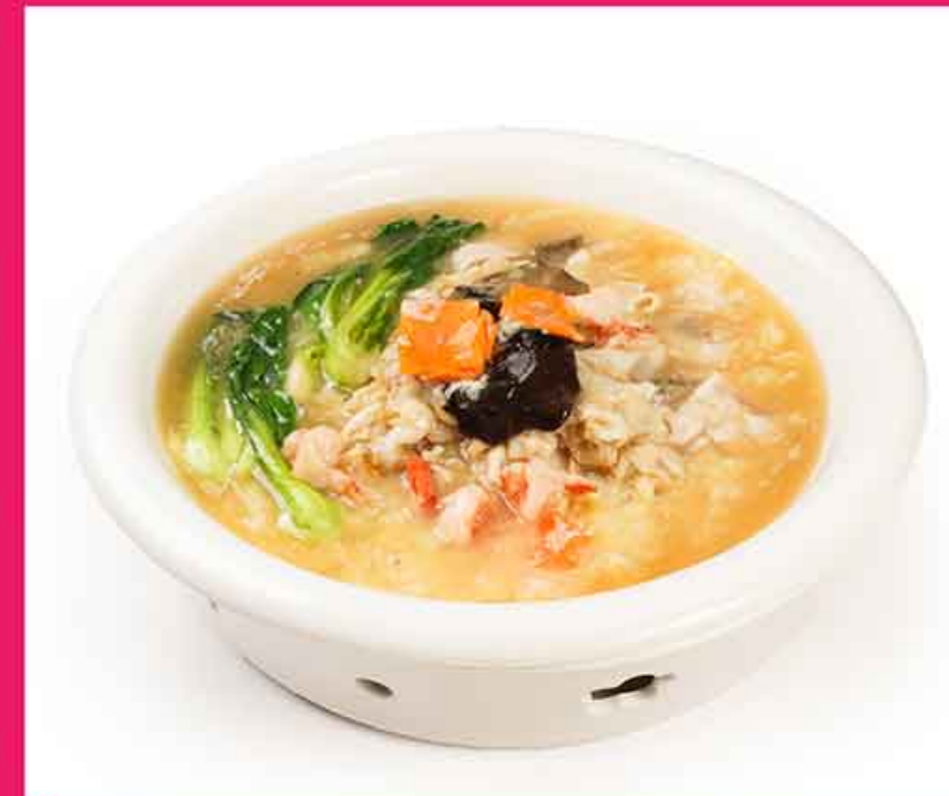
蟹皇海鮮滑蛋河 🍴 Seafood Fried Rice Noodles with Crab Roe and Egg Gravy MMK 15,000 (Single Portion) / 25,000