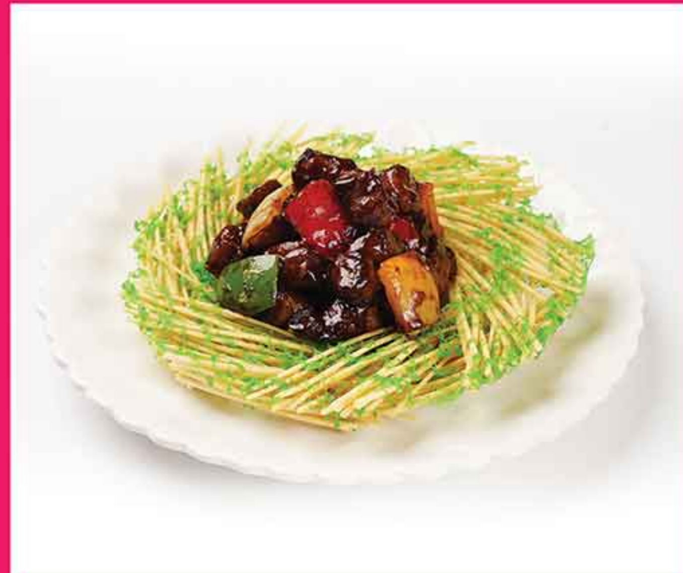
黑椒爆炒神户牛粒 🍴🌶️ Wok-Fried Japanese A5 Wagyu Beef with Black Pepper Sauce MMK 450,000