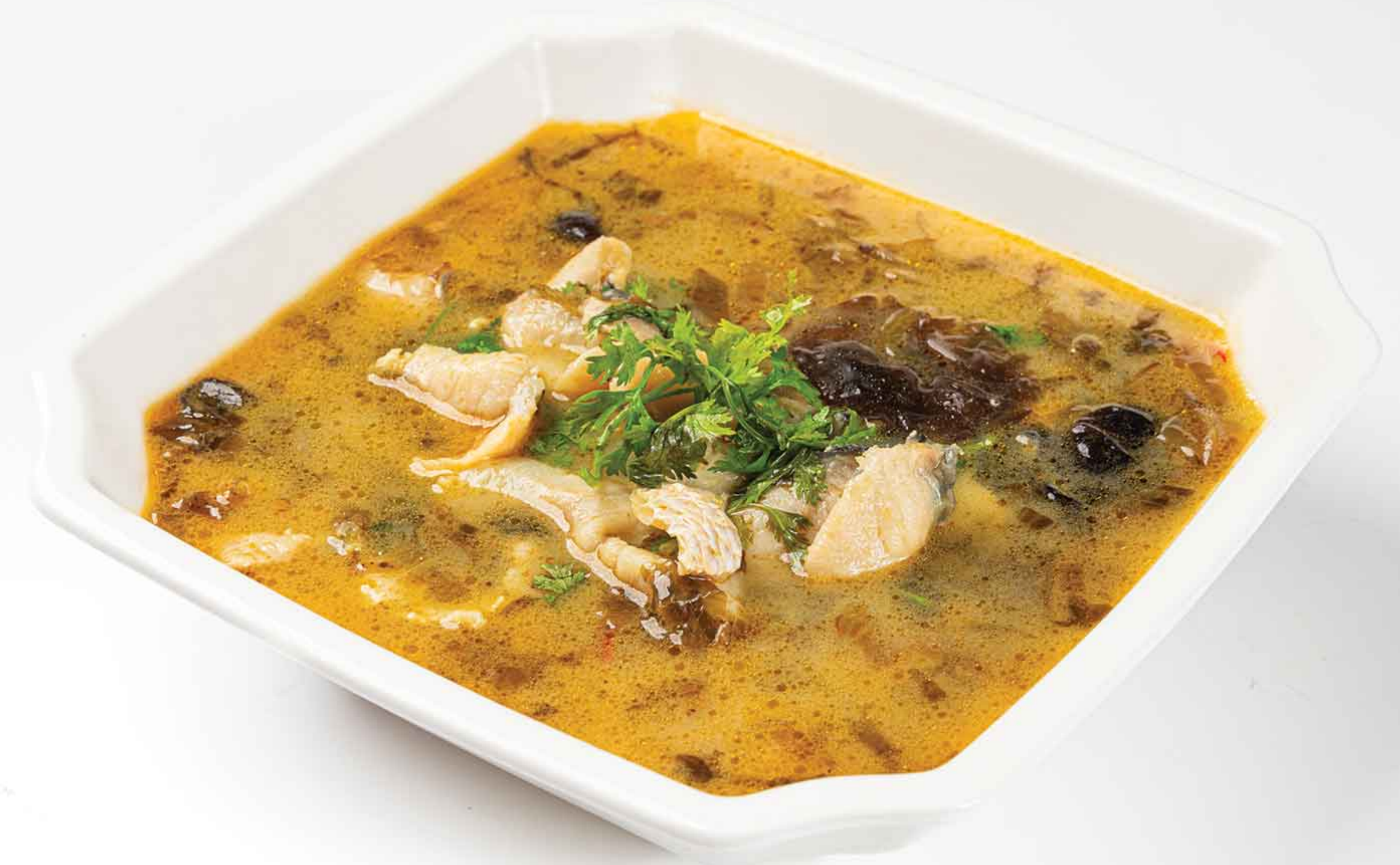
Braised Fish Fillet with Preserved Vegetables in Szechuan Style