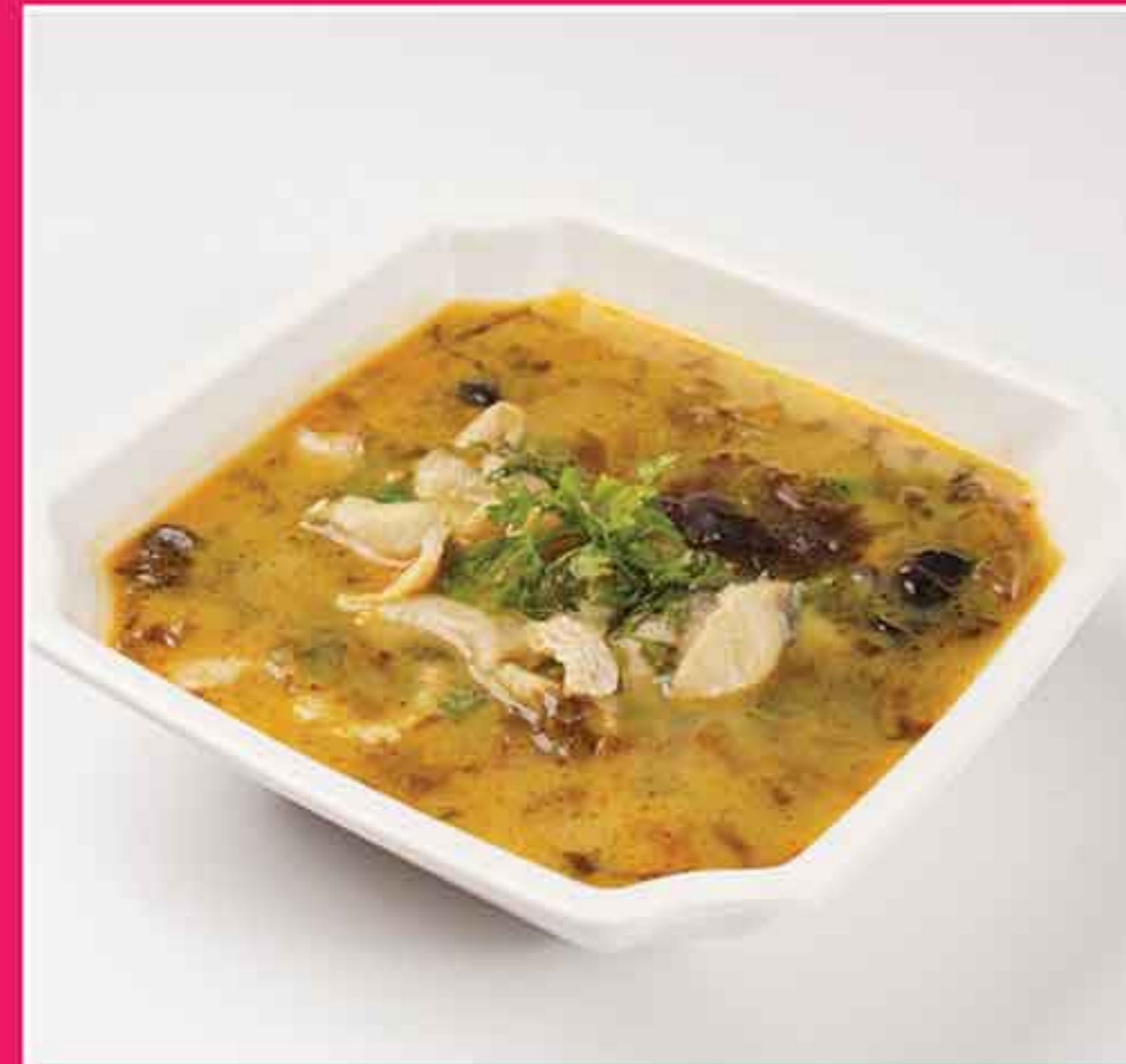
生滚酸菜鱼片 🍴🌶️ Braised Fish Fillet with Preserved Vegetables in Szechuan Style MMK 30,000