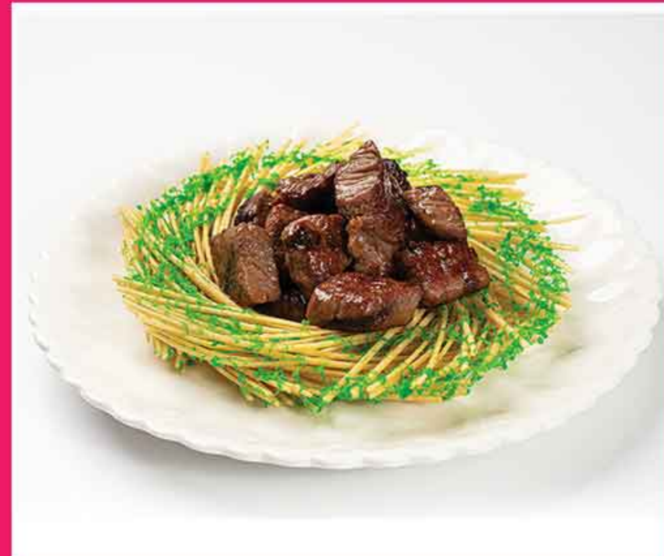
香煎澳洲牛肉粒 🍴 Australlian Grilled Beef MMK 90,000