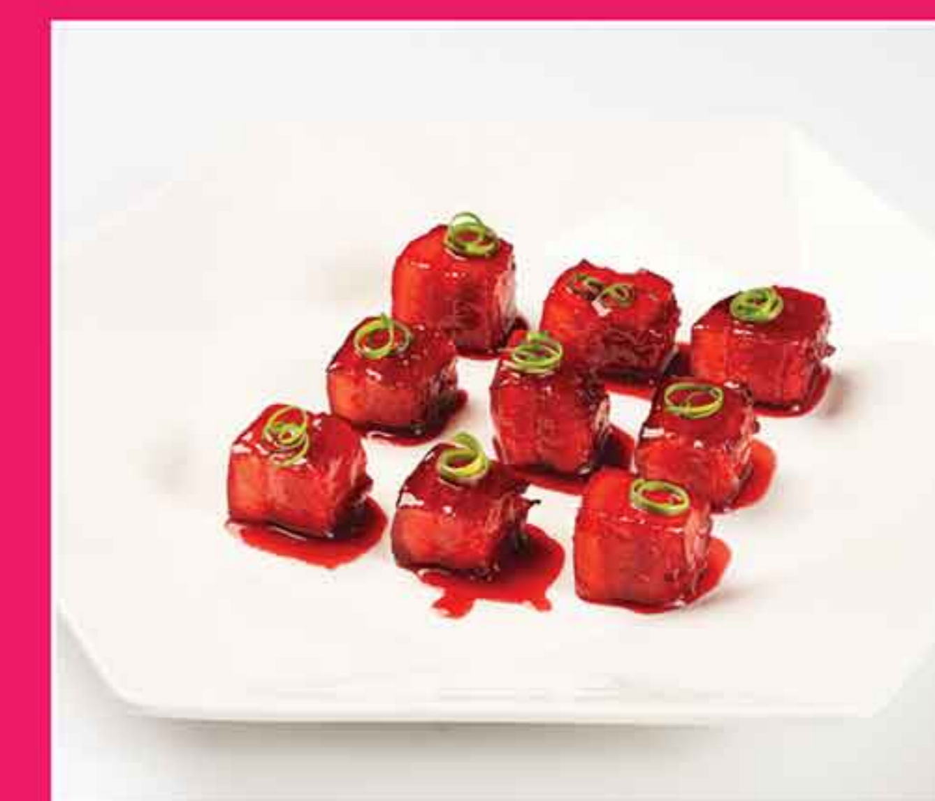
蜜汁叉烧 Honey Glazed Barbecued Pork