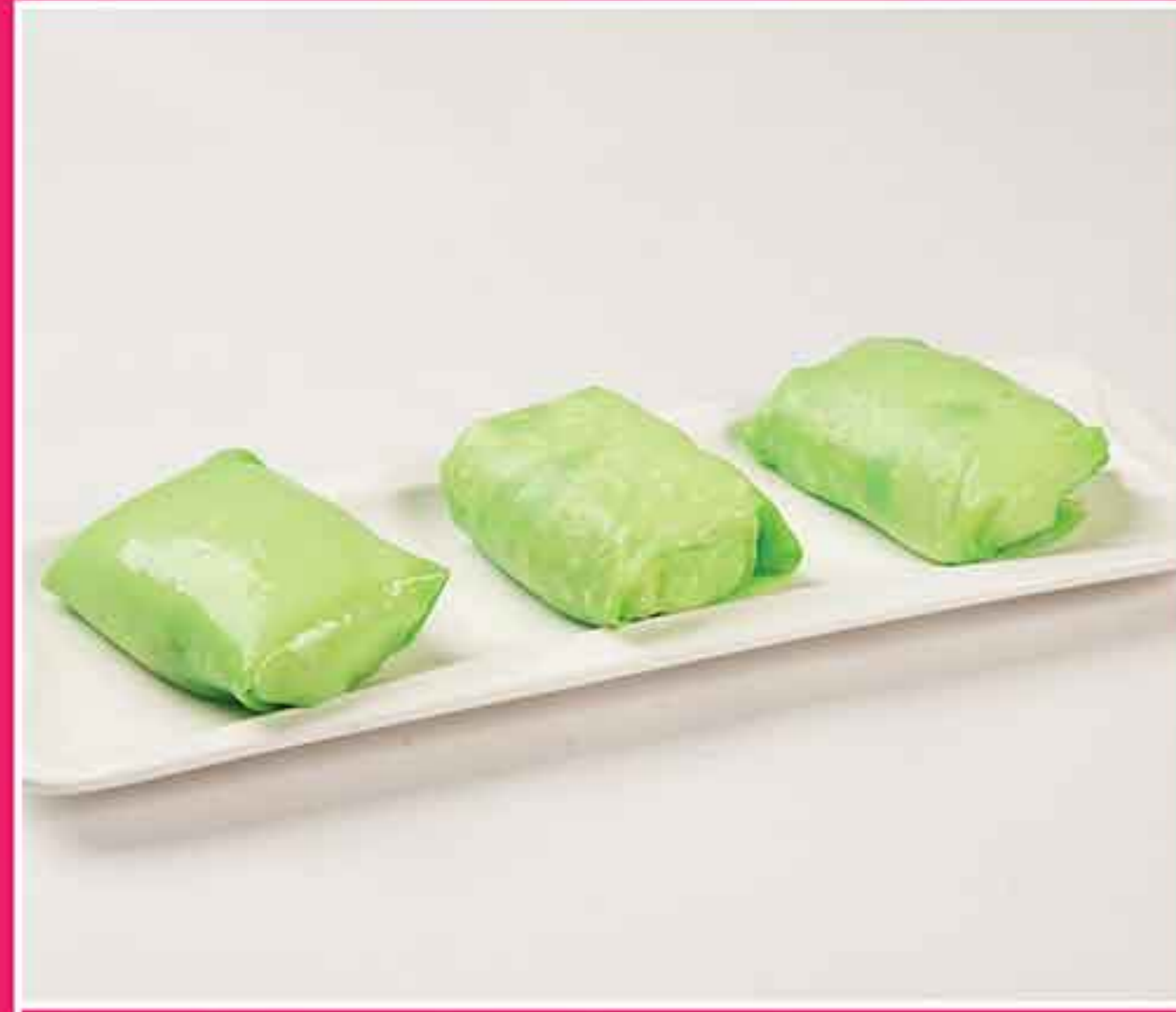
風味芒果班戟 Mango Pancake, Fresh Mango with Whipped Cream MMK 18,000