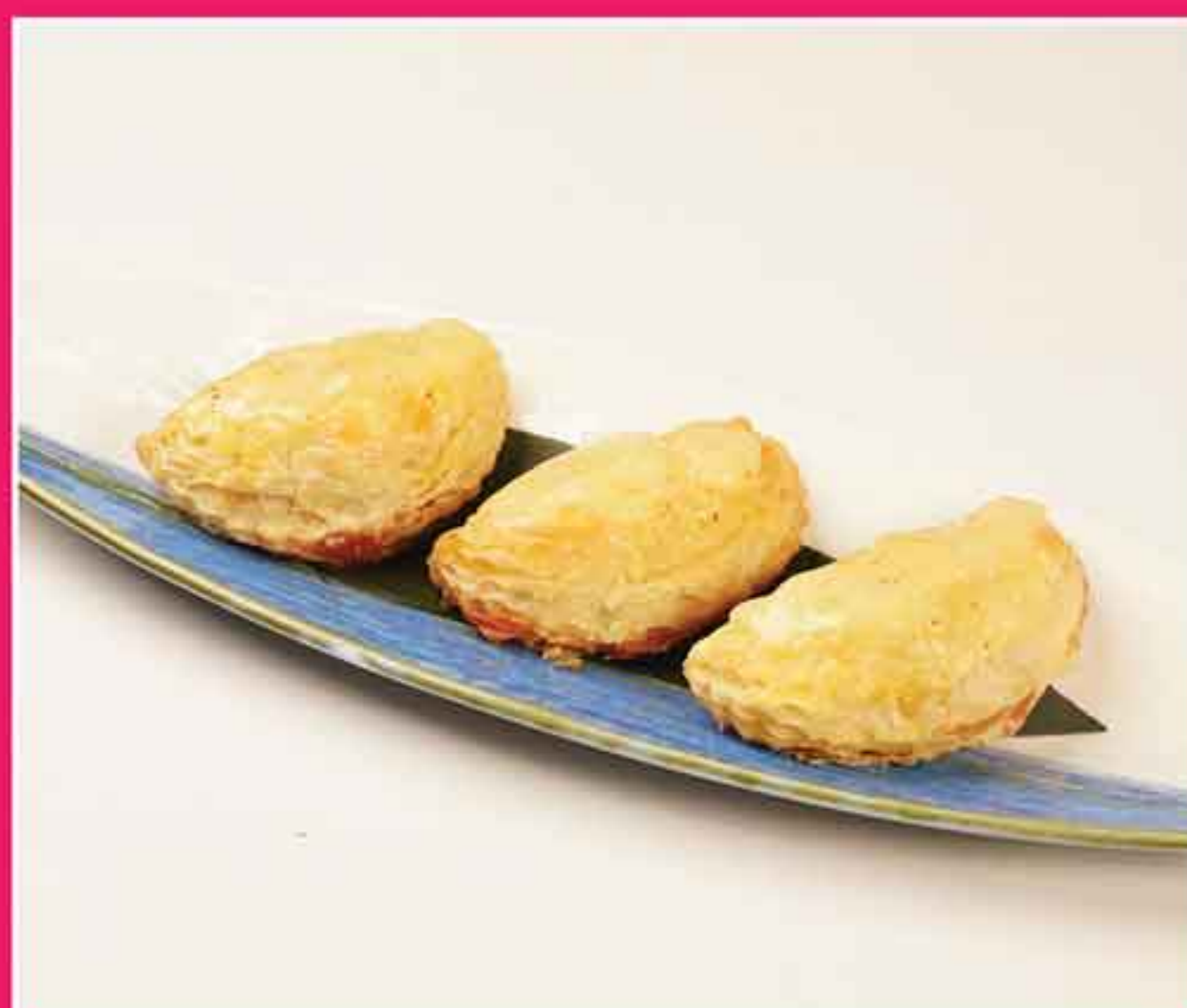
芝士烤雞叉燒酥 Oven-Baked Chicken Char Siew Puff with Cheese MMK 14,700