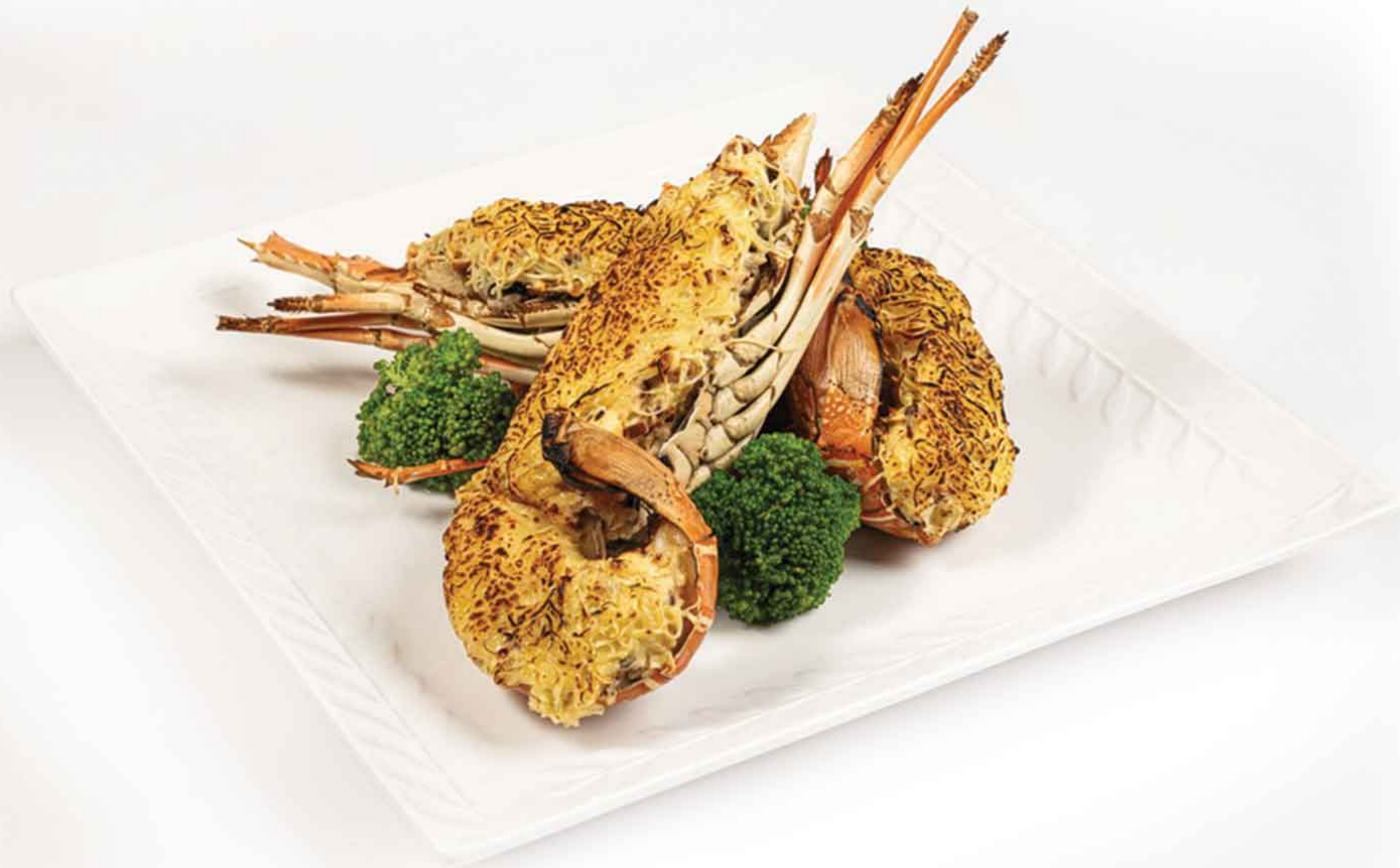
Baked Green Lobster with Mozzarella and Cheddar Cheese