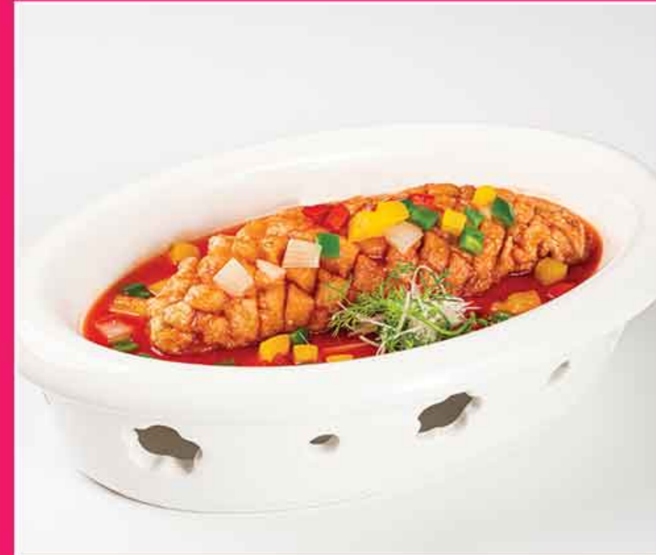
糖醋炸 Deep-Fried Seabass with Sweet and Sour Sauce