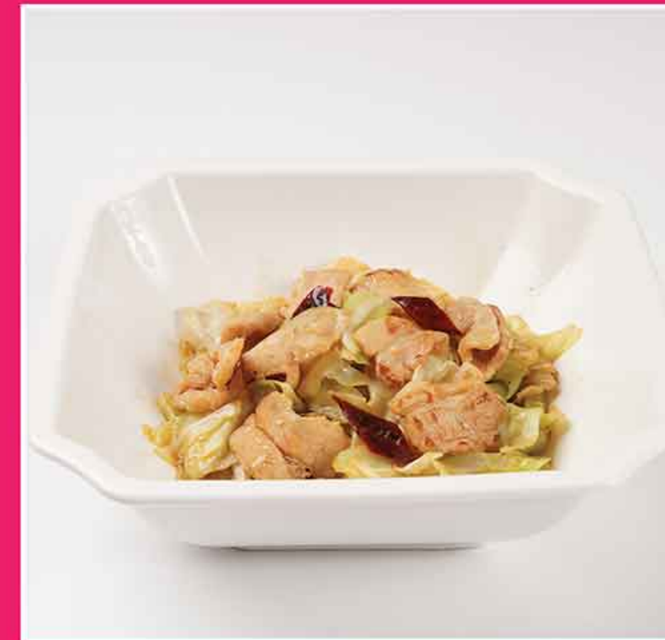
生炒手撕包菜 Wok-Fried Shredded Cabbage with Dried Chili MMK 15,000