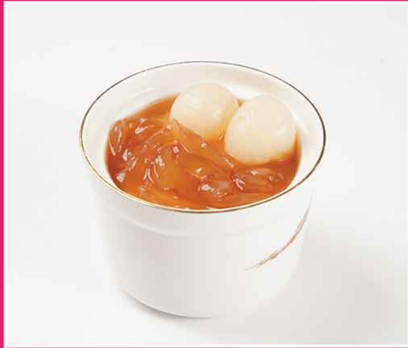
果冻龙眼海底椰 Chilled Sea Coconut with Longan MMK 15,000