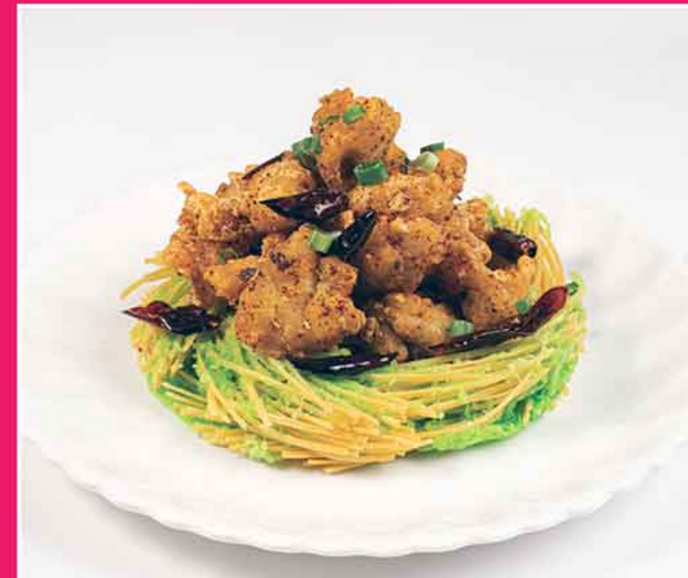
川椒炒辣子鸡 🌶️ Szechuan Red Chili Chicken MMK 10,000/ 20,000 (Single Portion)