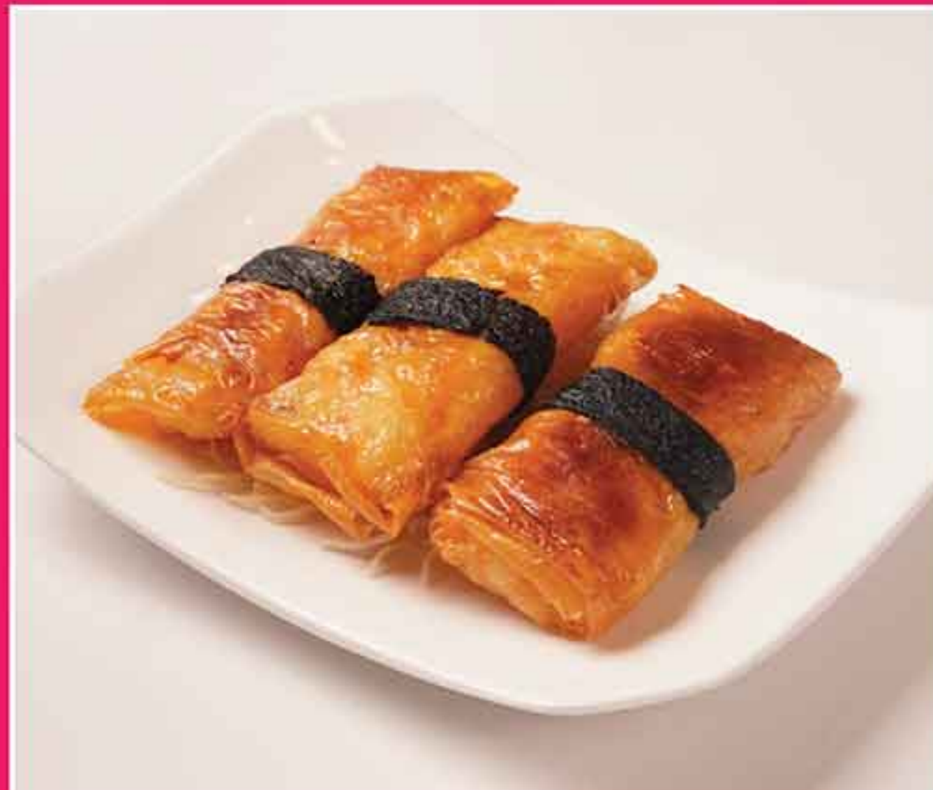
鮮蝦鹹蛋腐皮卷 Deep-Fried Shrimp with Salted Egg Yolk Curd Rolls MMK 14,700

香脆煎炸焗點心 | GOLDEN FRIED & OVEN-BAKED DIM SUM