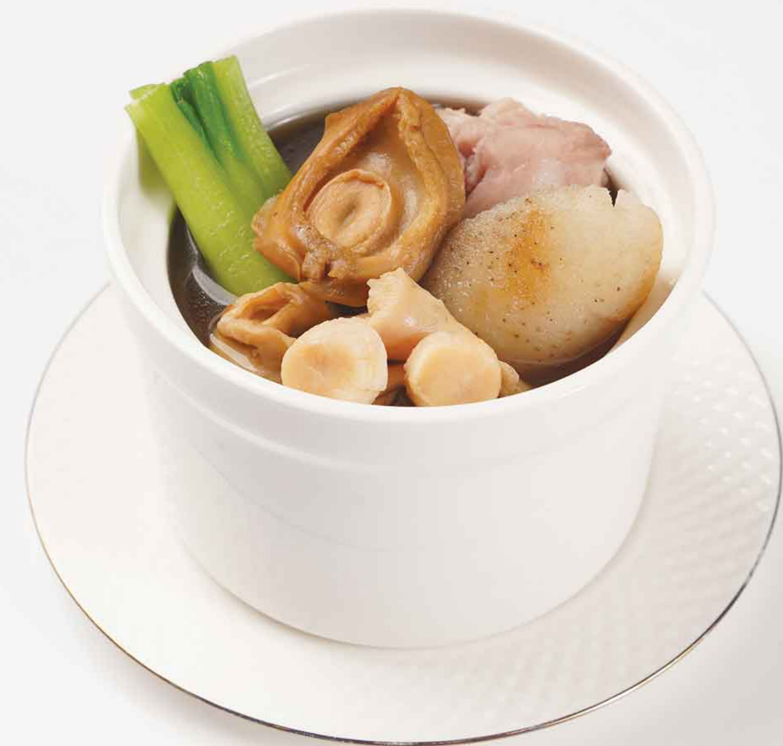
Mini Treasure from the Sea (Pre Order)