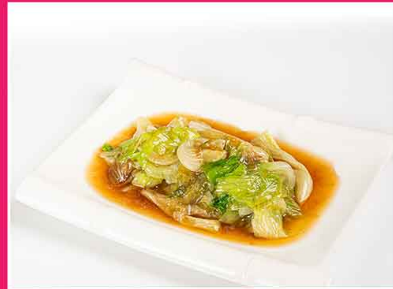
蚝油 Iceberg Lettuce with Oyster Sauce