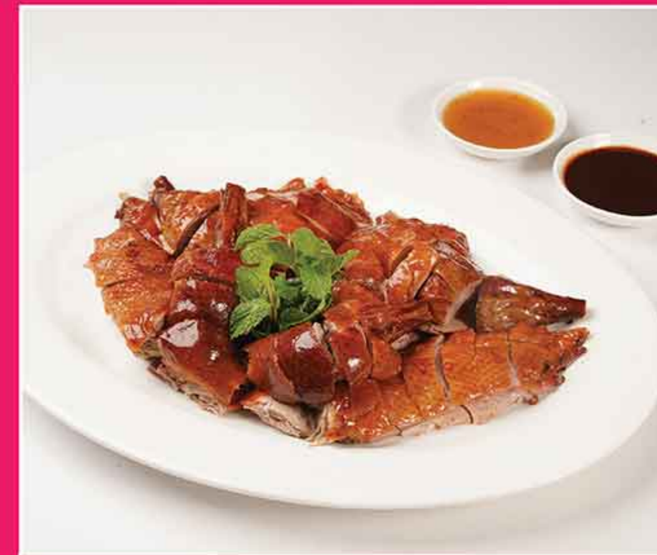
港式烧鸭 | 半只/整只 🍴 Cantonese Style Fire Roasted Duck MMK 75,000 / 150,000 Half / Whole