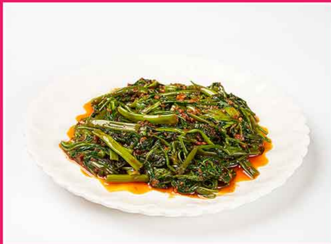
蒜辣 🌶️ Water Spinach with Garlic Chilli