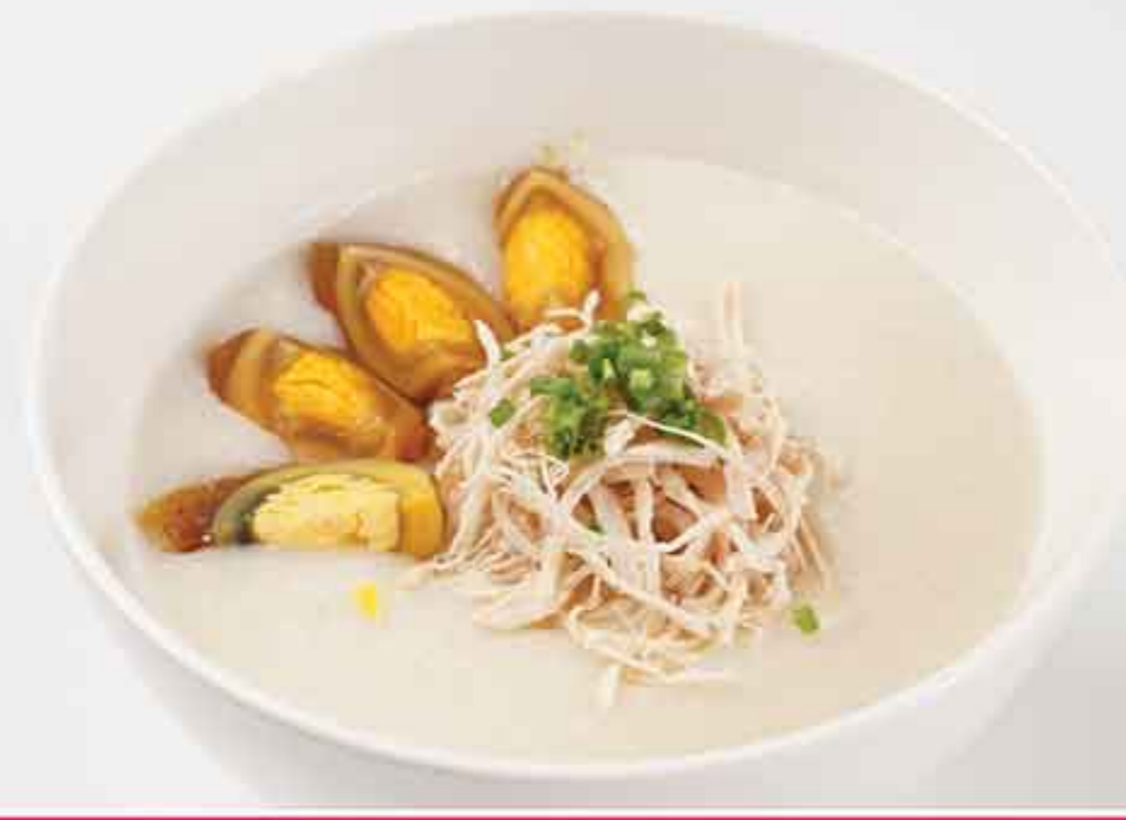
皮蛋雞絲粥 Congee with Shredded Chicken and Century Egg MMK 10,500