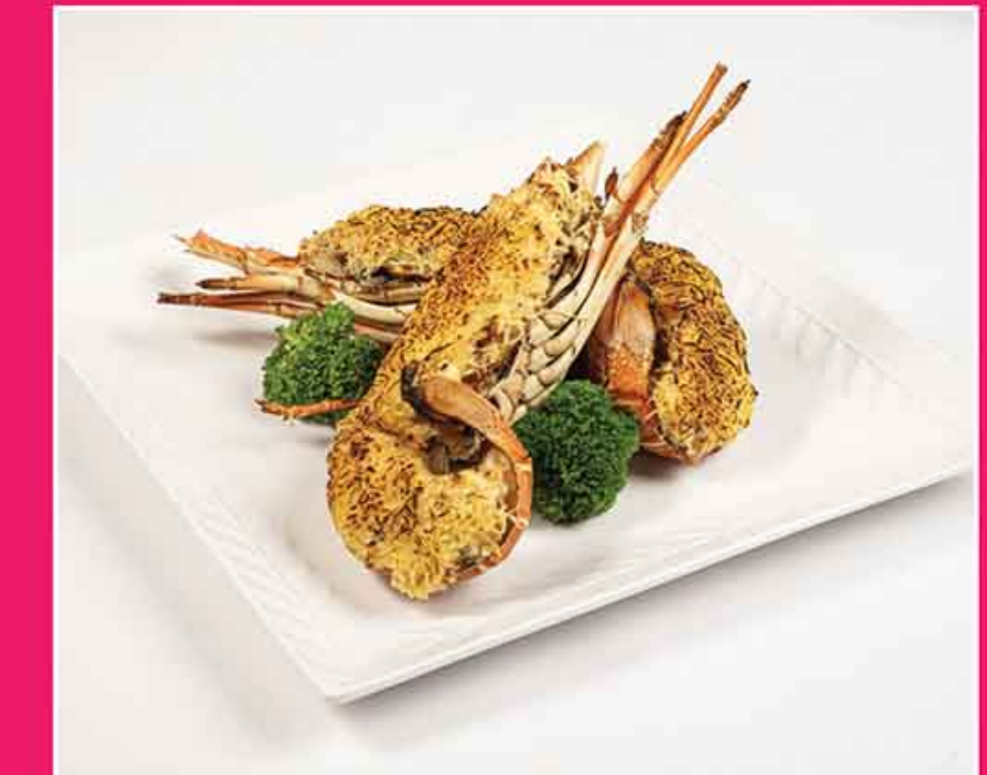
芝士香焗龍胎 🍴 Baked Green Lobster with Mozzarella and Cheddar Cheese MMK 140,000 (Per Portion)