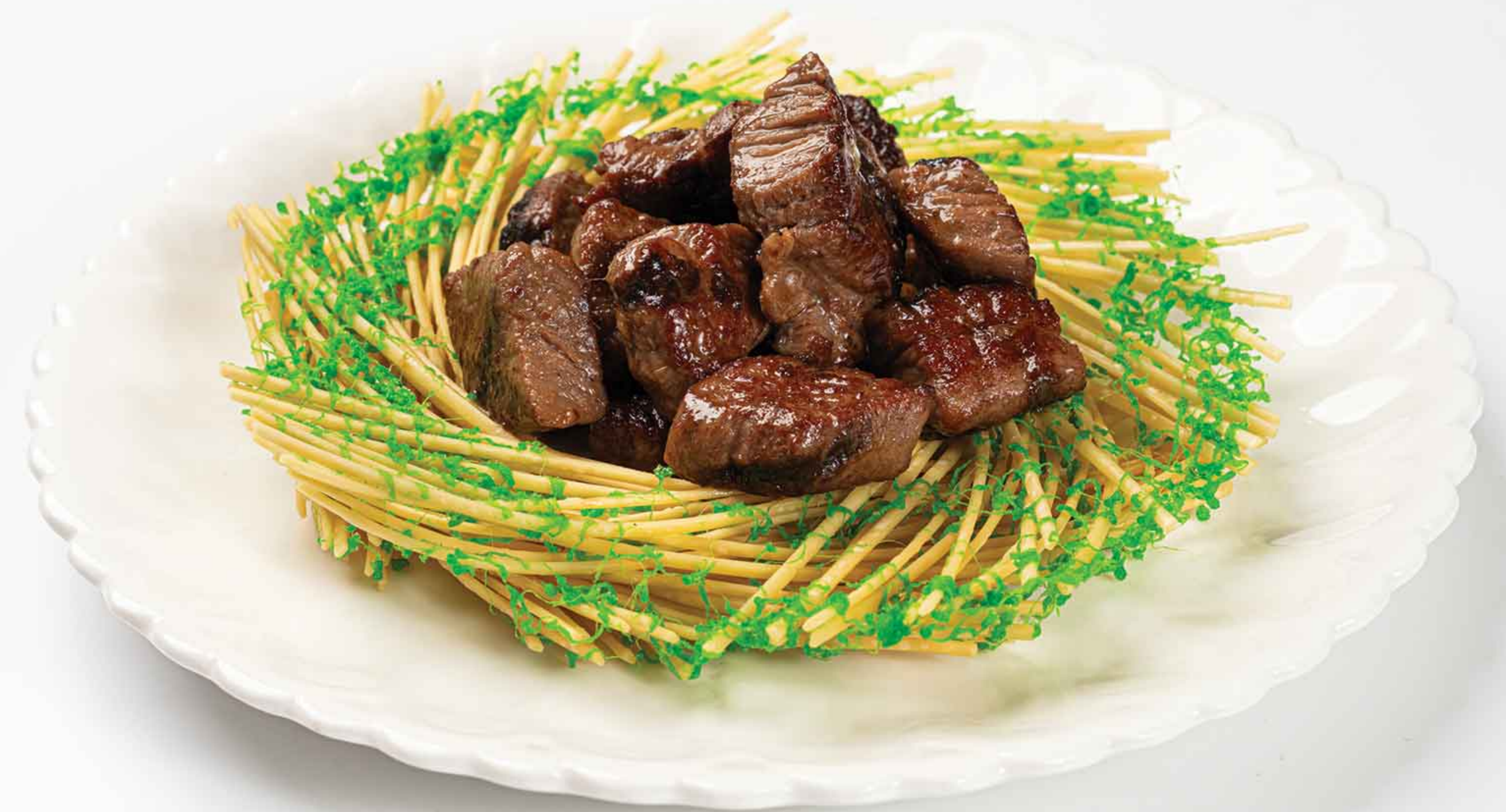
Australlian Grilled Beef