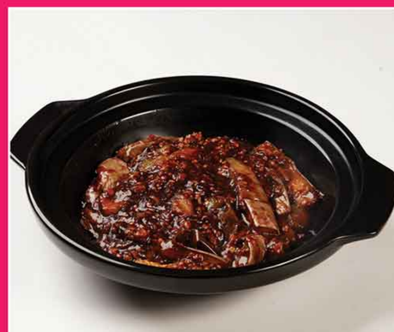
鱼香茄子煲 🌶️ Braised Egg Plant with Minced Pork MMK 15,000