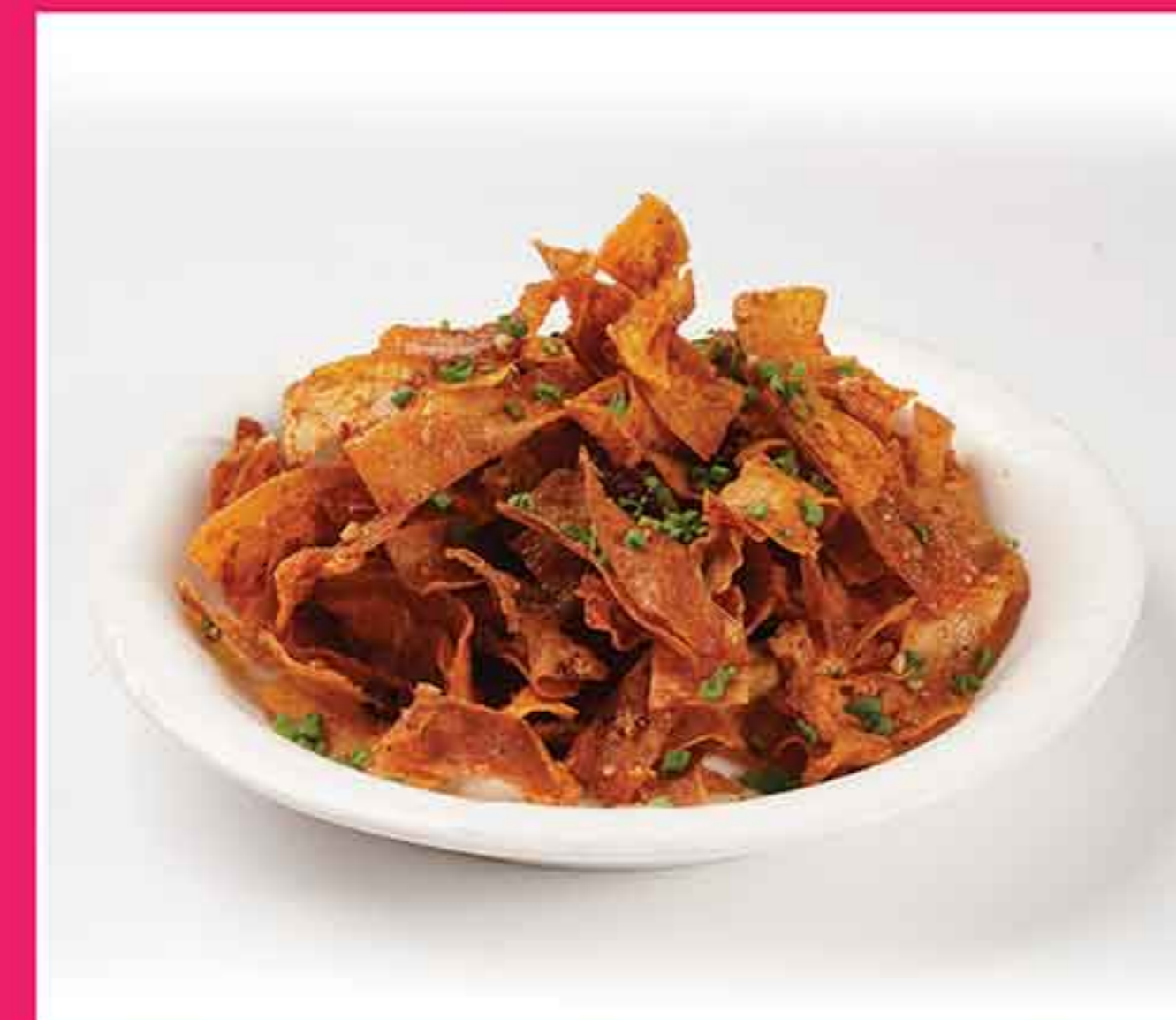
七味椒盐金瓜片雪 🍴🌶️ Wok-Fried Shredded Pumpkin and Dried Chili MMK 15,000