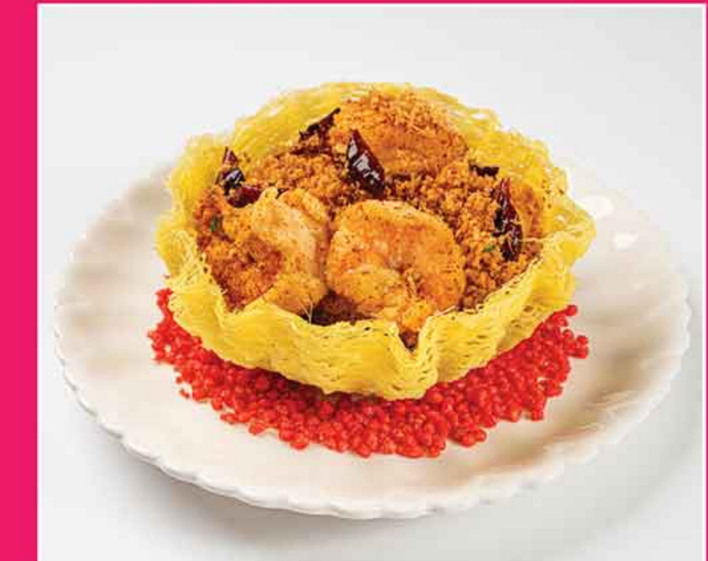
避风塘炒 Fried Tiger Prawns with Golden Garlic and Dried Chili