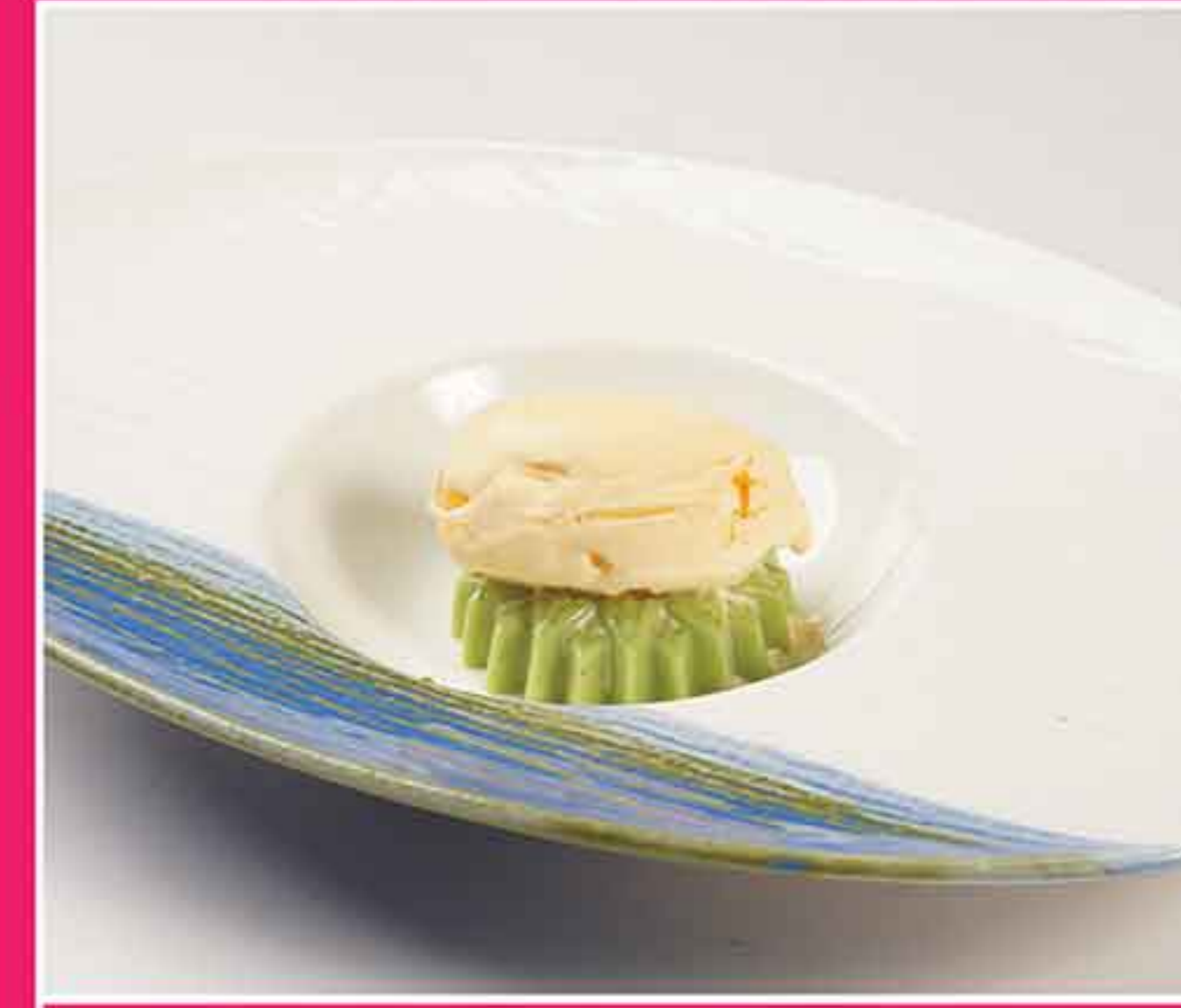
绿茶布丁伴雪糕 Green Tea Pudding with Vanilla Ice Cream MMK 15,000