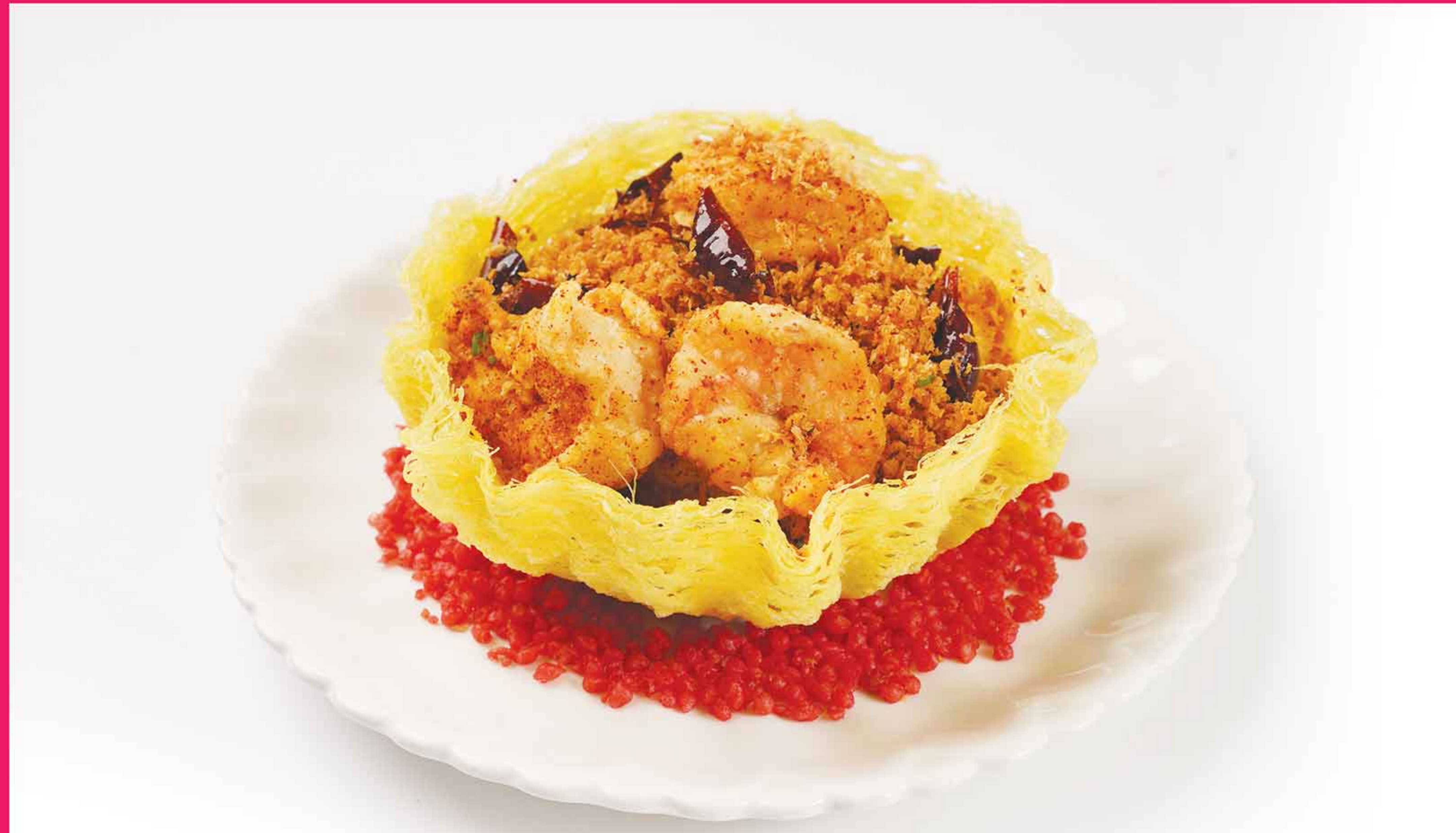
Fried Tiger Prawns with Golden Garlic and Dried Chili