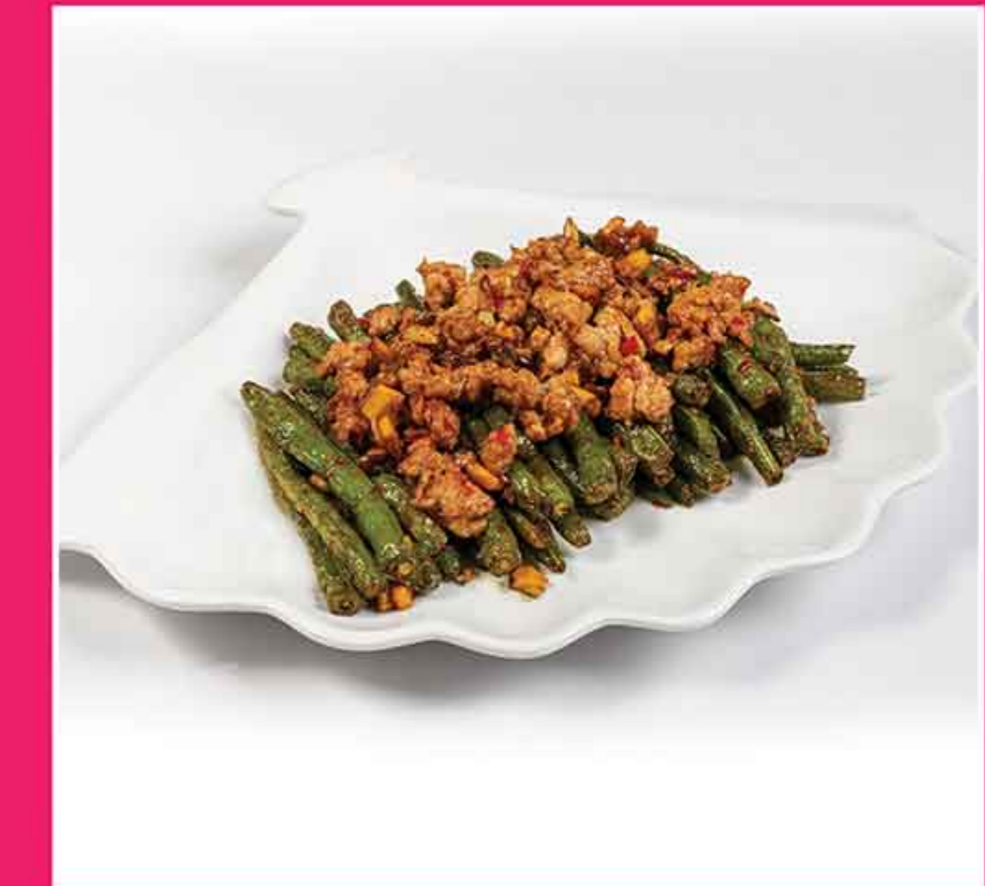
干煸四季豆 🍴🌶️ Szechuan Style Stir-Fried French Beans with Minced Pork MMK 10,000 (Single Portion) / 15,000