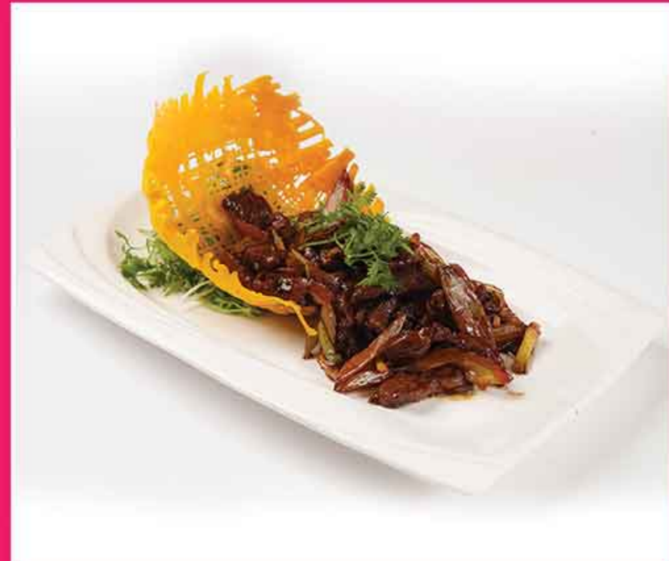
芹菜爆炒牛柳 Wok-Fried Beef with Celery MMK 30,000