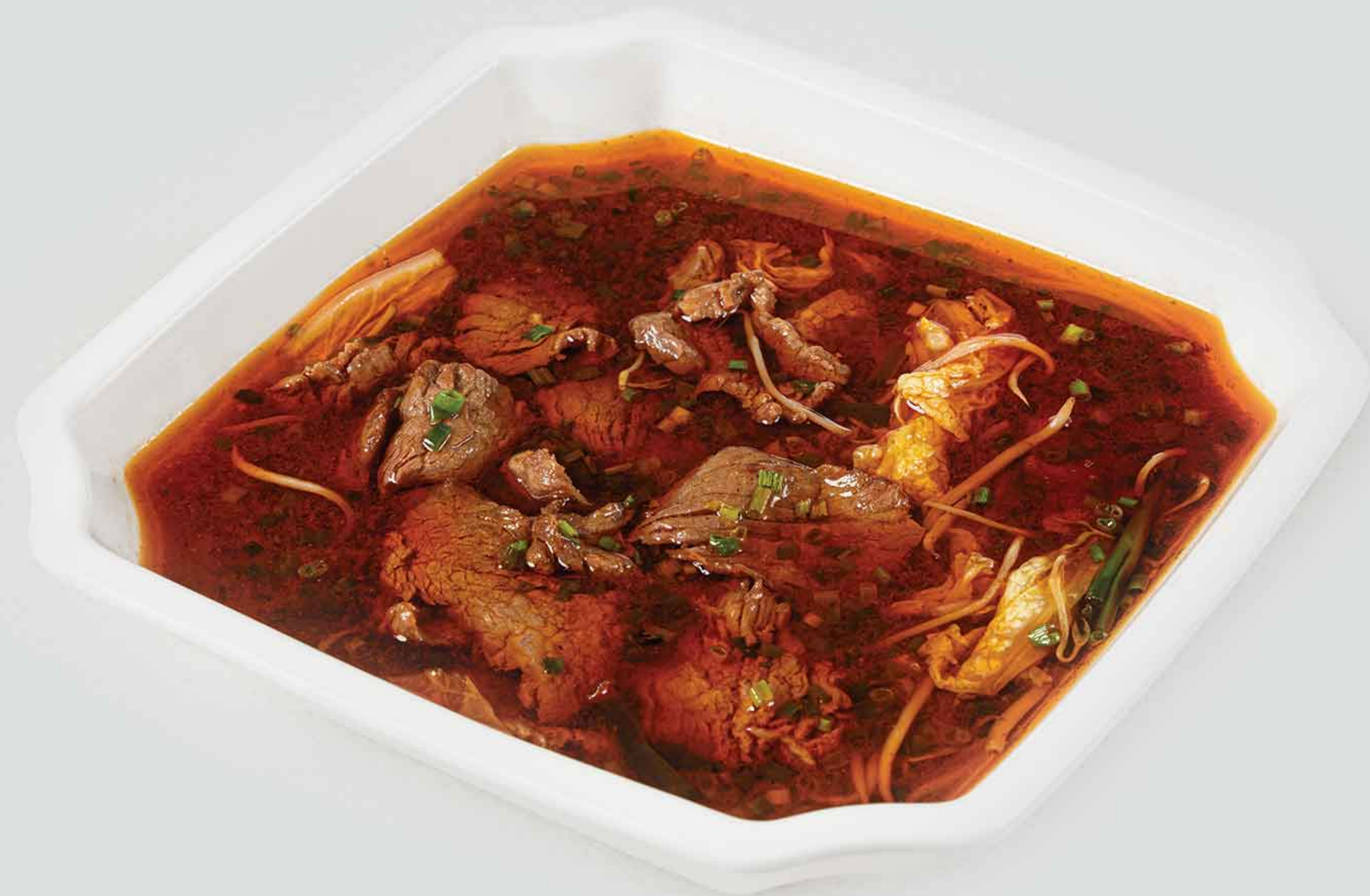
Szechuan Style Boiled Beef Slices