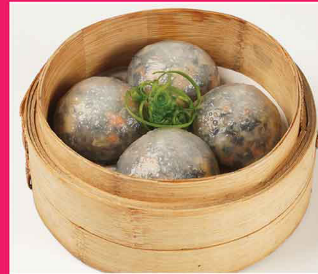
野菌豆根水晶餃 Steamed Assorted Mushroom Dumplings with Bean Curd MMK 12,600