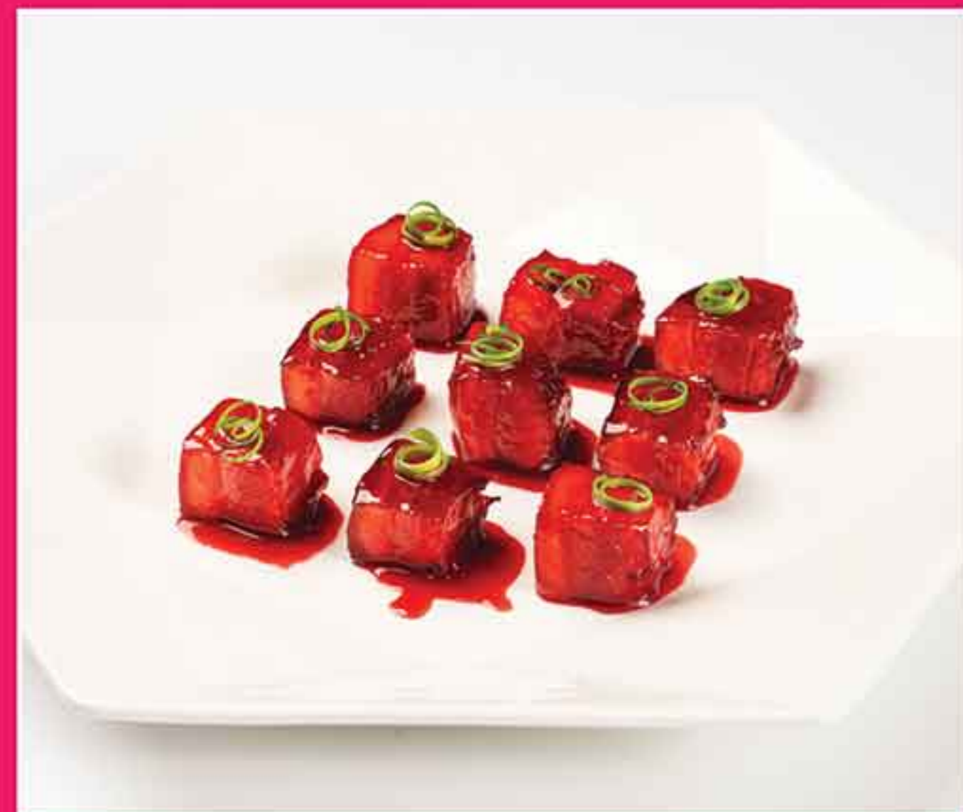
蜜汁叉烧 Honey Glazed Barbecued Pork MMK 35,000