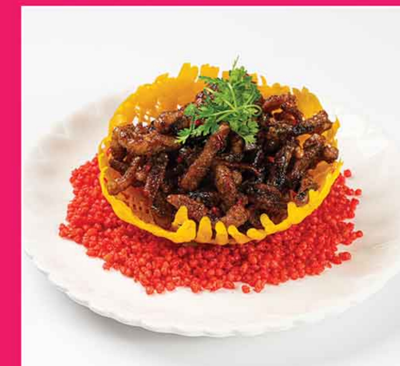
干焗脆鱈鱼 Stir-Fried Crispy Eel with Chinese Wine MMK 25,000