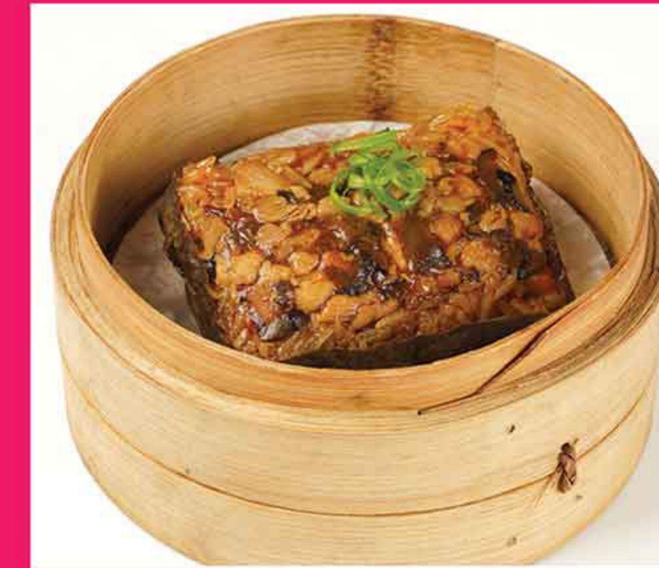
荷香珍珠糯米雞 Steamed Glutinous Rice with Chicken Wrapped in Lotus Leaf MMK 19,600