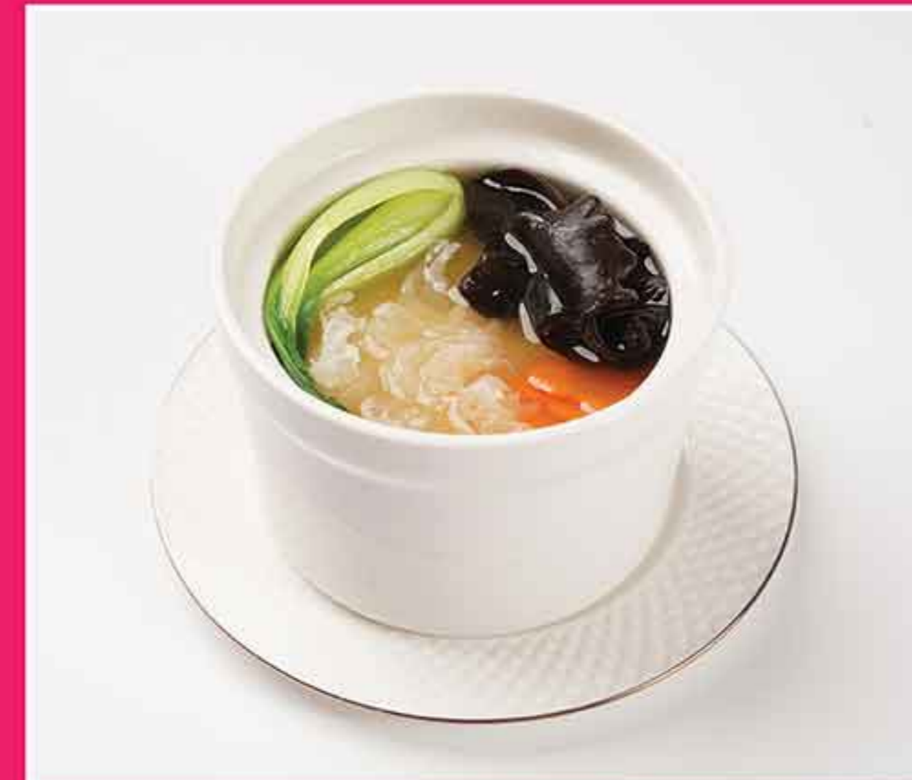
清炖蔬菜汤 Double Boiled Vegetables Consommé with Mushroom MMK 15,000