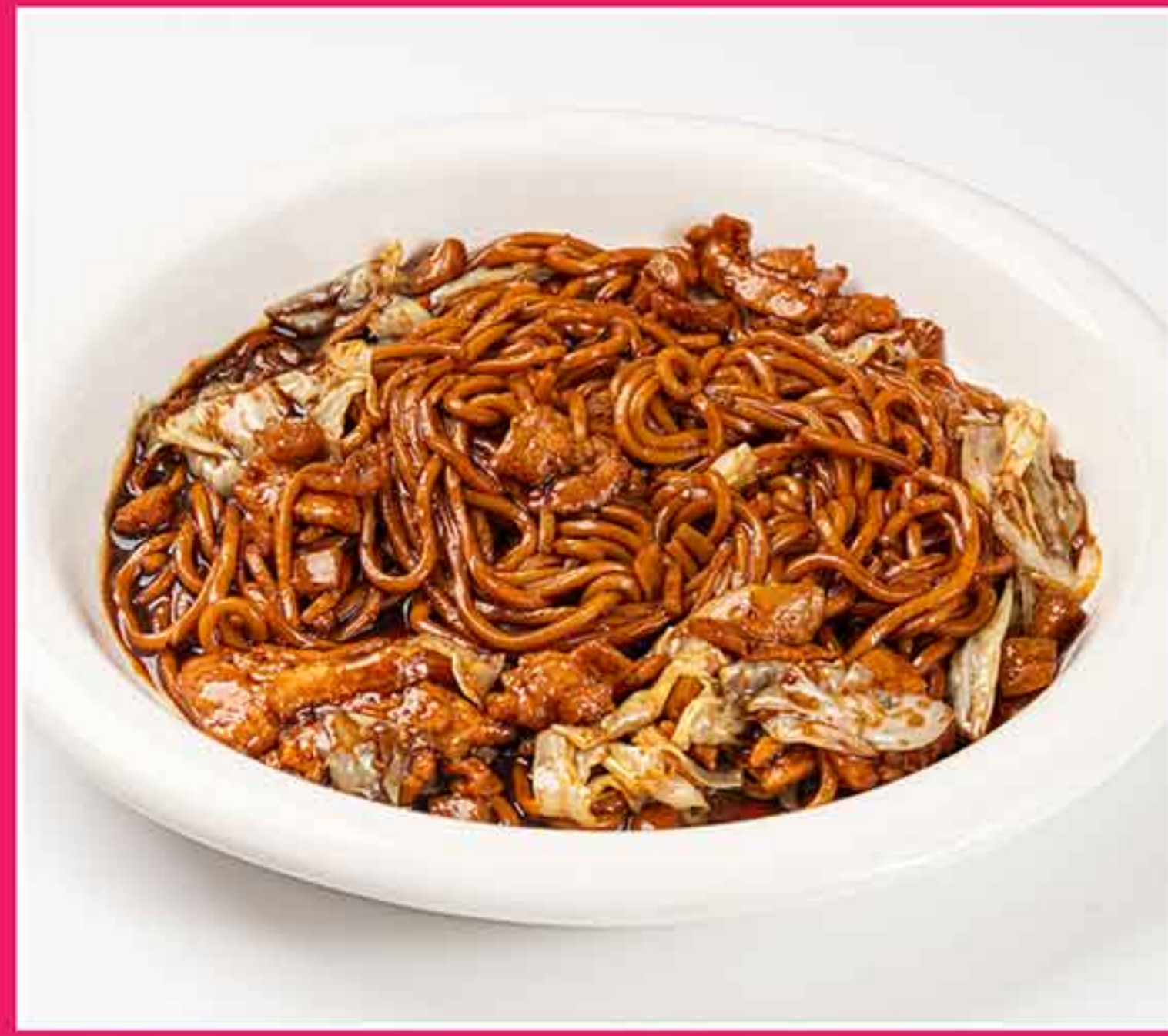
福建面 🍴 Hokkien Noodles MMK 15,000