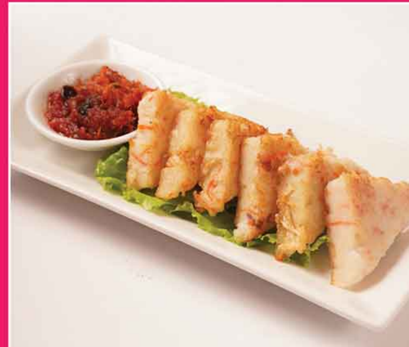
香煎蘿蔔糕 Pan-Fried Radish Cake with Dried Shrimps MMK 12,600