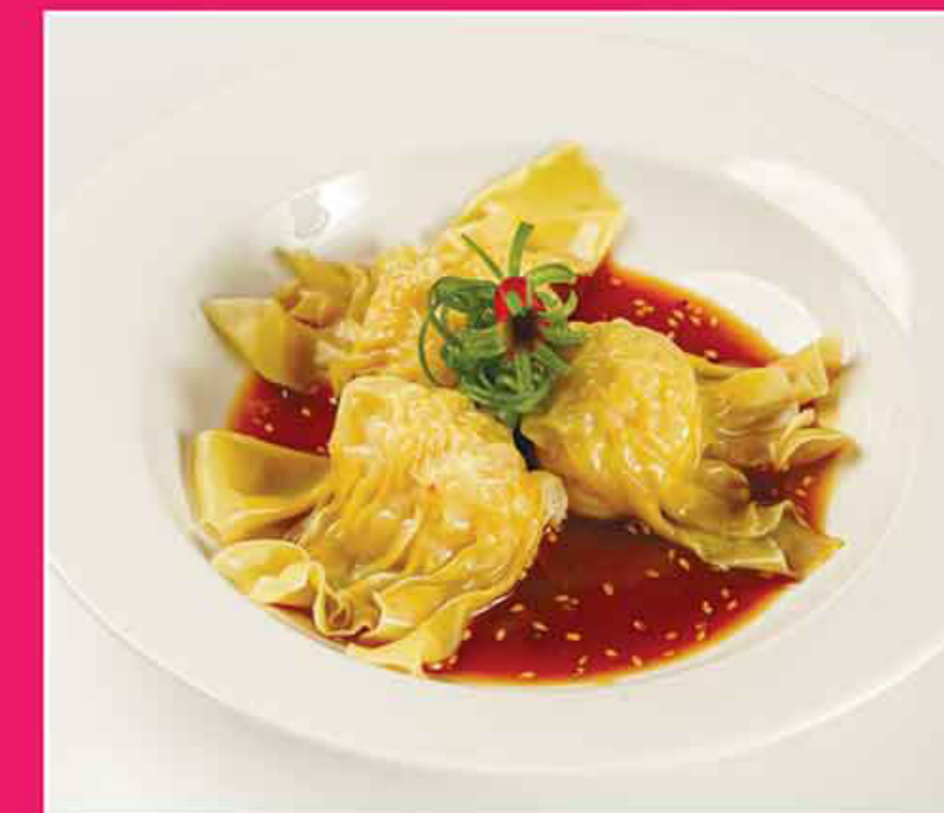
鮮蝦紅油撈雞肉餃子 Szechuan Style Poached Prawn and Chicken Dumplings MMK 10,500