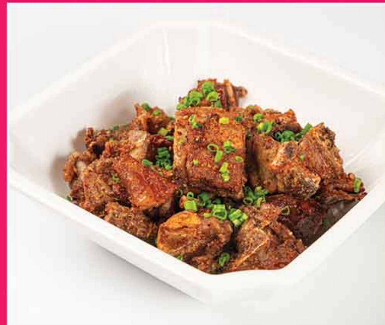
香脆椒盐炒 Wok Stir-Fried Duck with Salt & Pepper