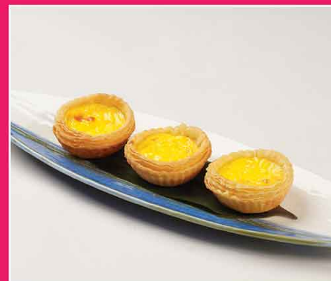
葡式迷你蛋撻仔 Baked Portuguese Mini Egg Tarts MMK 14,700