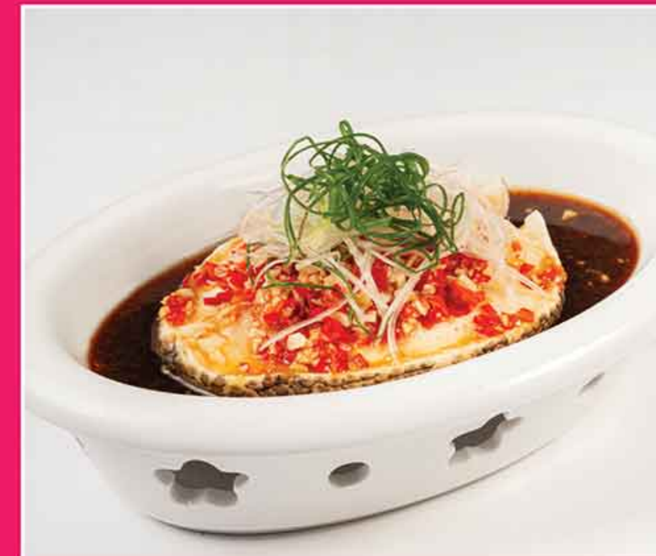
剁椒 Steamed Black Cod Fish with Chopped Pepper & Garlic