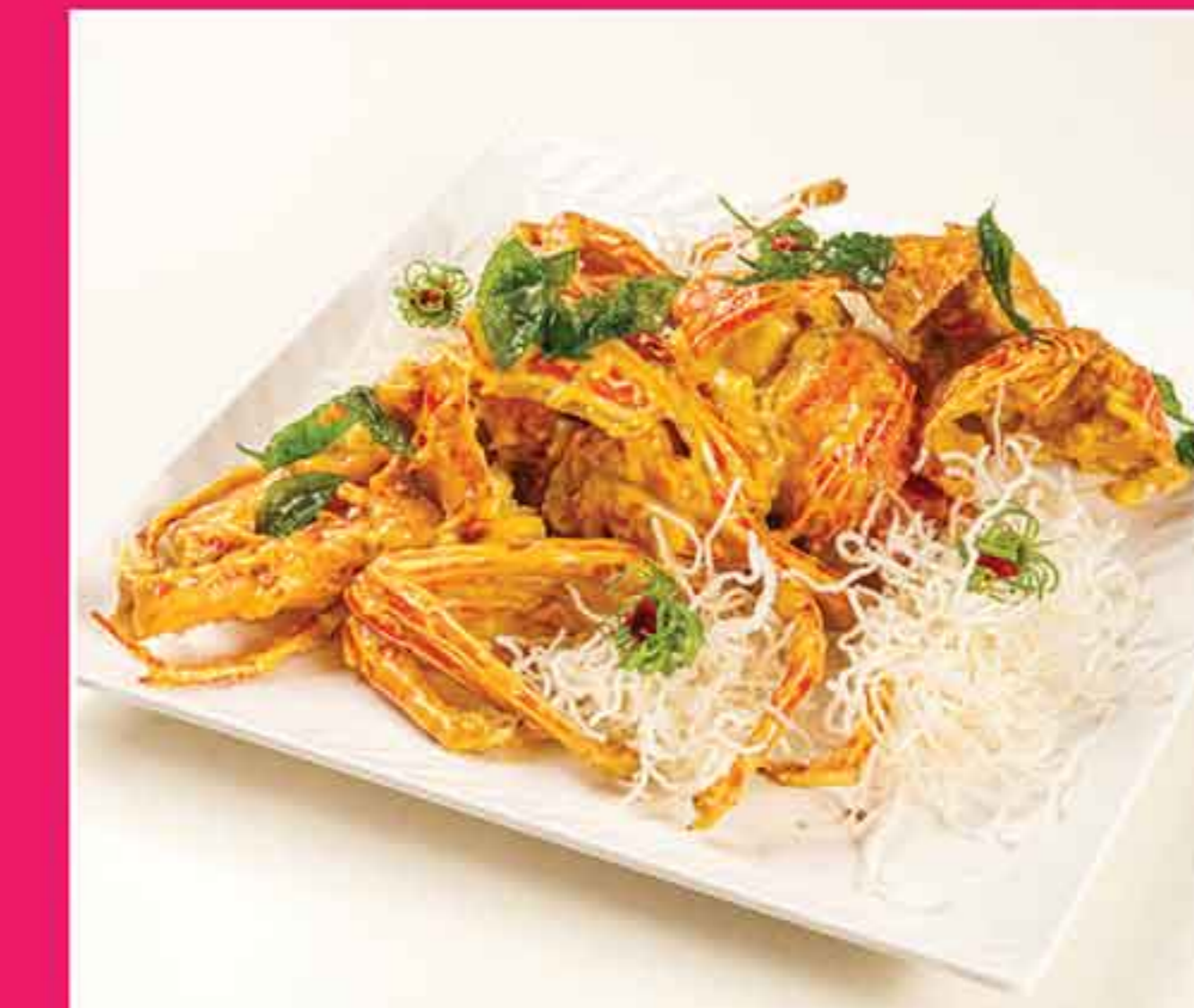
金瓜奶油 Wok-Fried Green Lobster with Pumpkin Buttermilk Sauce