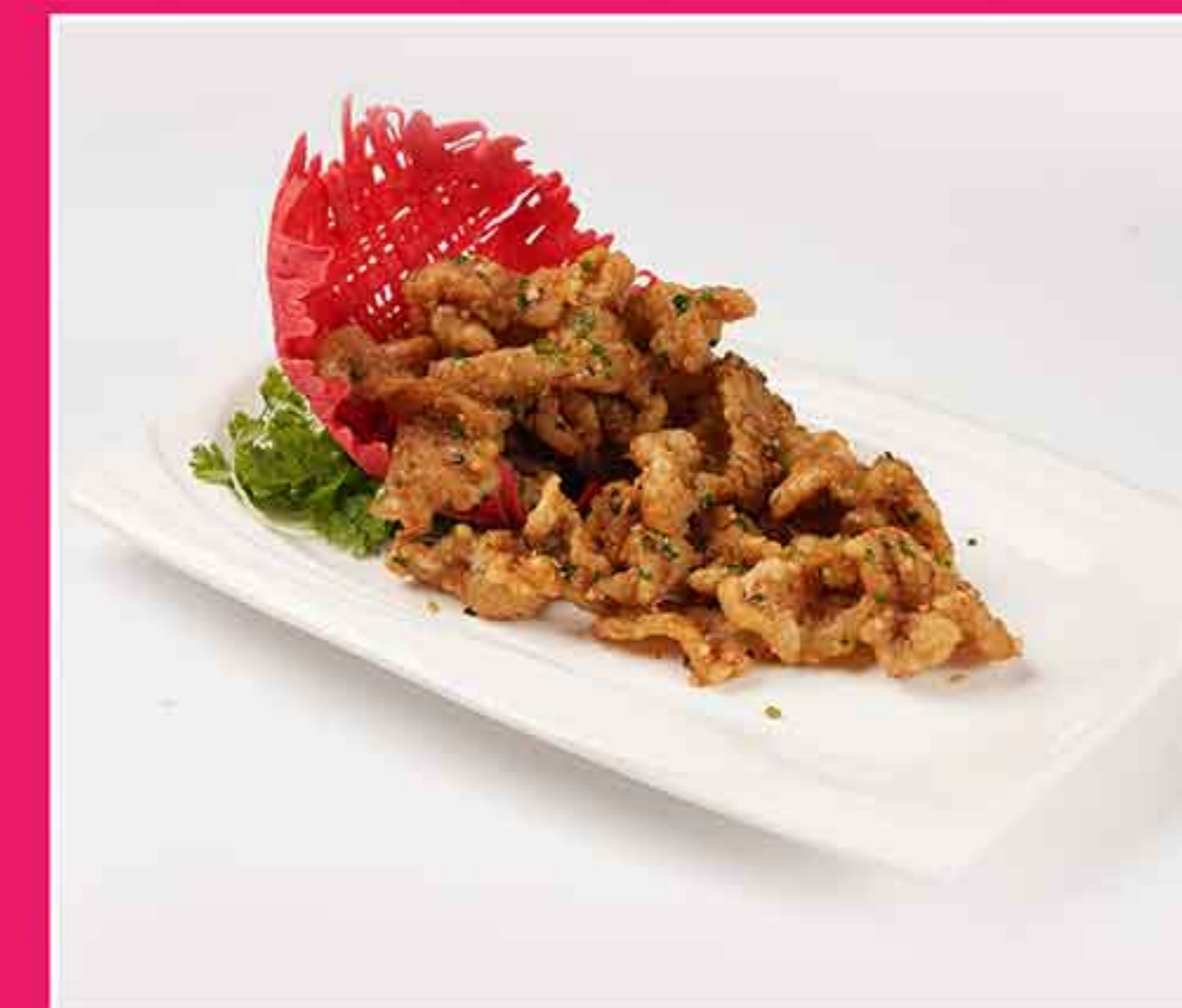
蒜米五花肉 🍴 Wok-Fried Pork Belly Slices with Whole Garlic MMK 20,000