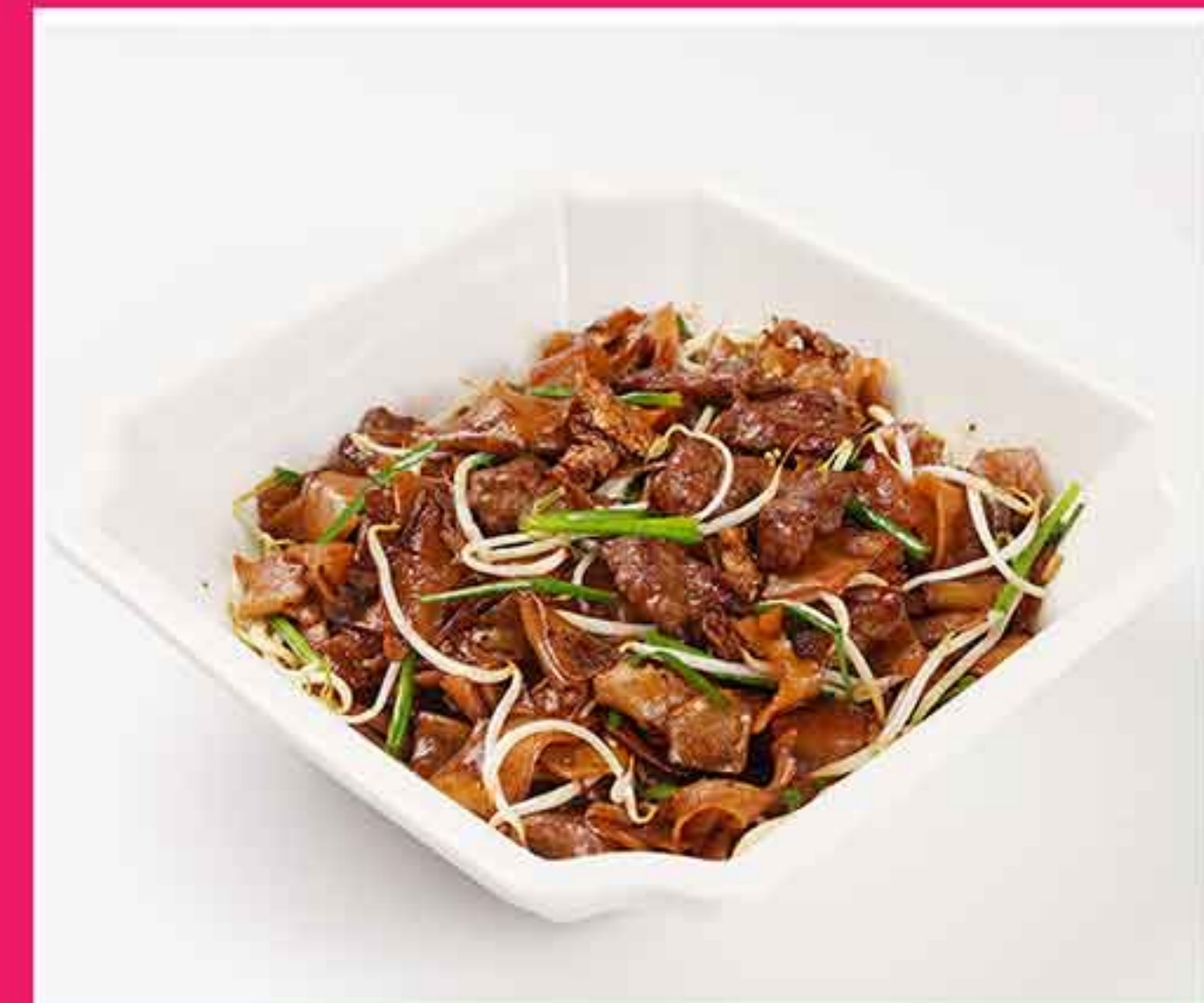
银芽乾炒牛肉河 Wok-Fried Rice Noodle with Sliced Beef and Bean Sprouts MMK 25,000