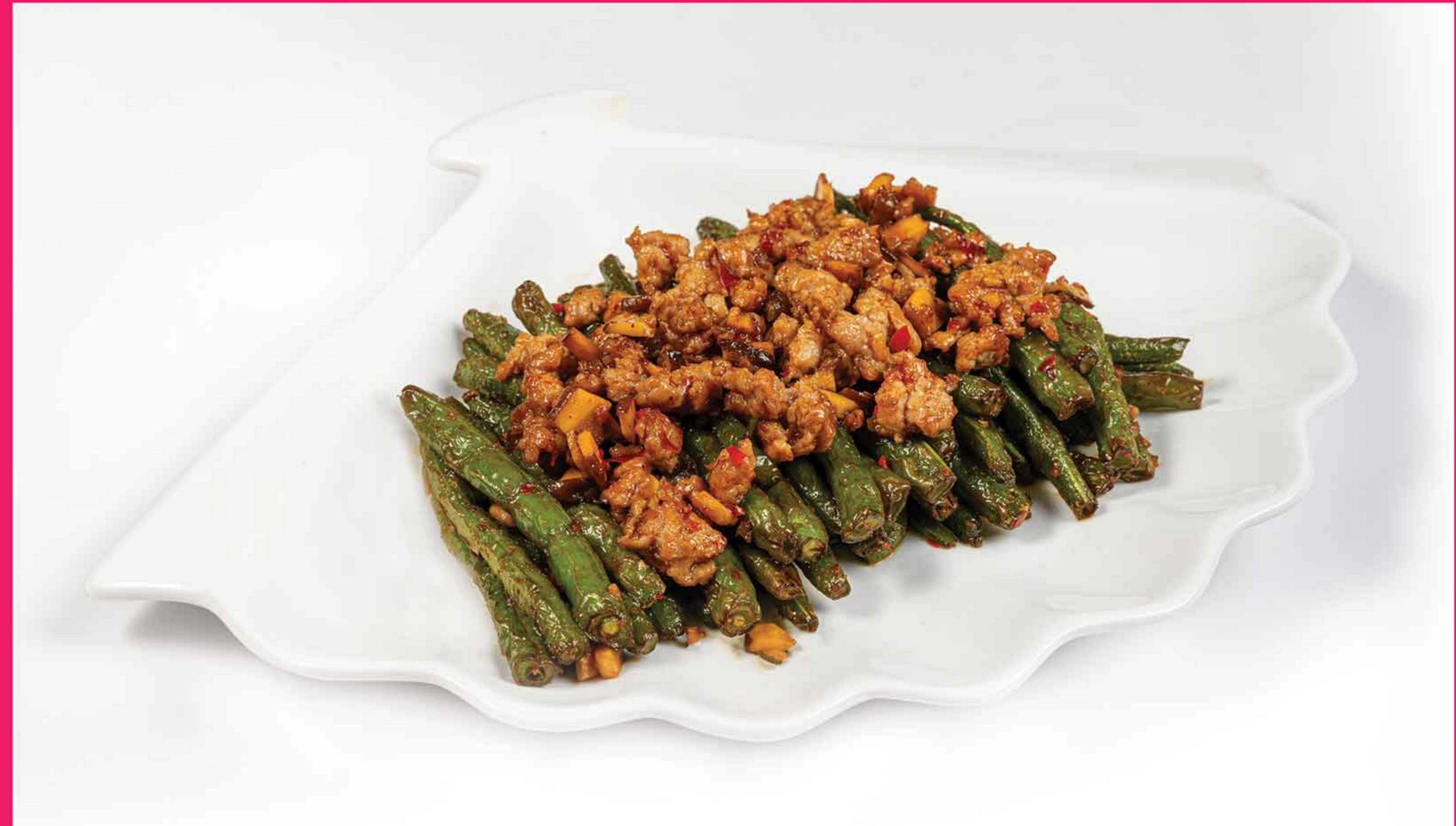
Szechuan Style Stir-Fried French Beans with Minced Pork