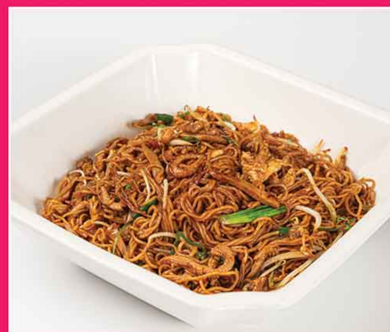
豉油皇鸭丝炒面 Wok-Fried Noodles with Shredded Duck Meat & Bean Sprouts