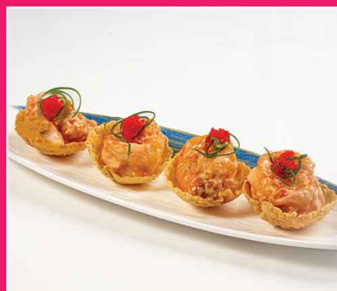
东瀛千岛脆大虾 🍤 Crispy King Prawns with Thousand Island Sauce MMK 45,000