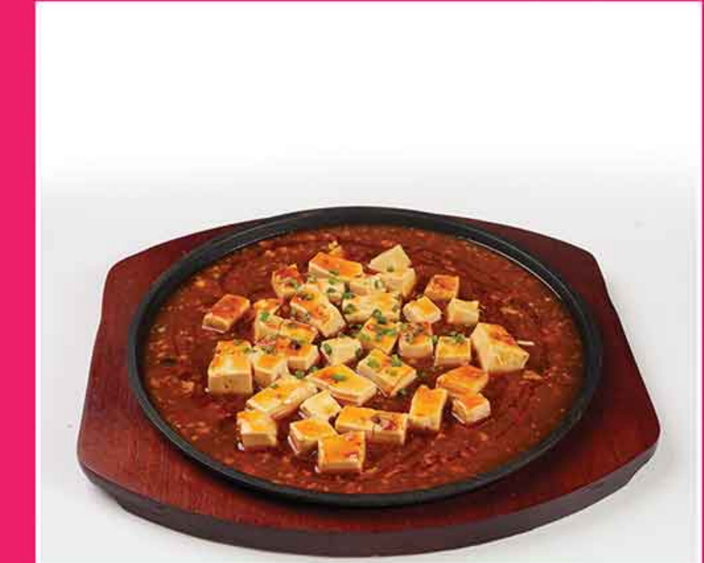
麻婆豆腐 🌶️ Mapo Tofu with Minced Pork MMK 15,000