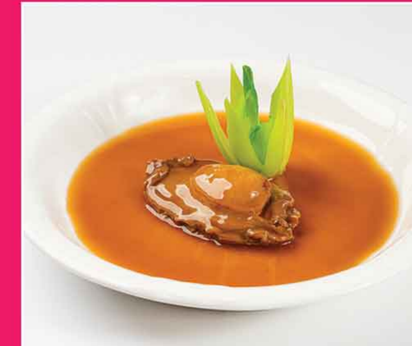
宫廷红烧2頭鲍鱼 Stewed Two-Head Abalone with Supreme Oyster Sauce MMK 180,000 (Per Portion)