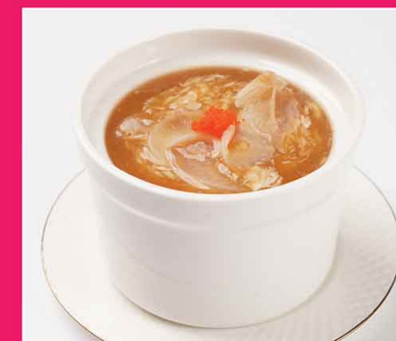
蟹肉鱼翅羹 Shark's Fin with Crab Meat Soup MMK 80,000