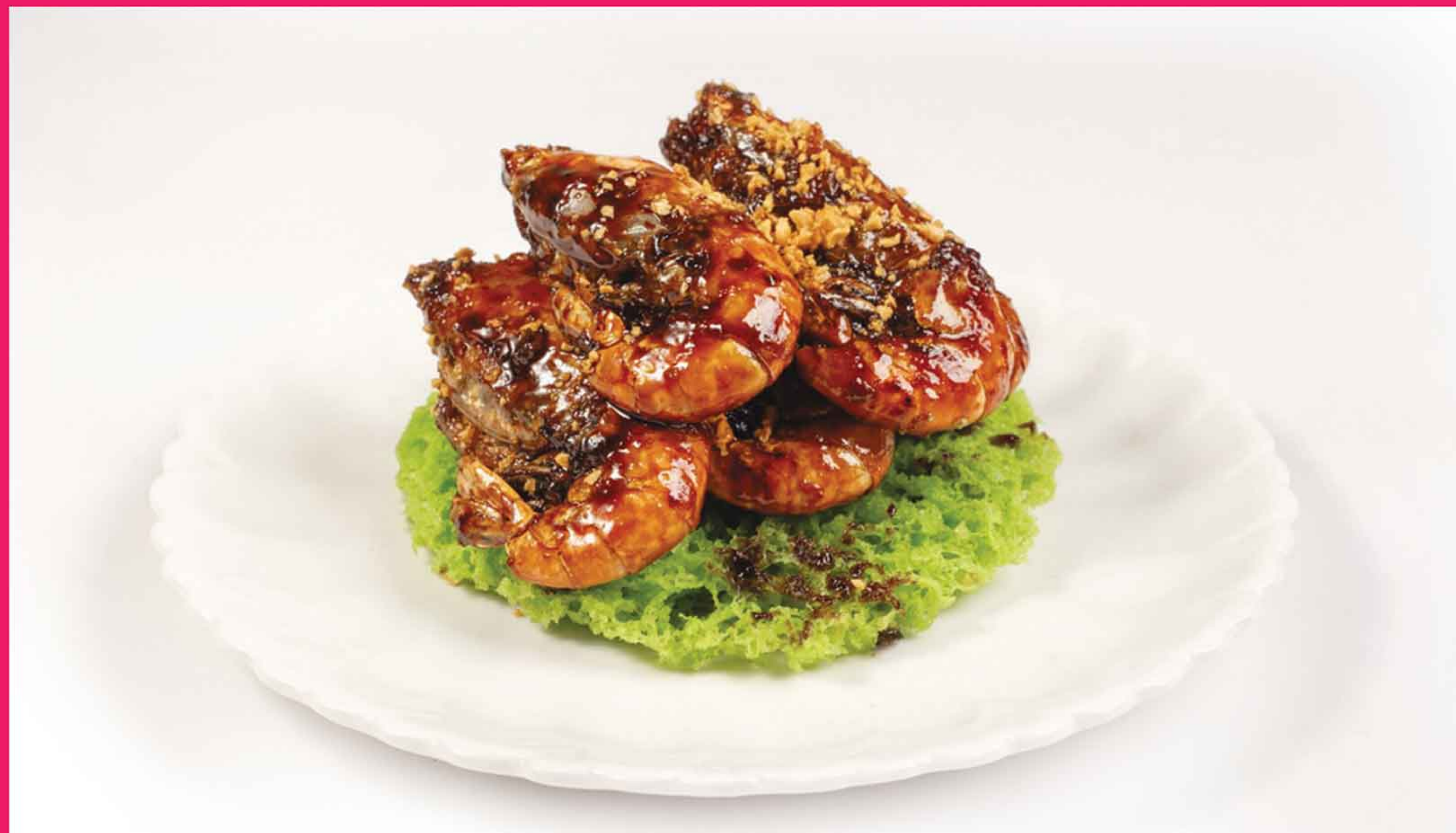
Fried River Prawns with Garlic and King Soya