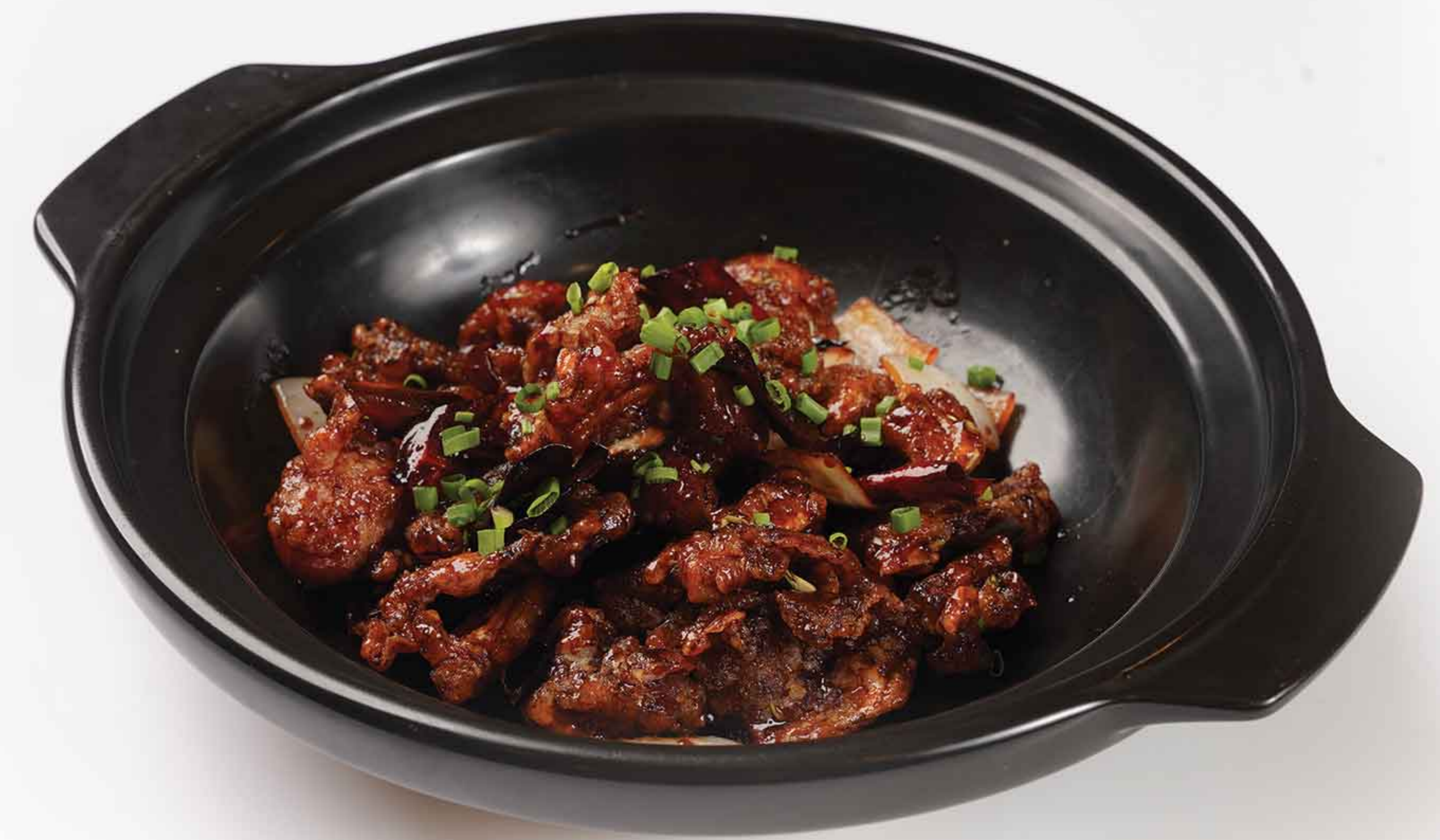
Sauteed Frog's Legs in Lemon Grass, Dried Chili Vinaigrette