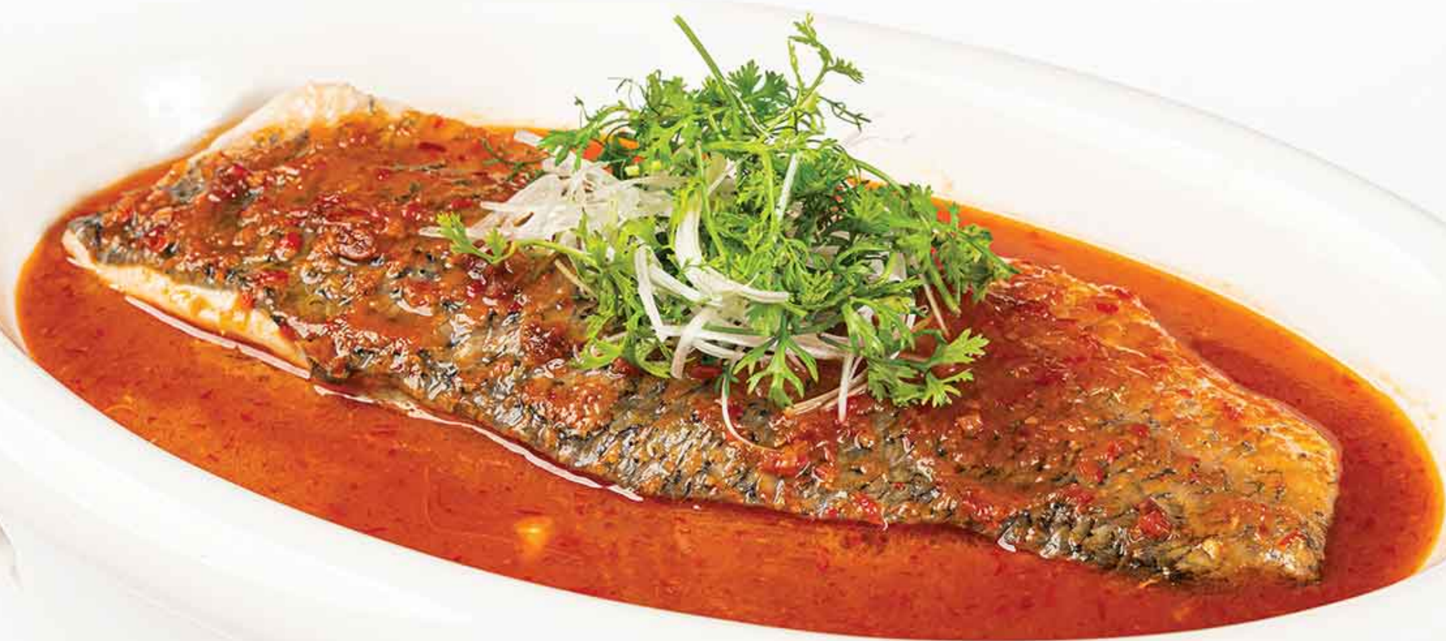
Steamed Seabass with Jiang Zheng Style