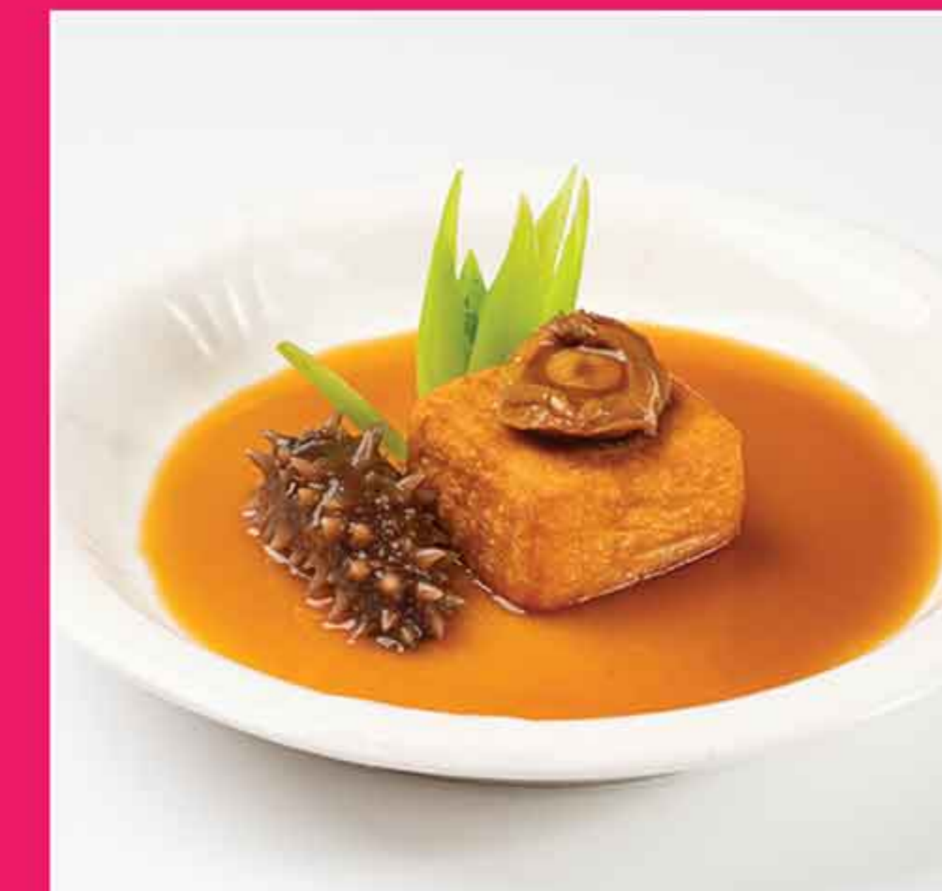
十頭鮑魚伴關東遼參 🍴 Braised Ten-Head Whole Abalone with Japanese Sea Cucumber and Broccoli MMK 80,000 (Per Portion)