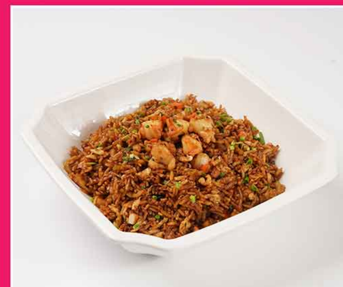
芋頭臘味海鮮炒飯 Taro and Sausage Fried Rice with Seafood MMK 20,000 (Single Portion) / 25,000