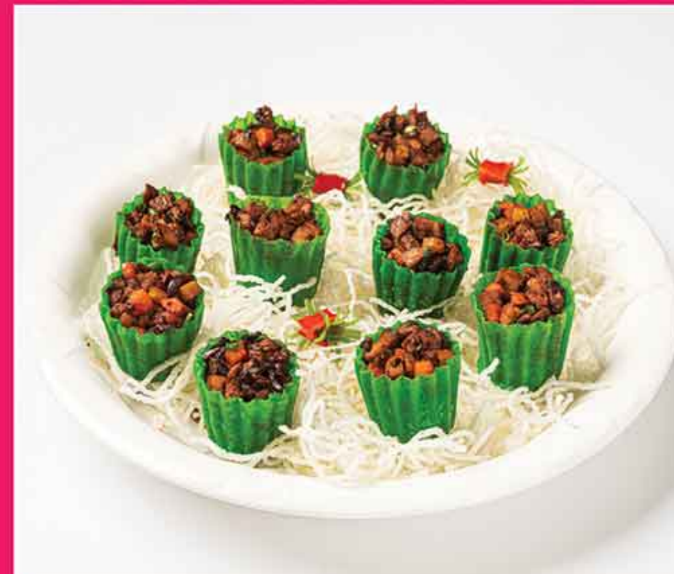
金杯鸭崧 Sautéed Duck Meat with Water Chestnut Served in Golden Cup