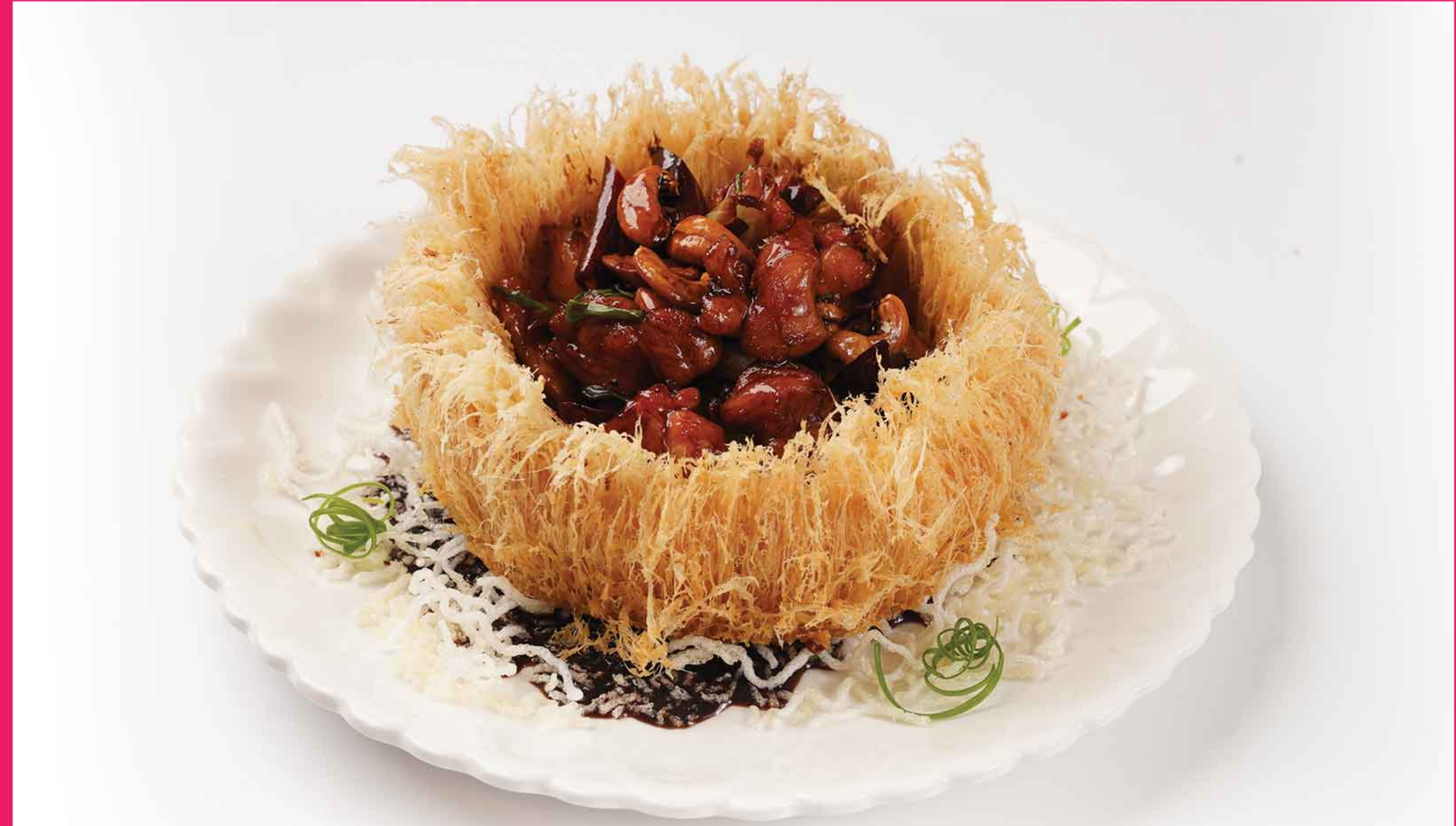
Kung Pao Chicken with Cashew Nuts and Dried Chili