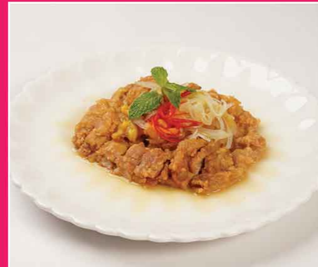
西檸香酥雞脯 Golden Fried Crispy Boneless Chicken Fillet, Topped with Fresh Lemon Sauce MMK 10,000/ 20,000 (Single Portion)