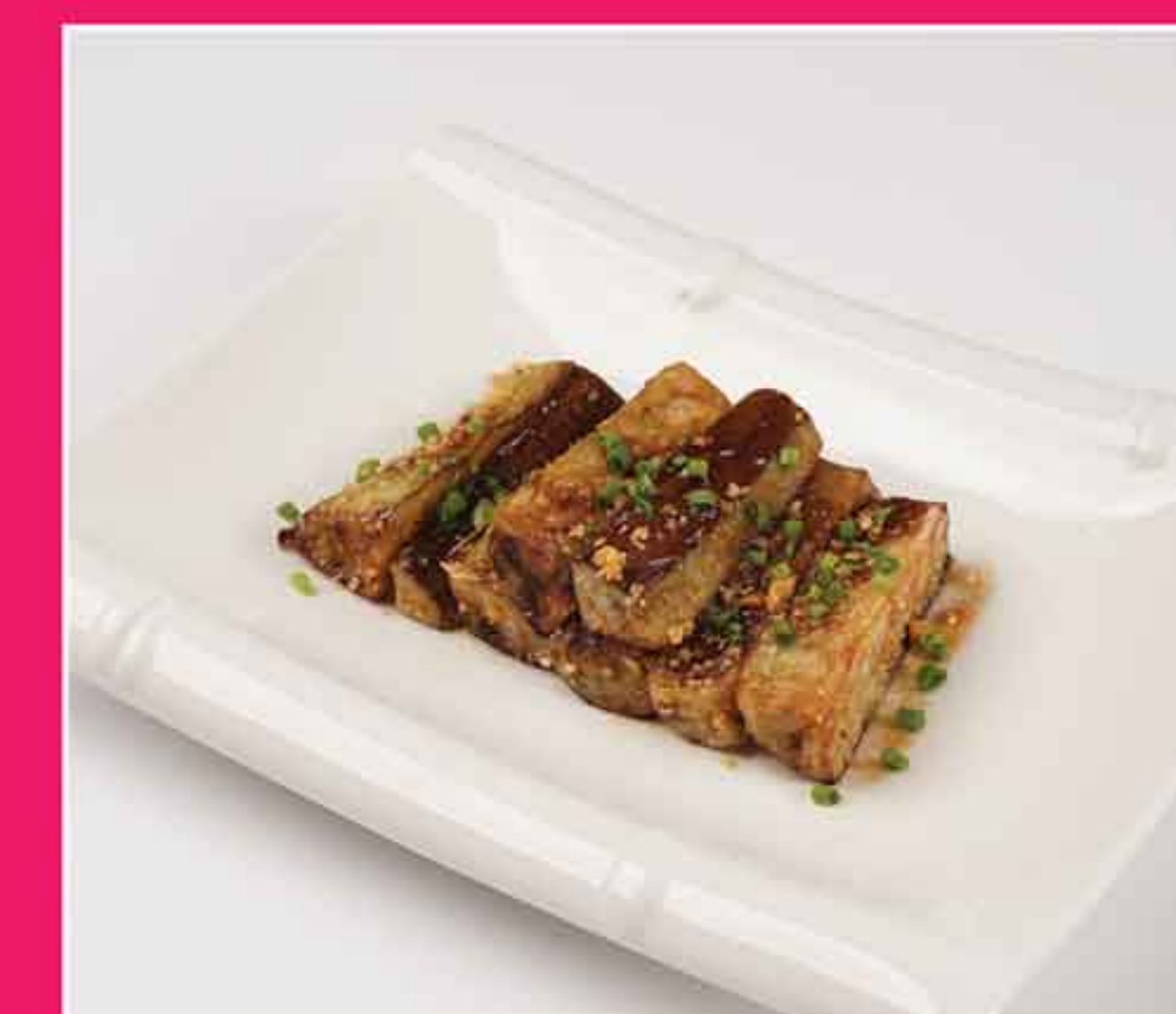
蒜香茄子 🍆 Cold Eggplant with Garlic MMK 15,000