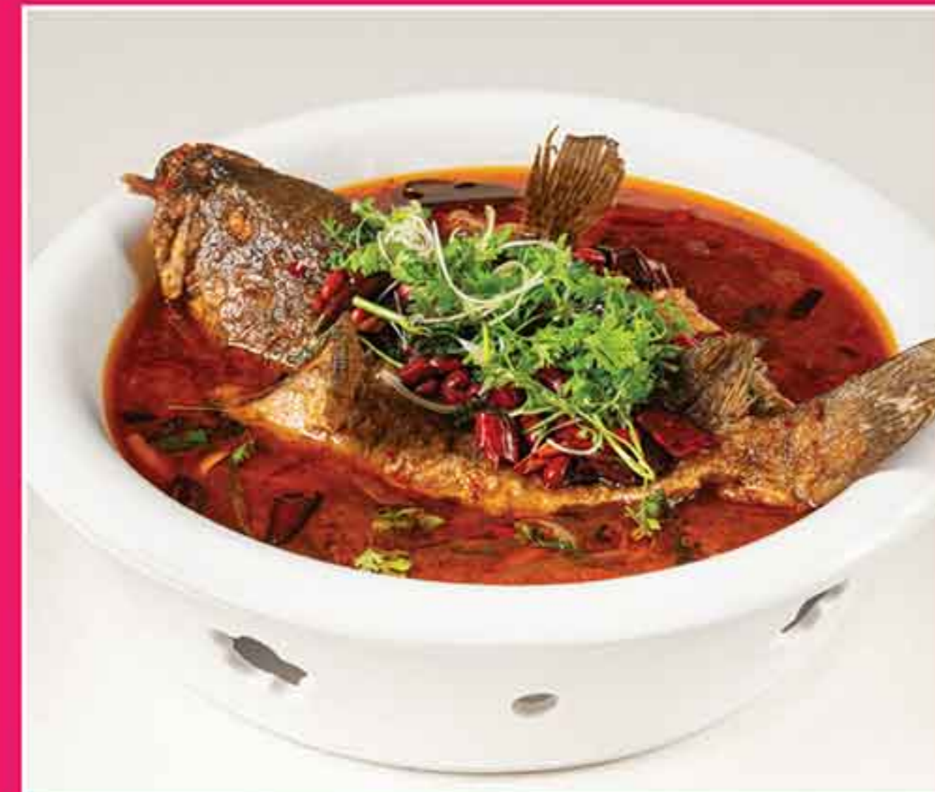
川味辣 Grouper Fish with Szechuan Style