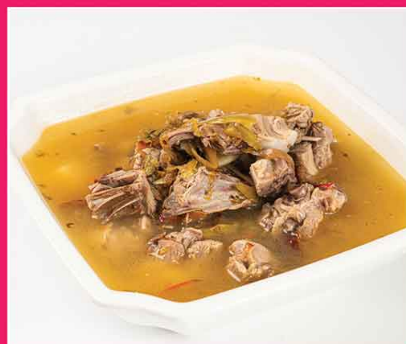
咸菜鸭骨汤 Poached Duck Soup with Tomato & Salted Vegetable