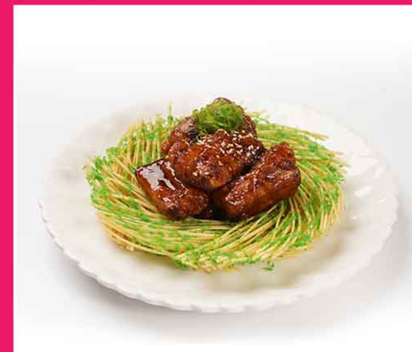
芝麻烧汁排骨王 Stir-Fried Pork Ribs with Chinese BBQ Sauce MMK 35,000