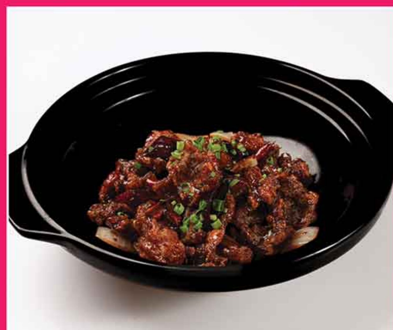
香茅辣椒干爆田鸡 🍴 Sautéed Frog's Legs in Lemon Grass, Dried Chili Vinaigrette MMK 25,000