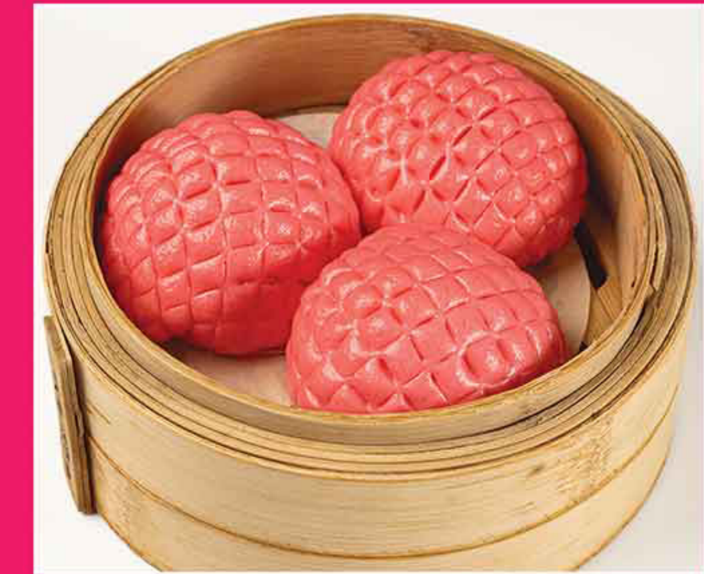
港式蜜汁叉燒包 Steamed Honey Glazed Barbecue Pork Buns MMK 12,600