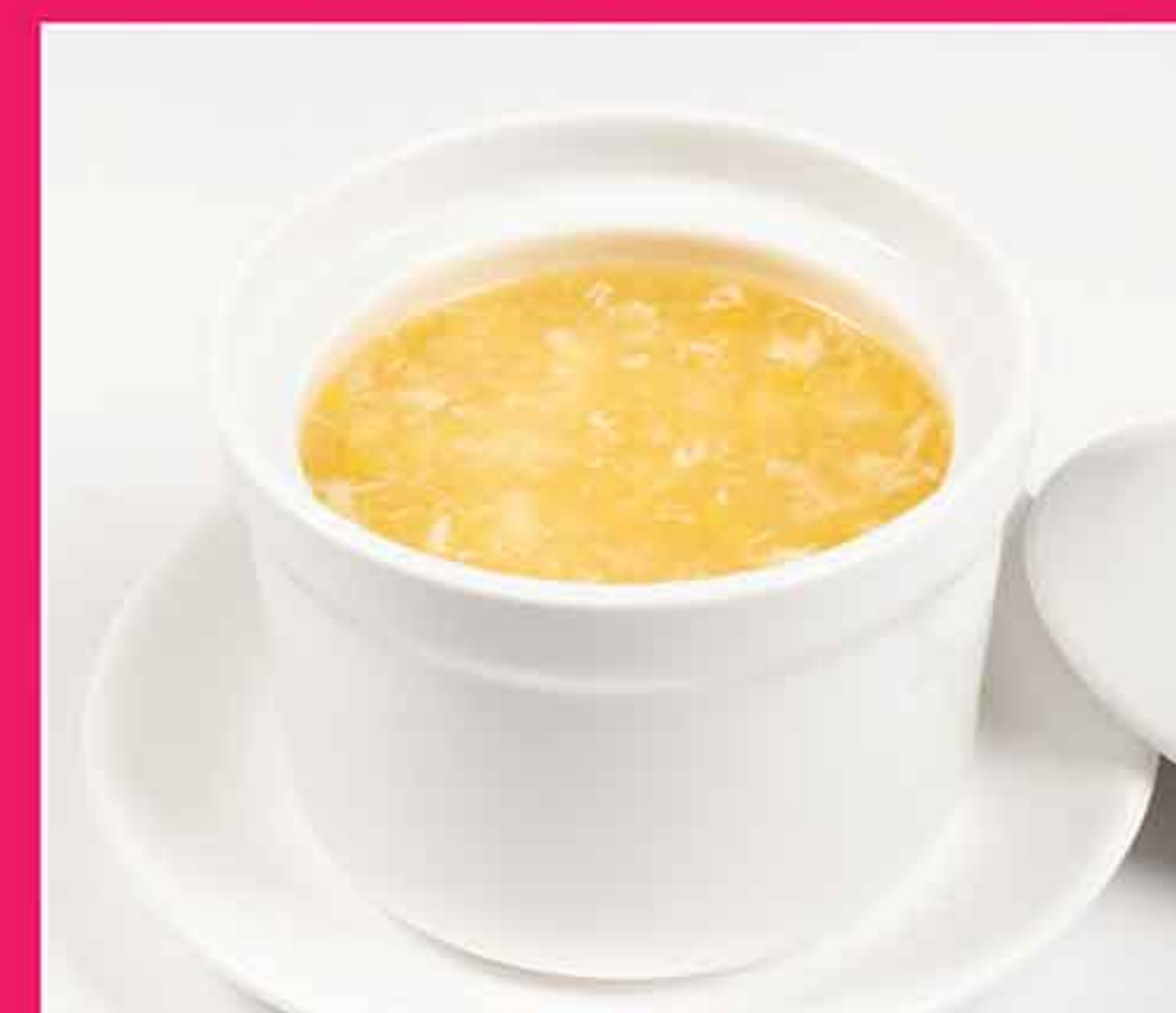
凤液玉米羹 Sweet Corn Soup with Crab Meat and Snow Fungus MMK 15,000