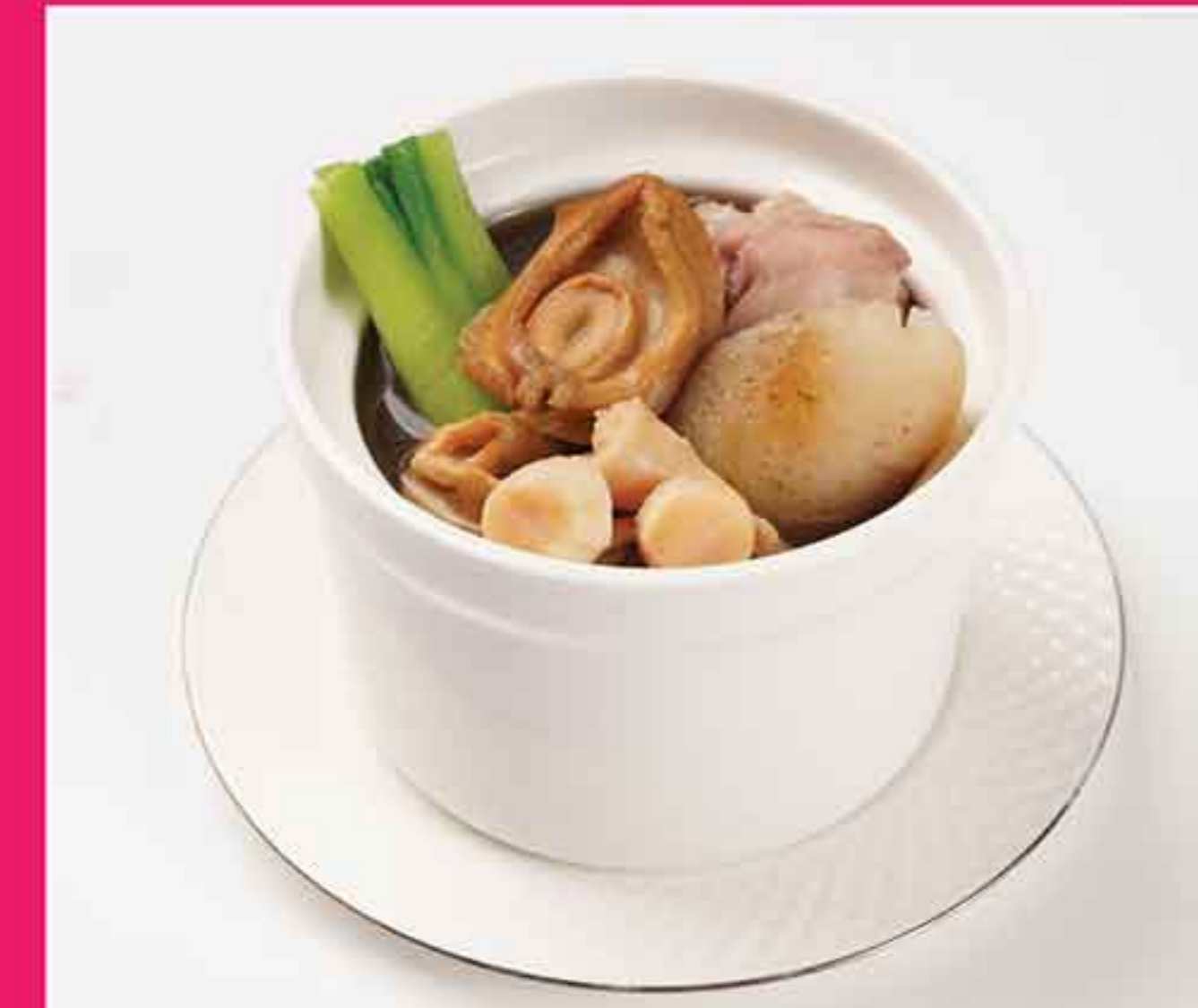
迷你佛跳墙 🍴 Mini Treasure from the Sea (Pre-order) MMK 80,000 (Per Portion)