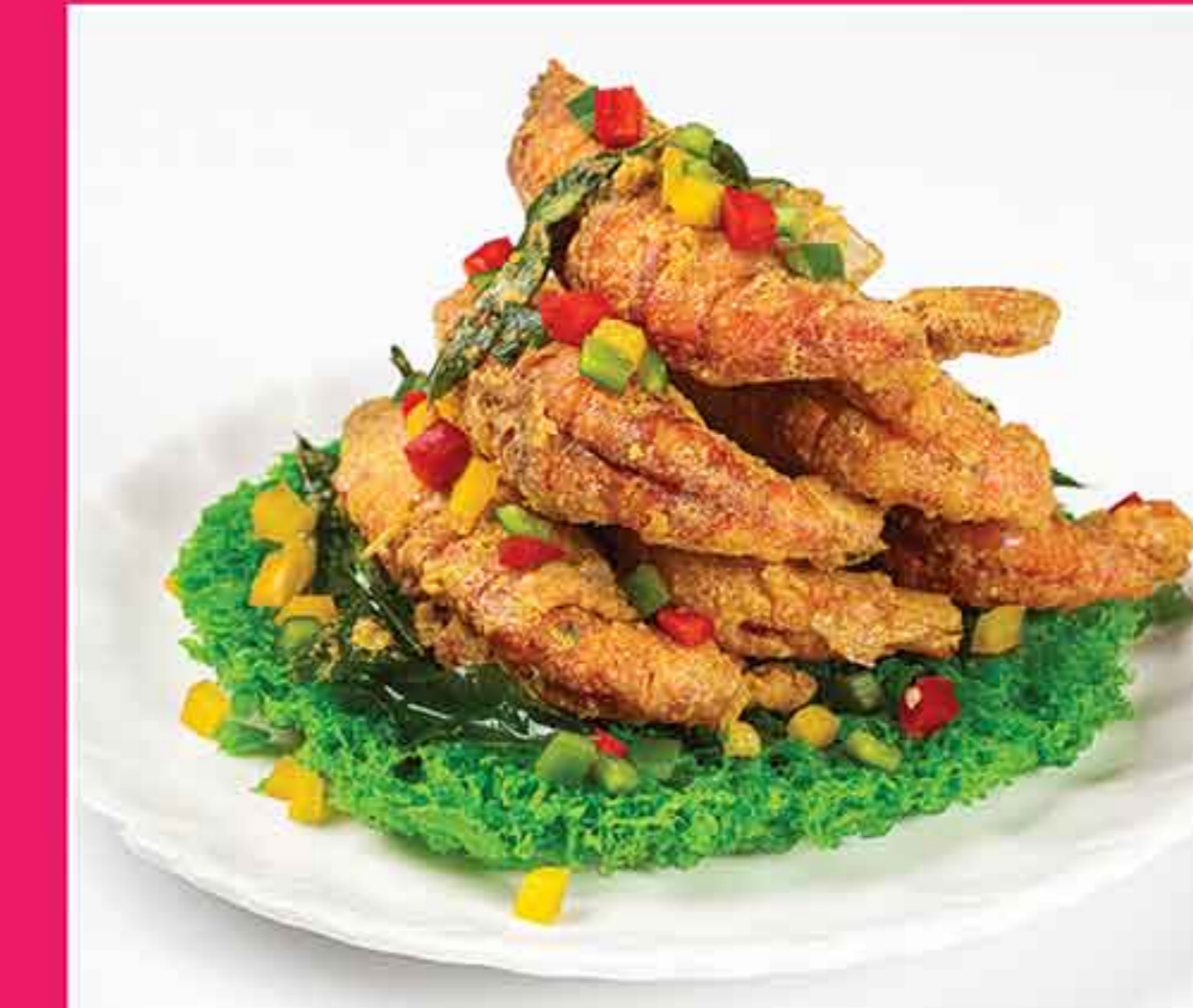
黄金咸蛋 Golden Salted Egg Yolk