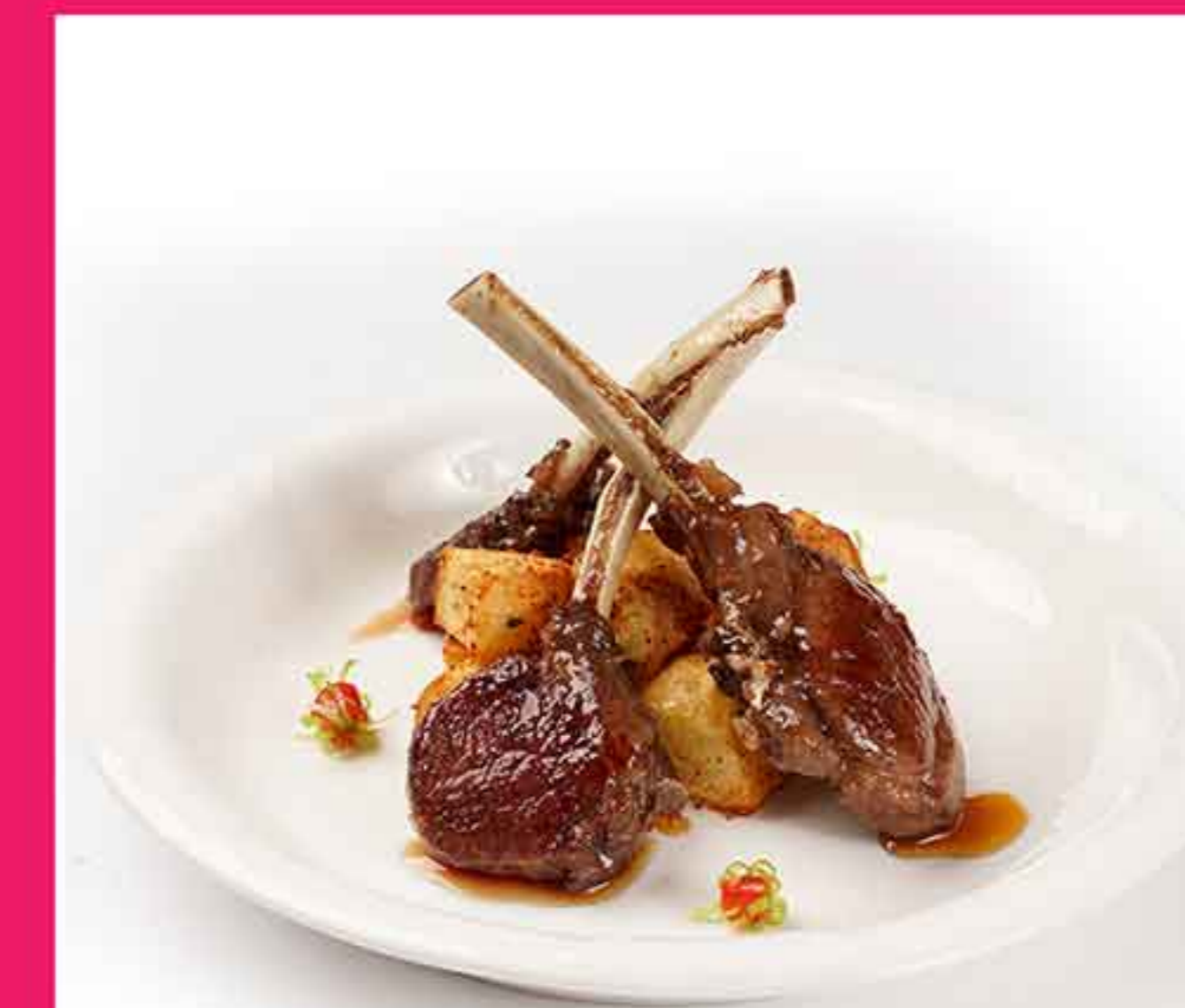
香茅小羊排 🍴 Pan Grilled Marinated Lamb Chops with Lemon Grass MMK 35,000 (Per Portion)