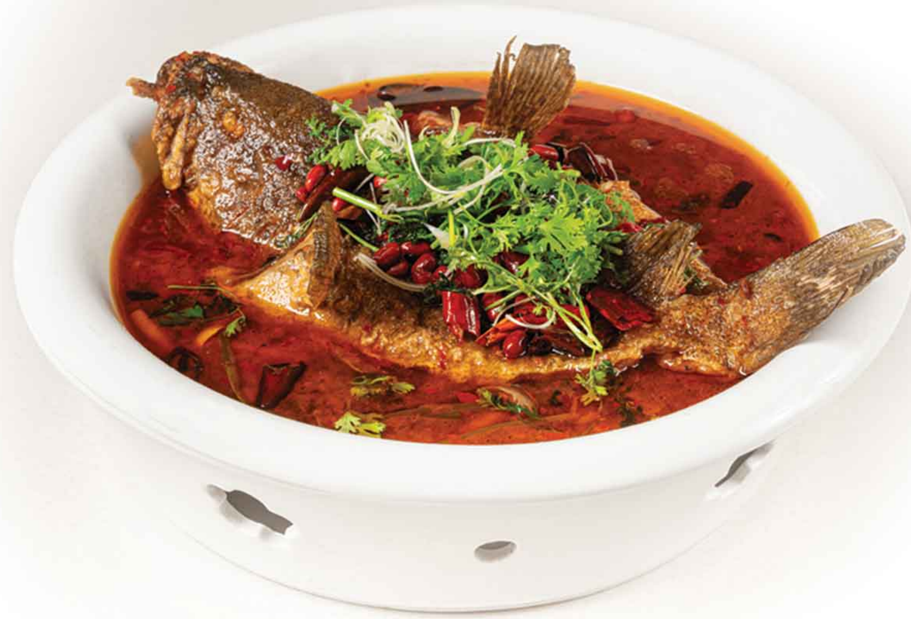
Grouper Fish with Szechuan Style