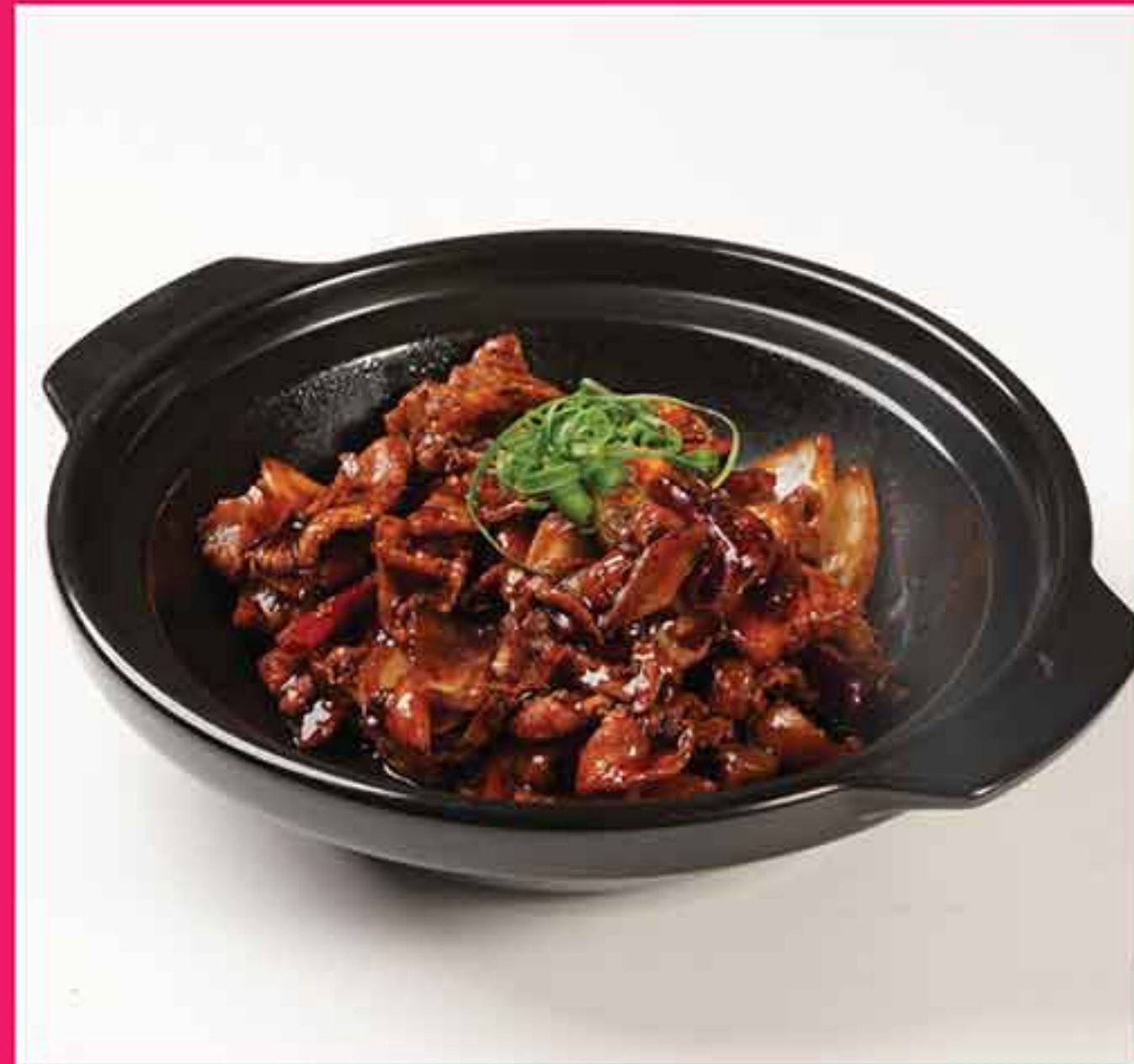
咸鱼花腩煲 Stewed Pork Belly with Salted Fish MMK 15,000 (Single Portion) / MMK 20,000