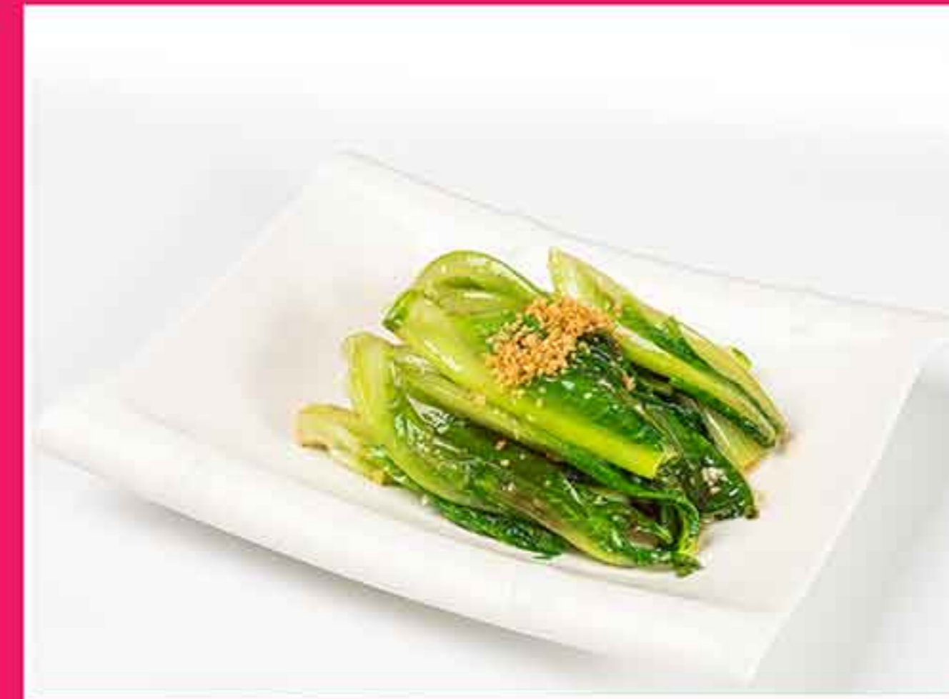
蒜辣 Roman Lettuce with Garlic