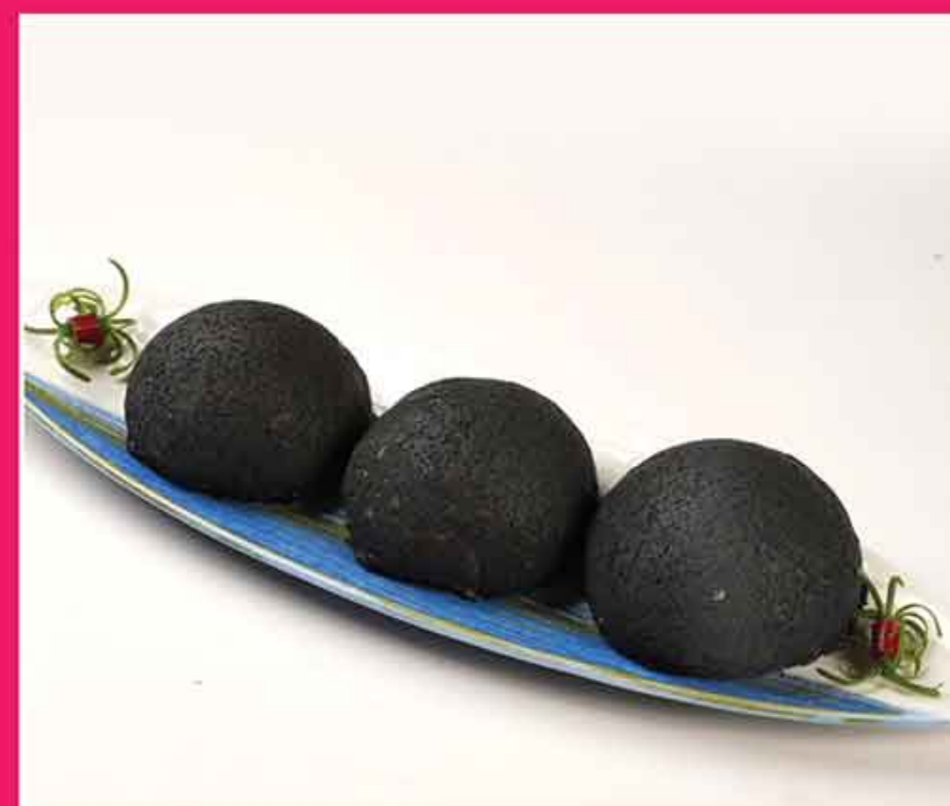
自製竹炭雪山包 Oven-Baked Charcoal Snow Buns MMK 12,600