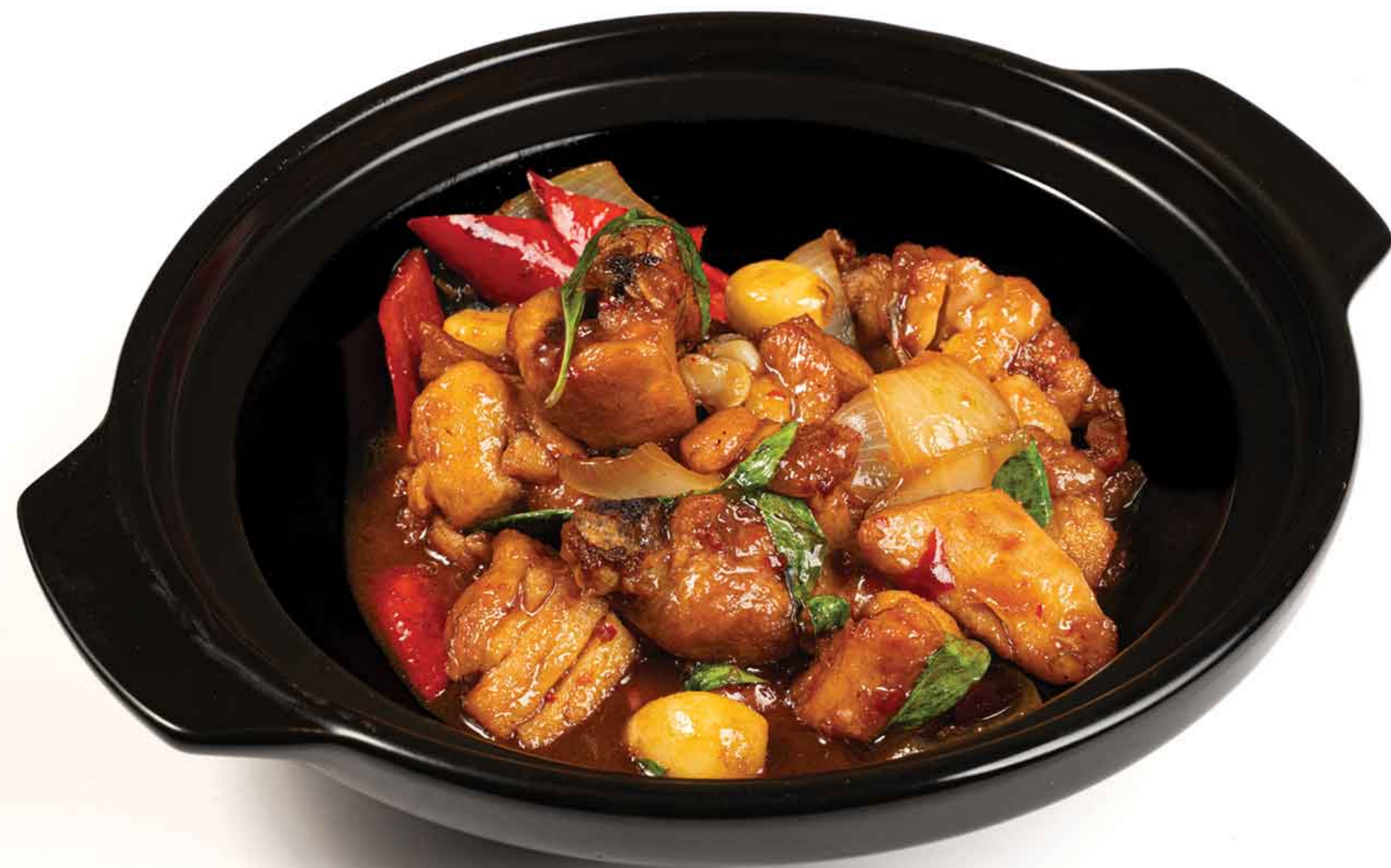
Taiwanese Style Chicken with Basil